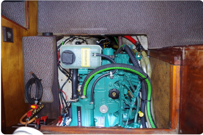
Vindö 50 msp269542 18