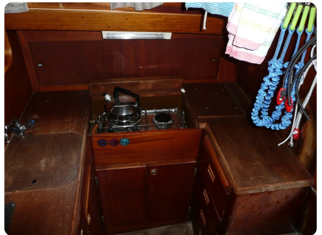
Vindö 50 msp269542 9