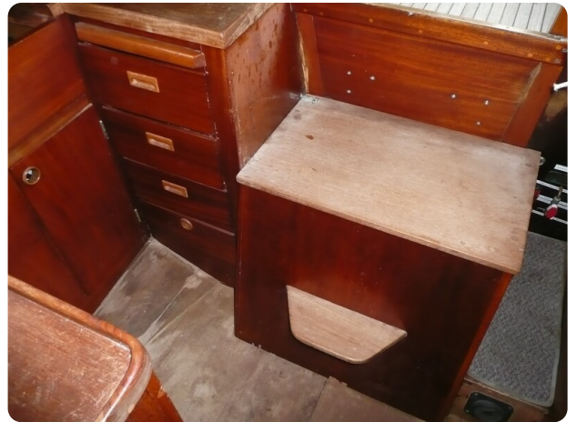
Vindö 50 msp269542 7