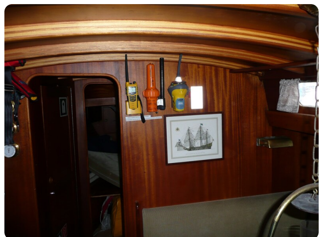
Vindö 50 msp269542 11