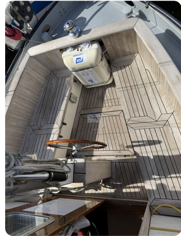
Vikingbank 1100 HOPPETOSSE 57