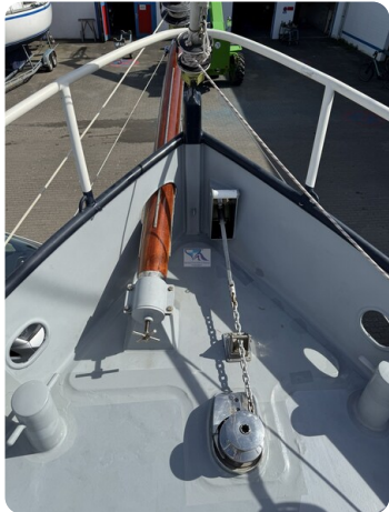
Vikingbank 1100 HOPPETOSSE 71