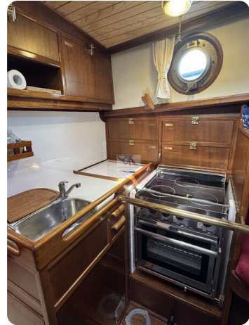
Vikingbank 1100 HOPPETOSSSE 22