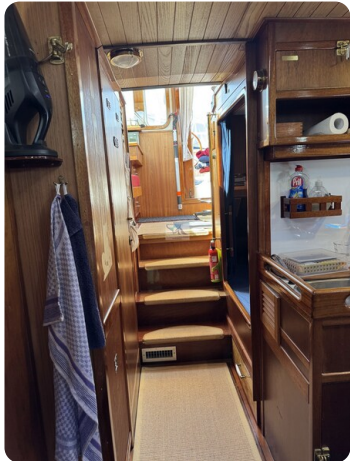
Vikingbank 1100 HOPPETOSSSE 39