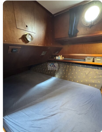
Vikingbank 1100 HOPPETOSSSE 32