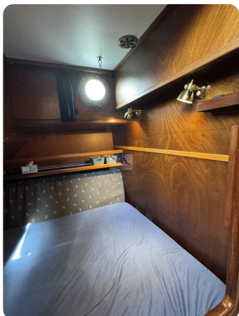
Vikingbank 1100 HOPPETOSSSE 33