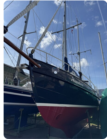
Vikingbank 1100 HOPPETOSSSE 1