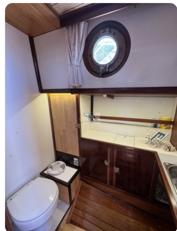
Vikingbank 1100 HOPPETOSSSE 36