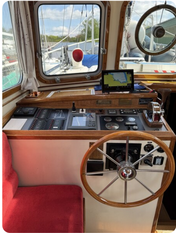
Vikingbank 1100 HOPPETOSSE 47