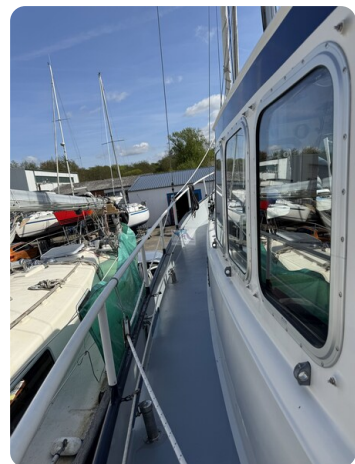
Vikingbank 1100 HOPPETOSSE 63