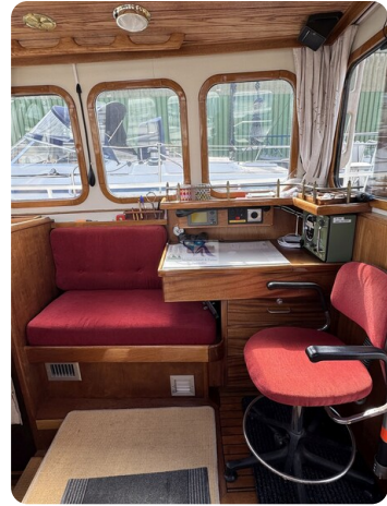
Vikingbank 1100 HOPPETOSSE 45