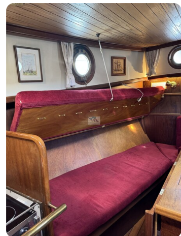
Vikingbank 1100 HOPPETOSSSE 24