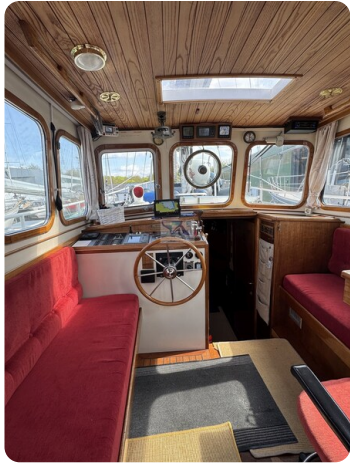
Vikingbank 1100 HOPPETOSSE 42