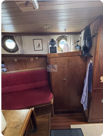
Vikingbank 1100 HOPPETOSSSE 23