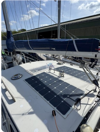
Vikingbank 1100 HOPPETOSSE 64