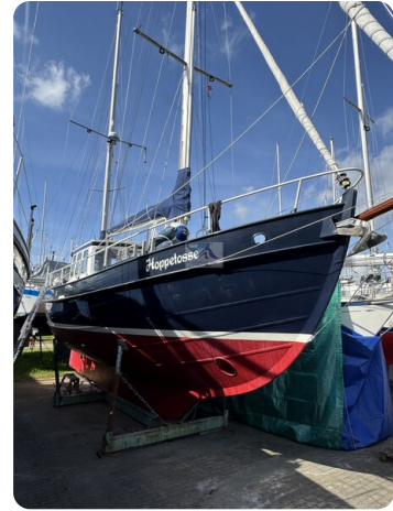
Vikingbank 1100 HOPPETOSSSE 88