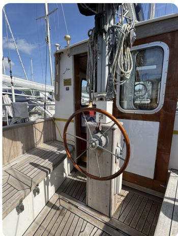
Vikingbank 1100 HOPPETOSSE 60