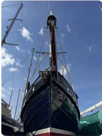
Vikingbank 1100 HOPPETOSSSE 91