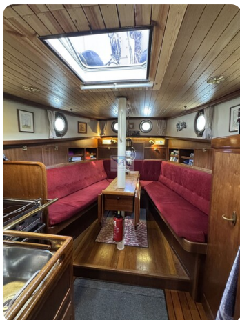
Vikingbank 1100 HOPPETOSSSE 18