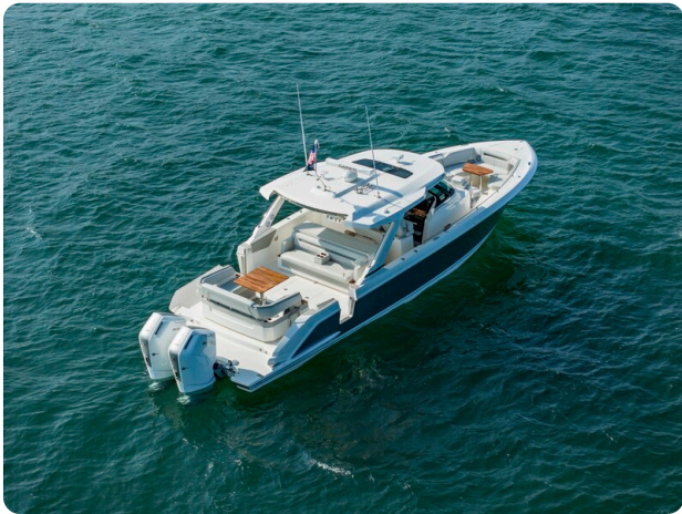
Tiara 43LS aerial