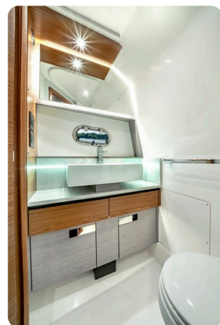
Tiara 43LS head