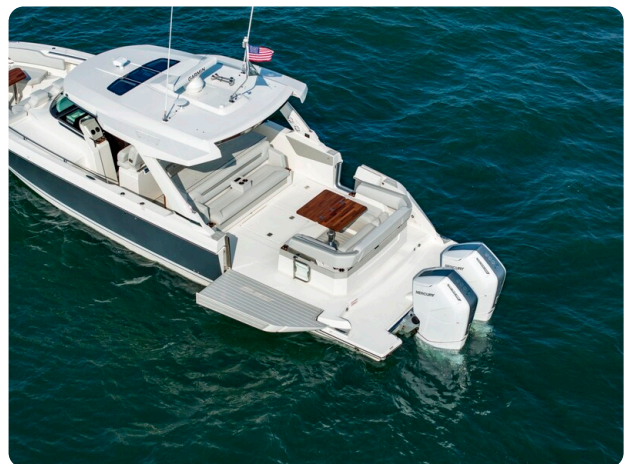
Tiara 43LS terrace detail