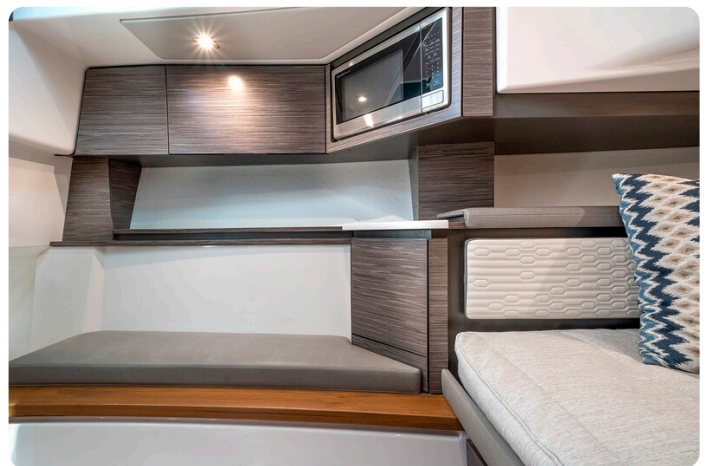
Tiara 43 LS interior detail