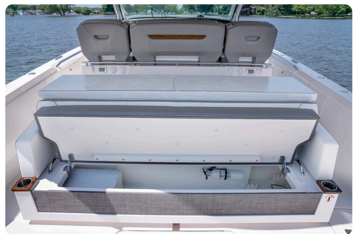
Tiara 43 LS aft storage