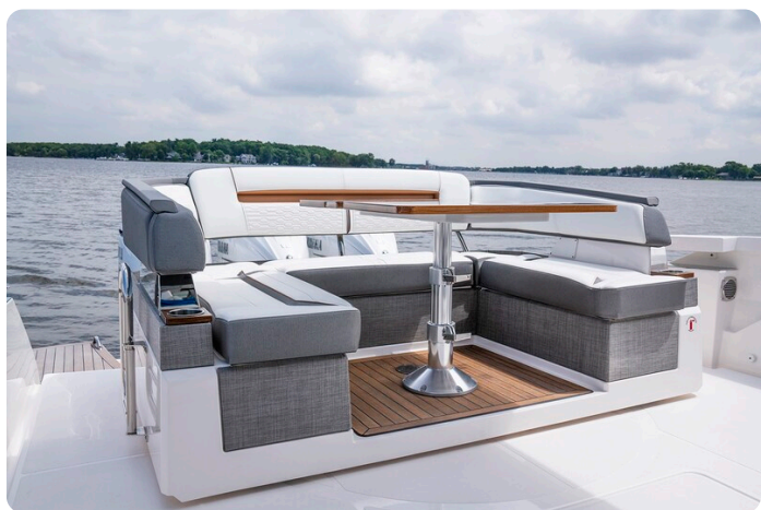
Tiara 43 LS aft dinette