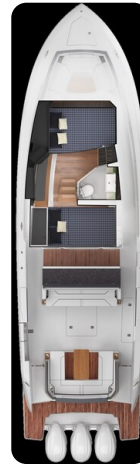
Tiara 43 LS interior layout