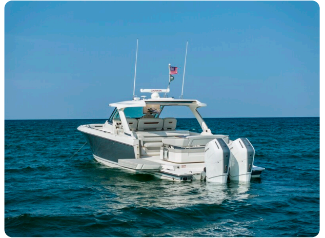
Tiara 43LS aft view