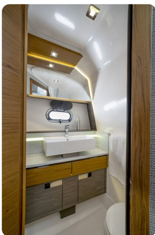
Tiara 43 LS bathroom