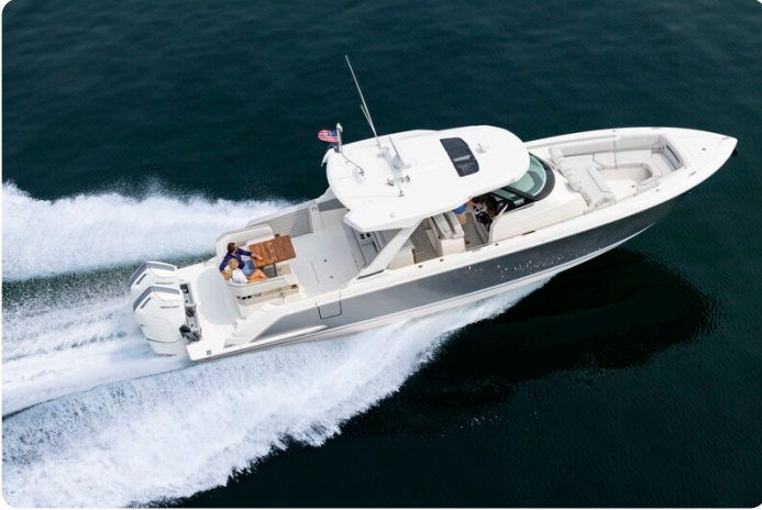
Tiara 43LS aerial view