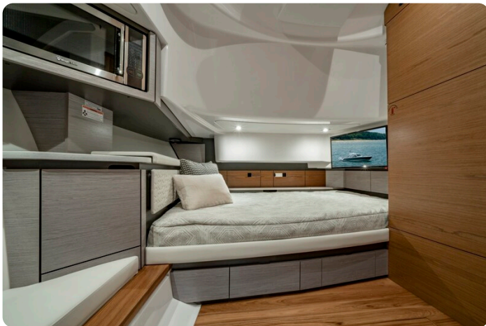
Tiara 43LS cabin