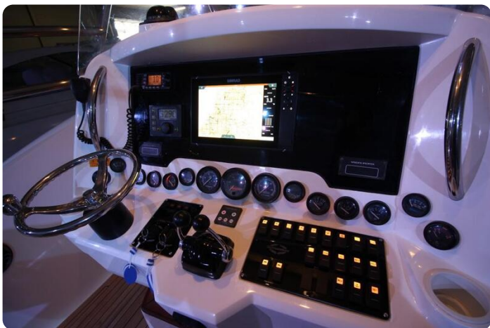
Sunseeker Sportfisher 37