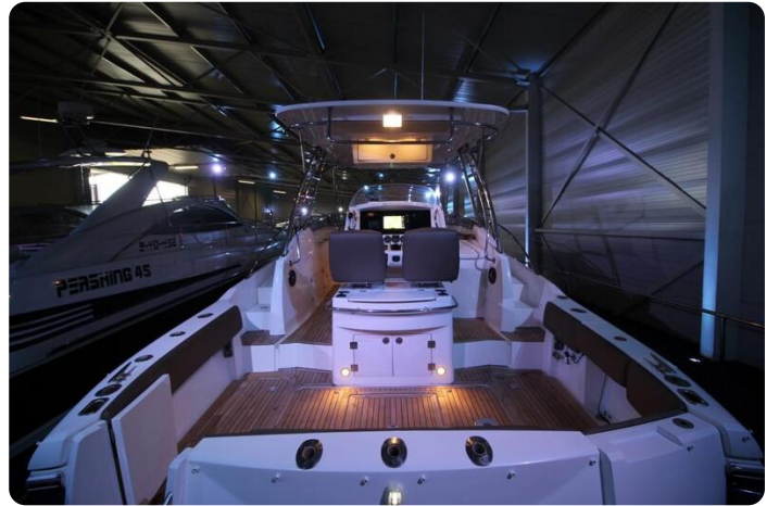
Sunseeker Sportfisher 37