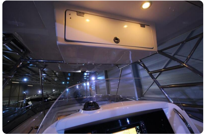
Sunseeker Sportfisher 37