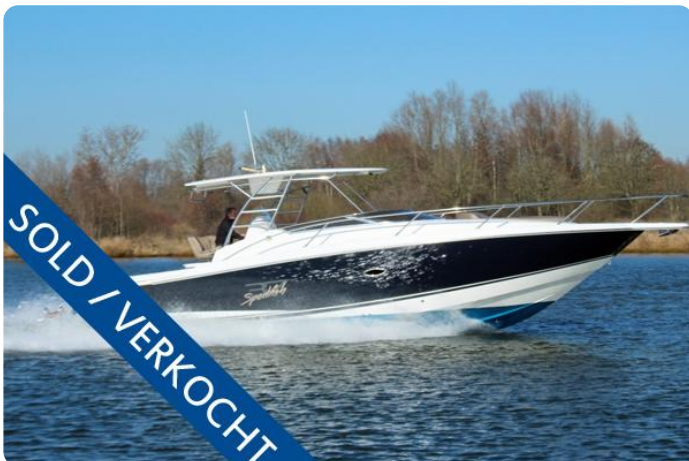
Sunseeker Sportfisher 37