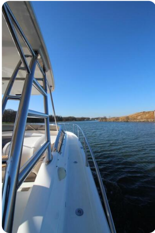
Sunseeker Sportfisher 37