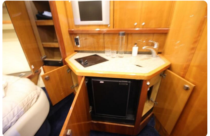
Sunseeker Sportfisher 37