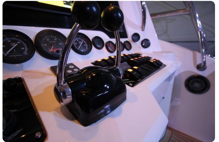
Sunseeker Sportfisher 37