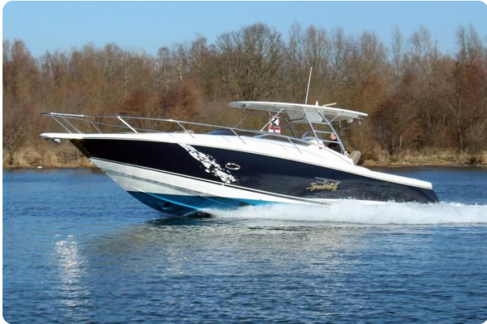
Sunseeker Sportfisher 37