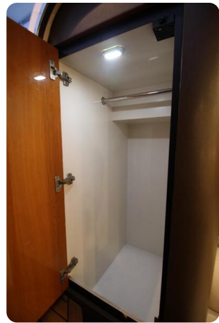
Sunseeker Sportfisher 37