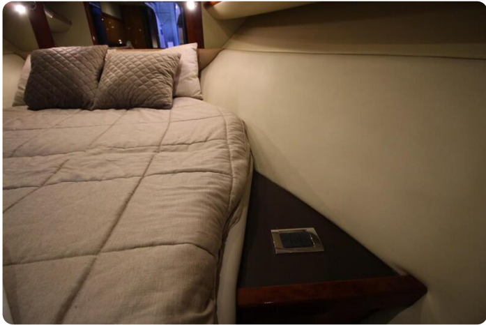
Sunseeker Sportfisher 37