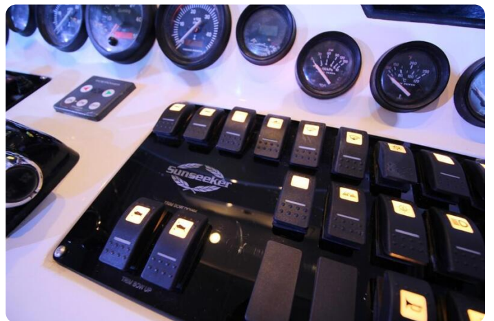
Sunseeker Sportfisher 37