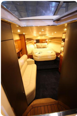
Sunseeker Sportfisher 37