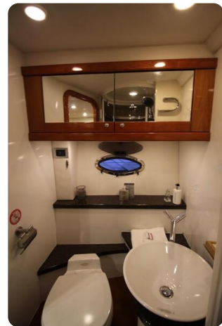
Sunseeker Sportfisher 37