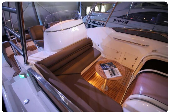
Sunseeker Sportfisher 37