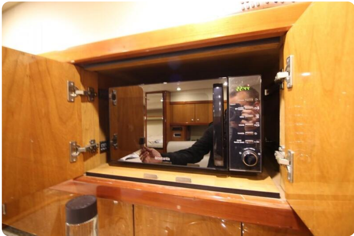
Sunseeker Sportfisher 37