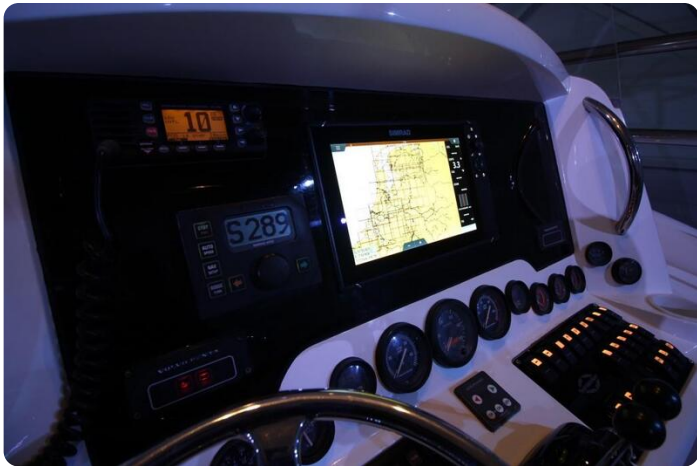
Sunseeker Sportfisher 37