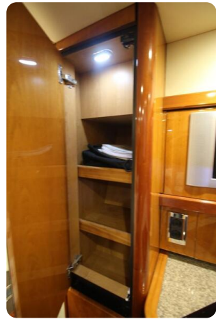
Sunseeker Sportfisher 37