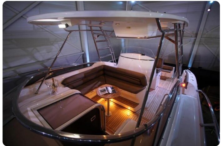
Sunseeker Sportfisher 37