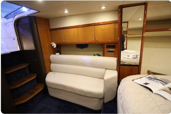
Sunseeker Sportfisher 37