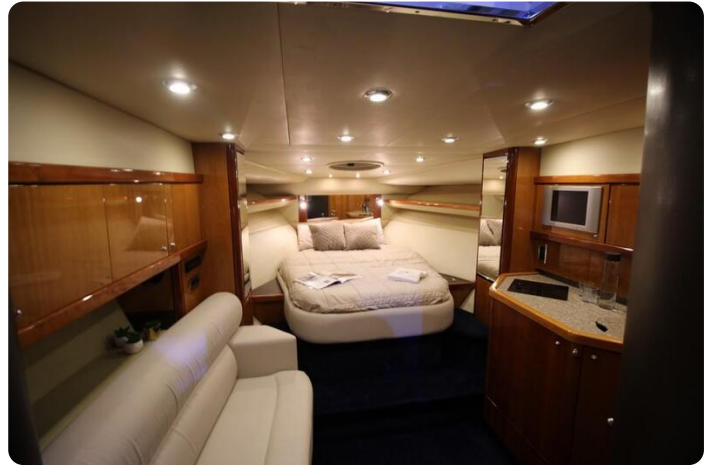
Sunseeker Sportfisher 37