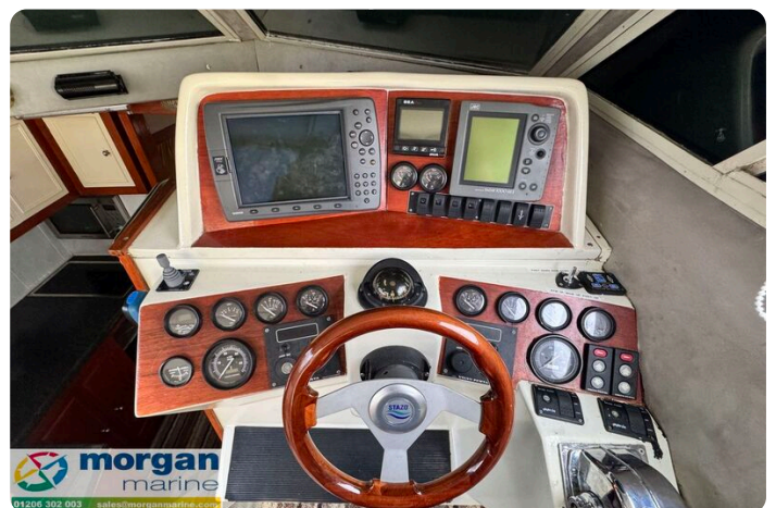
Relcraft Diamond Sedan 30 - wheel