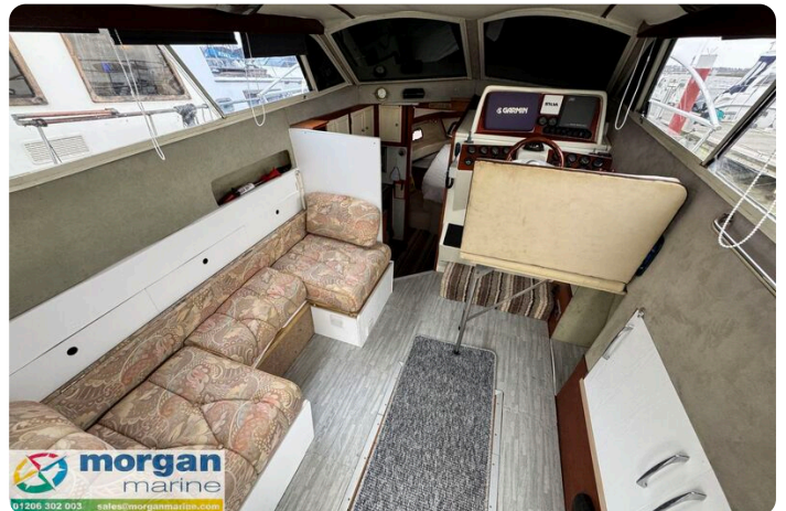
Relcraft Diamond Sedan 30 - saloon