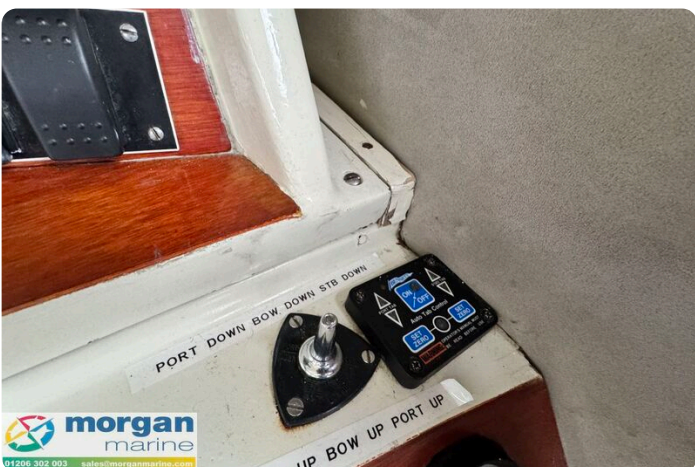
Relcraft Diamond Sedan 30 - trim tab controls