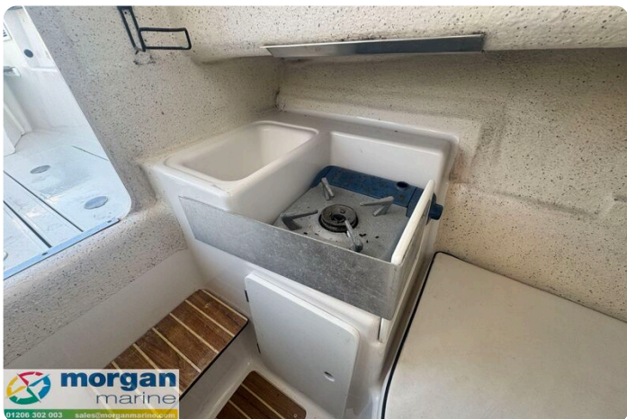
Quicksilver 640 - cooker