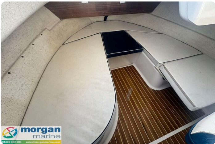
Quicksilver 640 - berth