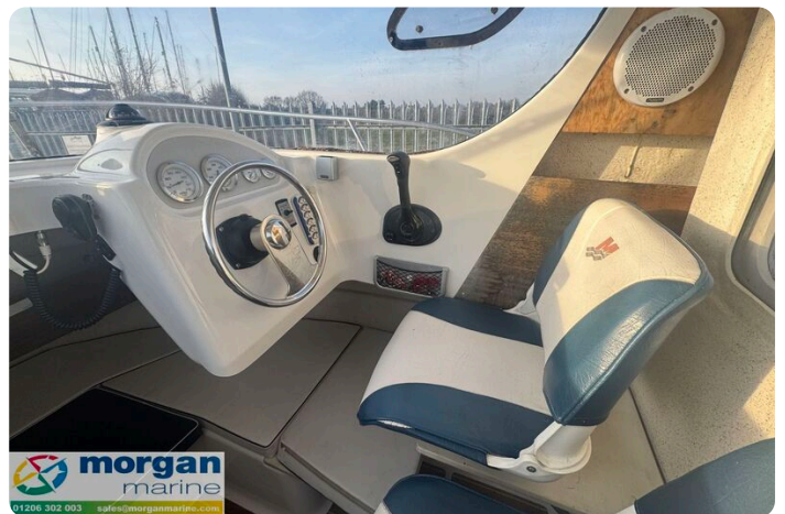
Quicksliver 640 - pilot seat