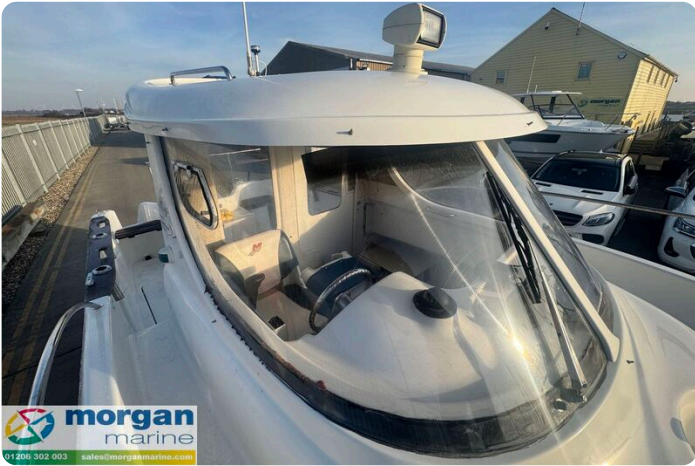
Quicksliver 640 - windscreen