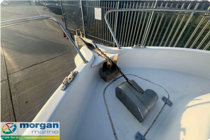
Quicksliver 640 - windlass