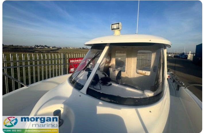
Quicksliver 640 - light