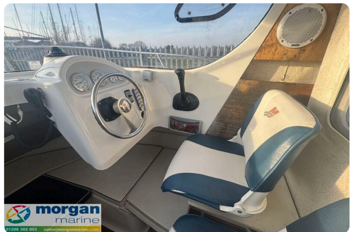
Quicksliver 640 - pilot seat