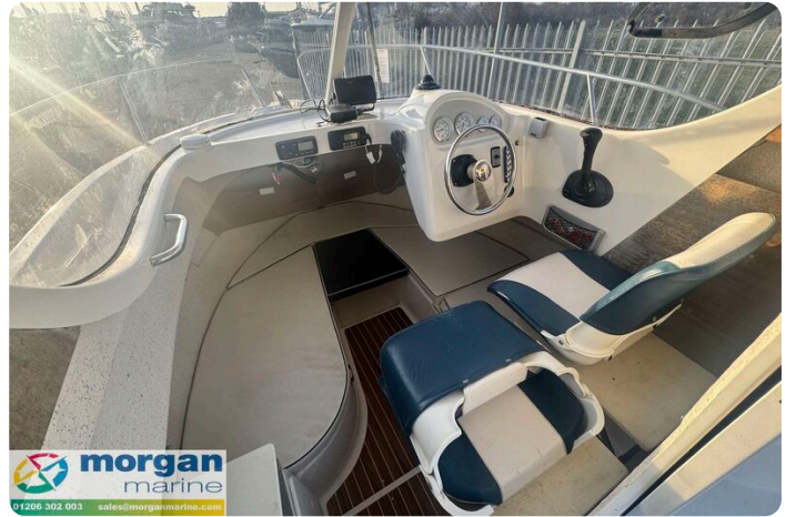
Quicksliver 640 - seating