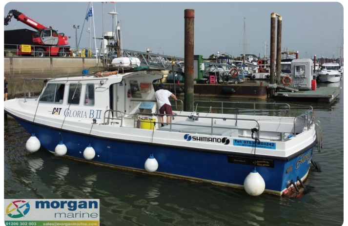
Procharter 36 GRP charter fishing boat - in the cockpit