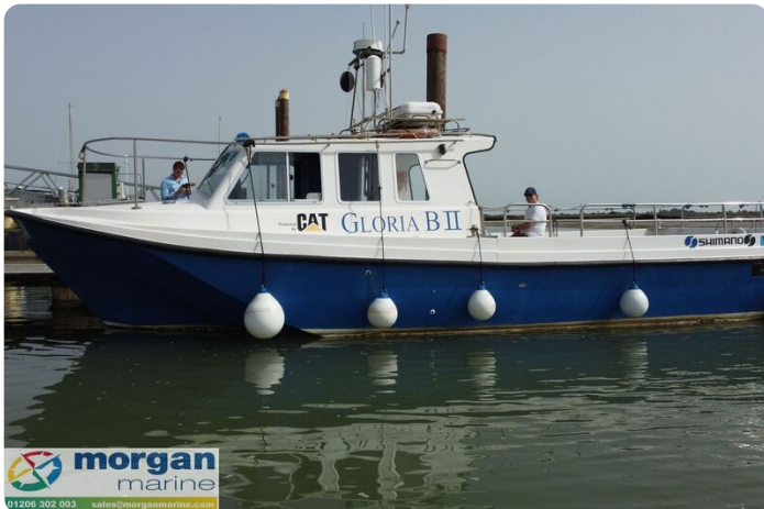
Procharter 36 GRP charter fishing boat - port side view of wheelhouse