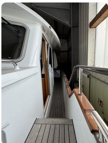
Pollard Stavast 1200 Trawler CHARLY 31