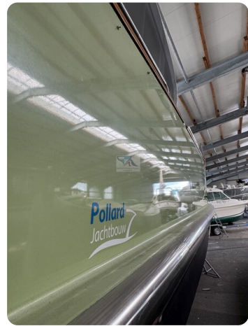
Pollard Stavast 1200 Trawler CHARLY 3