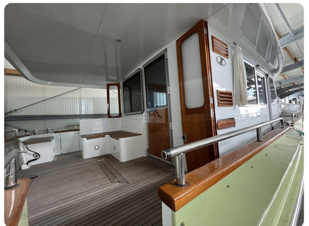
Pollard Stavast 1200 Trawler CHARLY 18