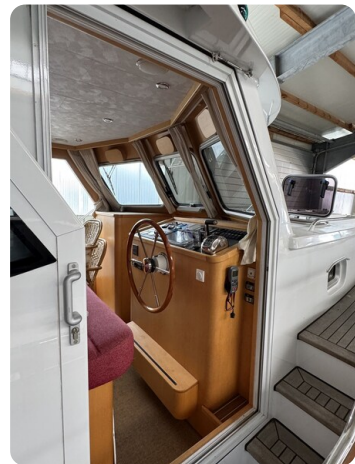
Pollard Stavast 1200 Trawler CHARLY 43