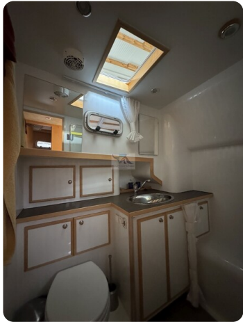
Pollard Stavast 1200 Trawler CHARLY 74