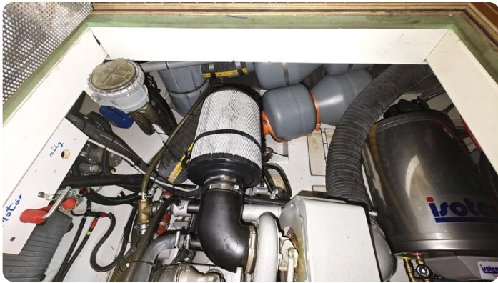
stavast 1200_ 4