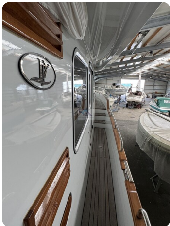
Pollard Stavast 1200 Trawler CHARLY 45