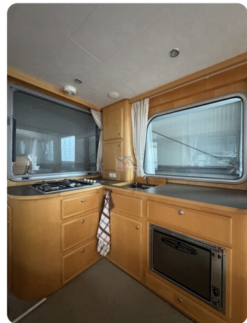
Pollard Stavast 1200 Trawler CHARLY 62