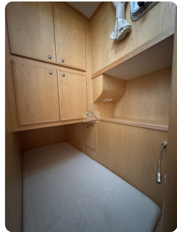
Pollard Stavast 1200 Trawler CHARLY 82