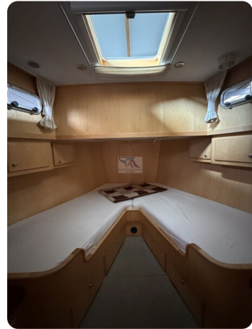
Pollard Stavast 1200 Trawler CHARLY 79