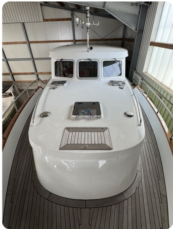
Pollard Stavast 1200 Trawler CHARLY 35