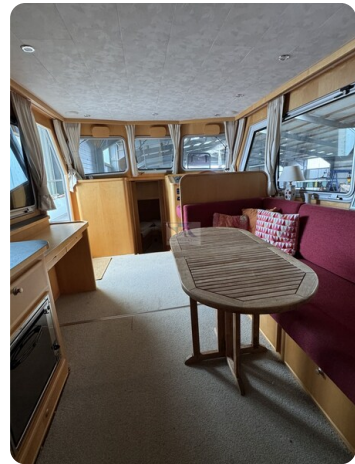
Pollard Stavast 1200 Trawler CHARLY 64