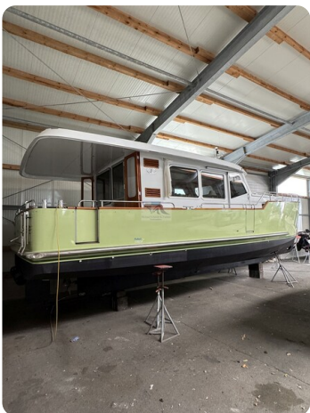
Pollard Stavast 1200 Trawler CHARLY 1