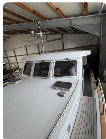
Pollard Stavast 1200 Trawler CHARLY 32