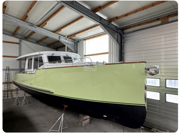
Pollard Stavast 1200 Trawler CHARLY 12