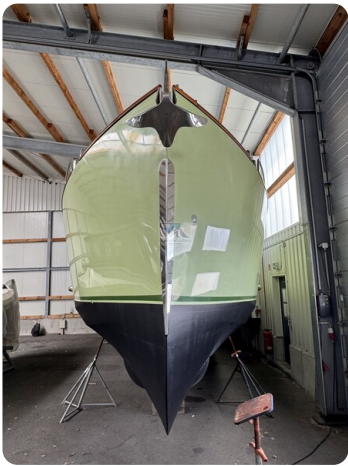
Pollard Stavast 1200 Trawler CHARLY 10