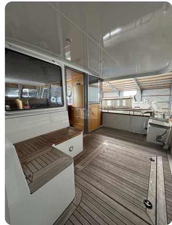
Pollard Stavast 1200 Trawler CHARLY 51