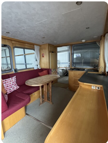
Pollard Stavast 1200 Trawler CHARLY 70