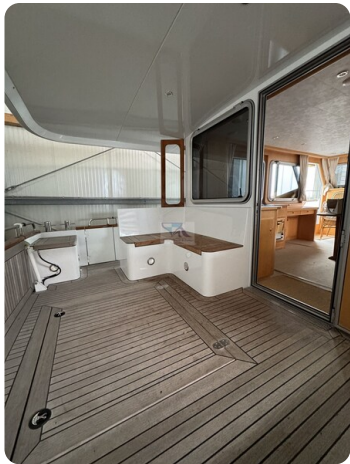
Pollard Stavast 1200 Trawler CHARLY 52