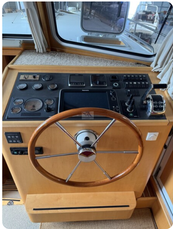
Pollard Stavast 1200 Trawler CHARLY 67