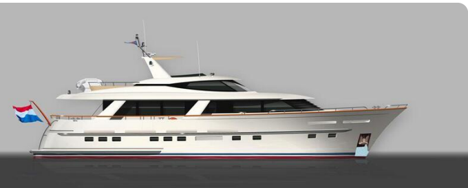
WERNER YACHT DESIGN PACIFIC ALPHA 72 © 2024 Pacific Alpha 72