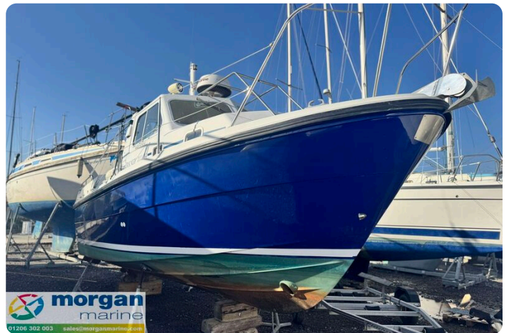
Orkney Day Angler 24 - Main