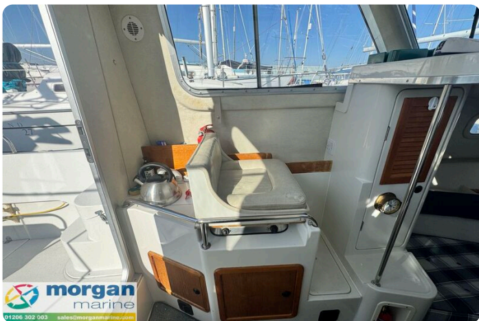
Orkney Day Angler 24 - co pilot seat