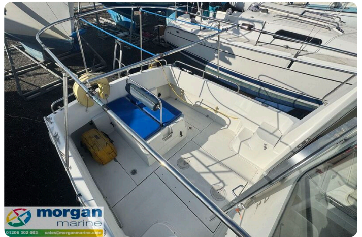
Orkney Day Angler 24 - seating cockpit