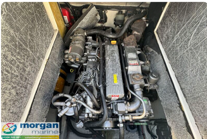
Orkney Day Angler 24 - engine