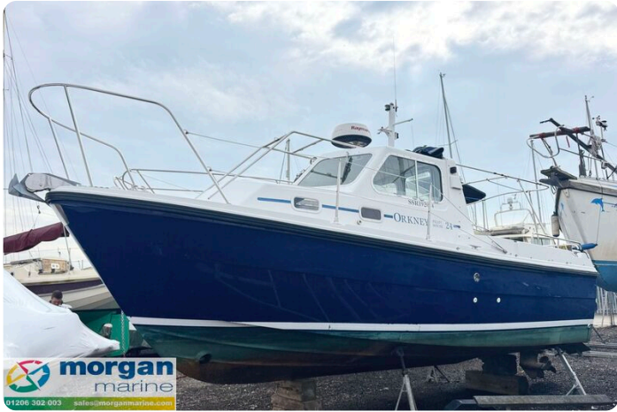
Orkney Day Angler 24 - Main