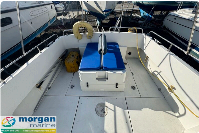
Orkney Day Angler 24 - deck