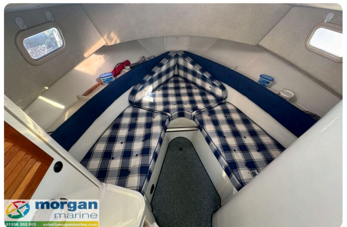
Orkney Day Angler 24 - cabin