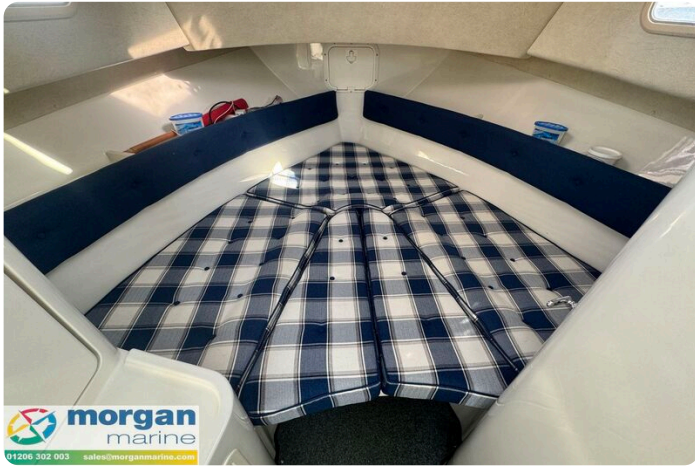
Orkney Day Angler 24 - in fill cushion