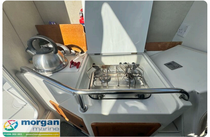
Orkney Day Angler 24 - gas stove