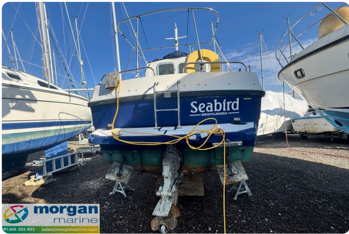
Orkney Day Angler 24 - prop