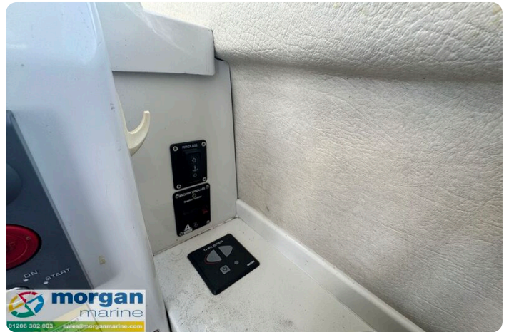
Orkney Day Angler 24 - bow thruster controls