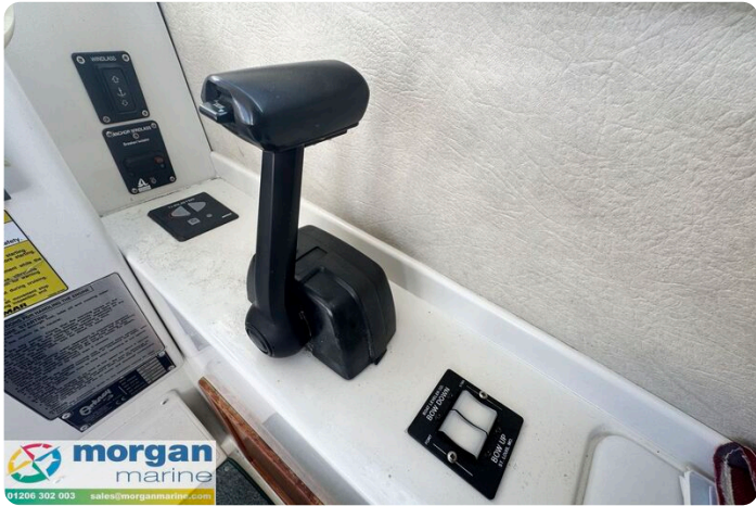
Orkney Day Angler 24 - throttle