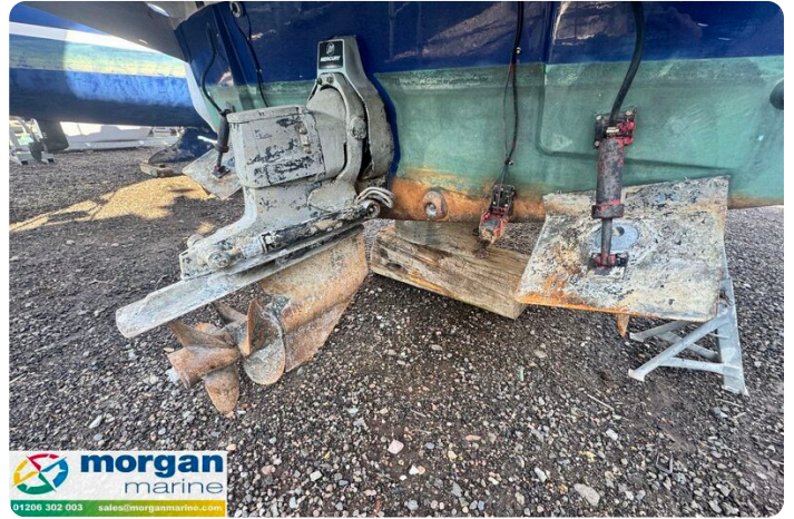
Orkney Day Angler 24 - engine prop