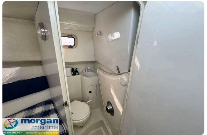
Orkney Day Angler 24 - toilet