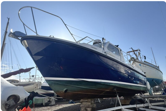
Orkney Day Angler 24 - bow