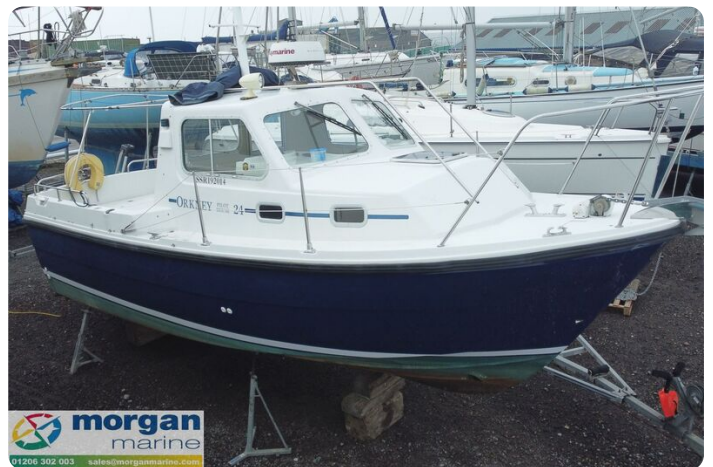
Orkney Day Angler 24 - railings