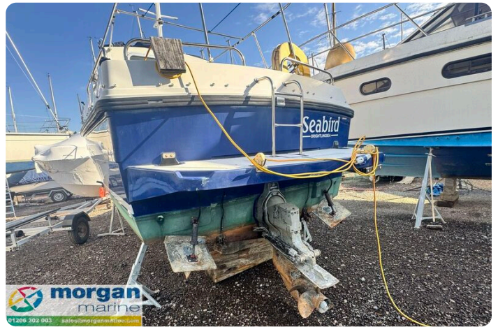
Orkney Day Angler 24 - ladder