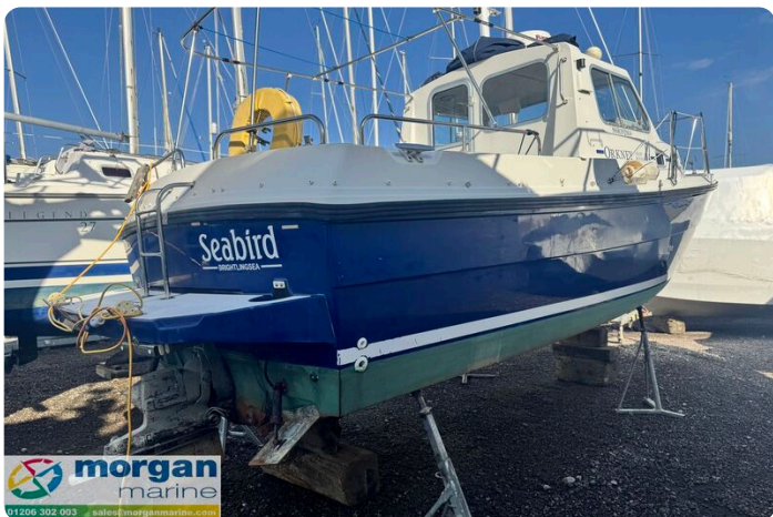
Orkney Day Angler 24 - trim tabs