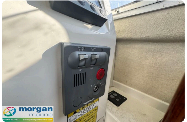
Orkney Day Angler 24 - controls