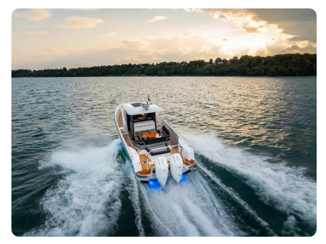
Nimbus Tender 11 (T11) Exterior 10