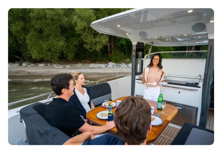
Nimbus Tender 11 (T11) Deck 7