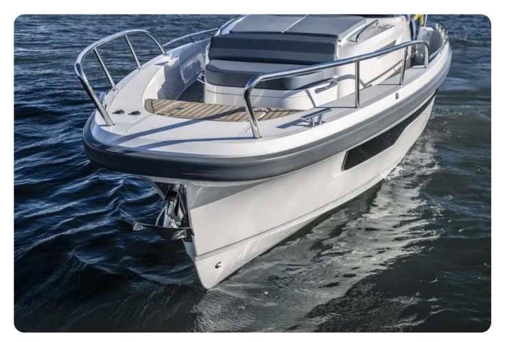
Nimbus Tender 11 (T11) Exterior 4