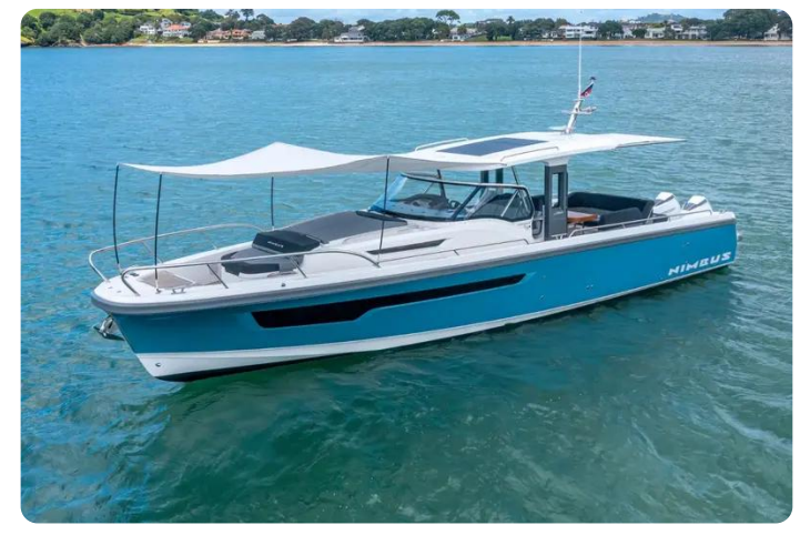
Nimbus Tender 11 Featured