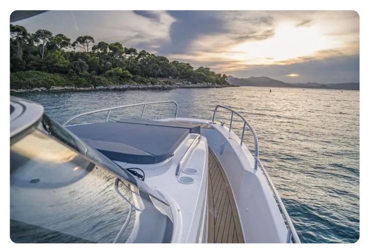
Nimbus Tender 11 (T11) Deck 2