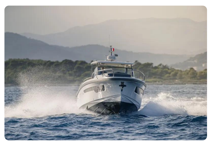
Nimbus Tender 11 (T11) Exterior 2