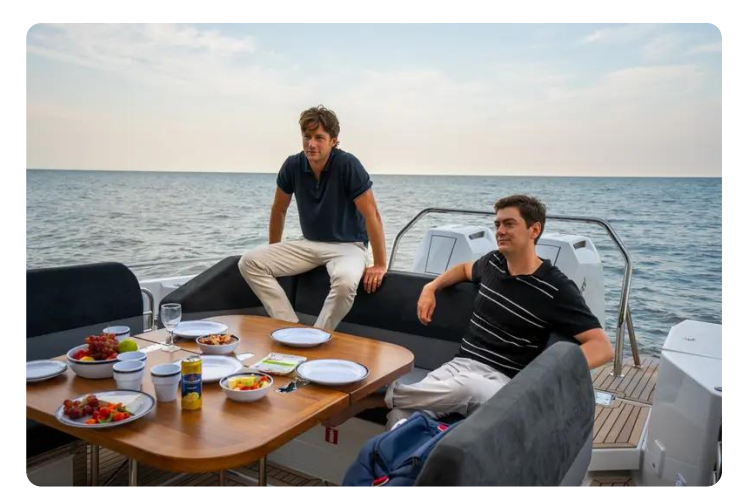
Nimbus Tender 11 (T11) Deck 9