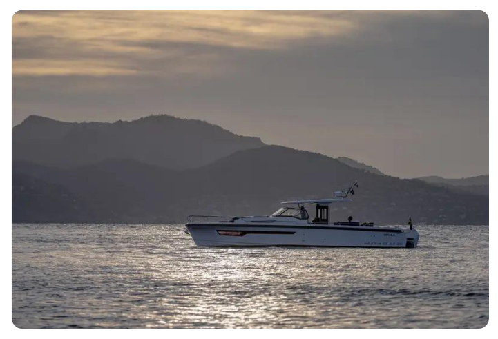
Nimbus Tender 11 (T11) Exterior