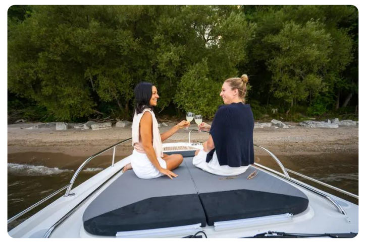
Nimbus Tender 11 (T11) Deck 8