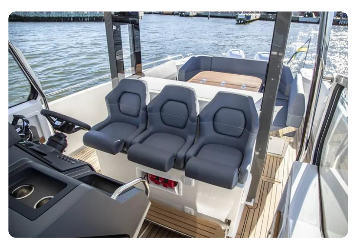
Nimbus Tender 11 (T11) Deck 1