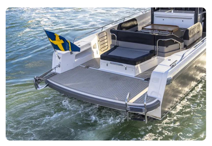
Nimbus Tender 11 (T11) Exterior 14