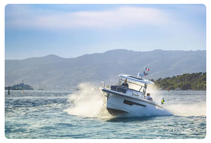
Nimbus Tender 11 (T11) Exterior 3