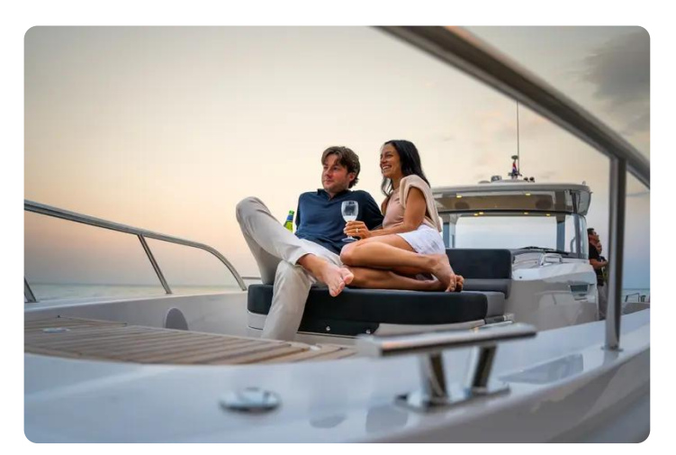
Nimbus Tender 11 (T11) Deck 6