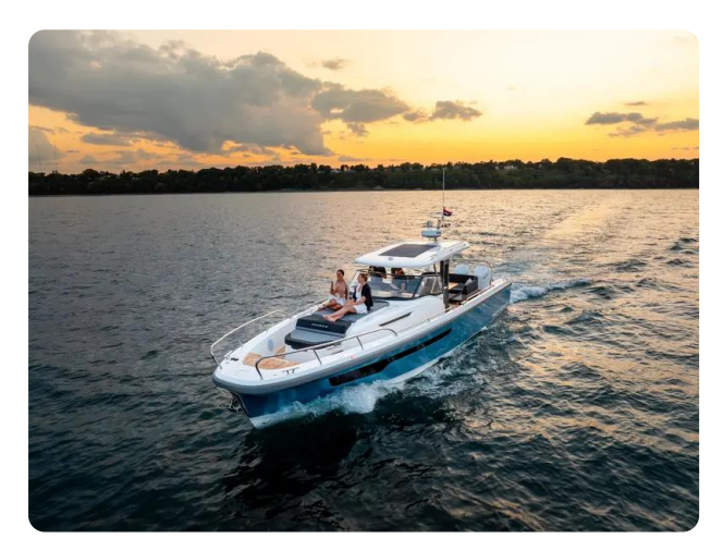
Nimbus Tender 11 (T11) Exterior 1