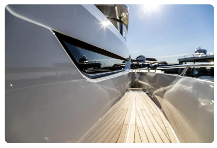
Nimbus Tender 11 (T11) Deck 3