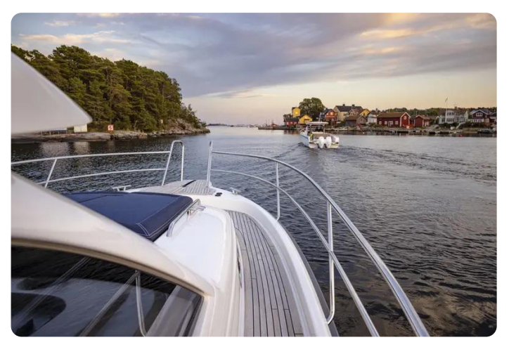
Nimbus Tender 11 (T11) Deck 10