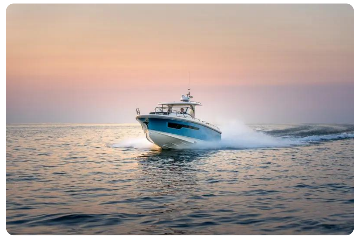
Nimbus Tender 11 (T11) Exterior 11