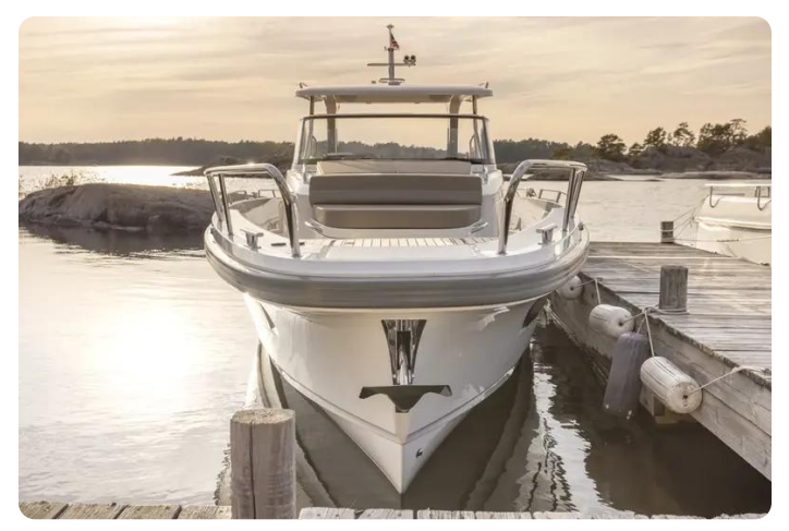
Nimbus Tender 11 (T11) Exterior 5