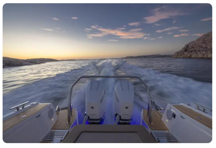
Nimbus Tender 11 (T11) Outboard