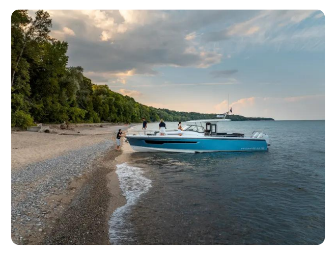
Nimbus Tender 11 (T11) Exterior 8