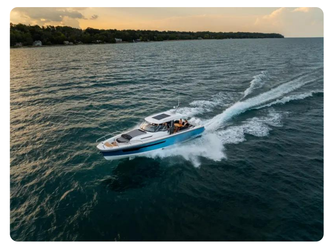
Nimbus Tender 11 (T11) Exterior 9