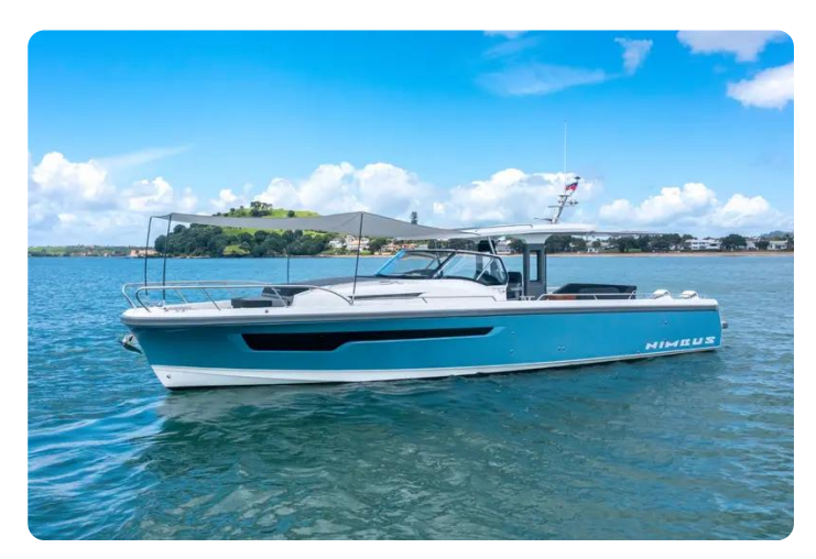
Nimbus Tender 11 (T11) Exterior 7