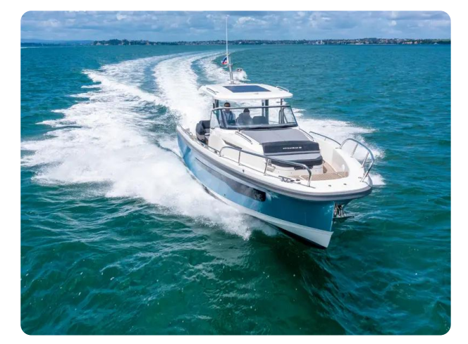
Nimbus Tender 11 (T11) Exterior 6