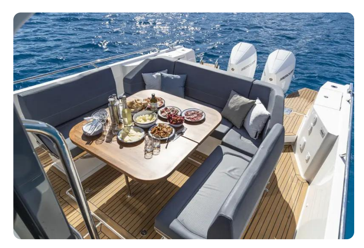
Nimbus Tender 11 (T11) Deck 5