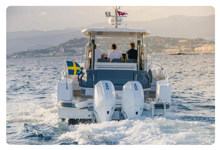
Nimbus Tender 11 (T11) Exterior 13