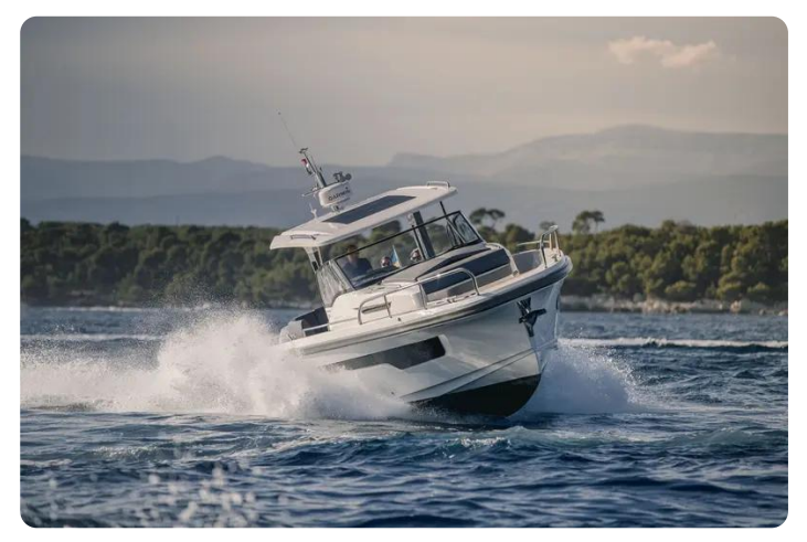
Nimbus Tender 11 (T11) Exterior 12