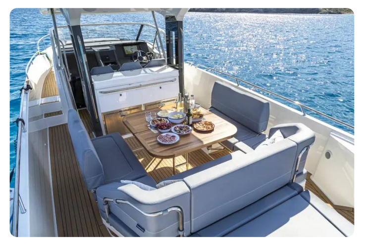
Nimbus Tender 11 (T11) Deck 4