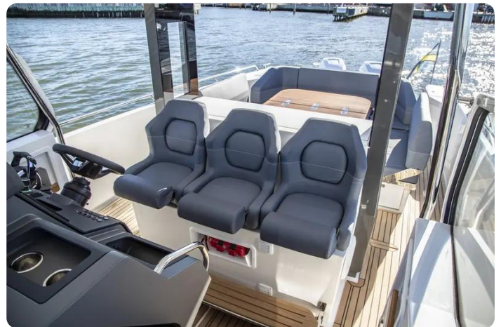
Nimbus Tender 11 (T11) Deck 1