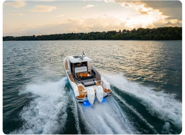
Nimbus Tender 11 (T11) Exterior 10