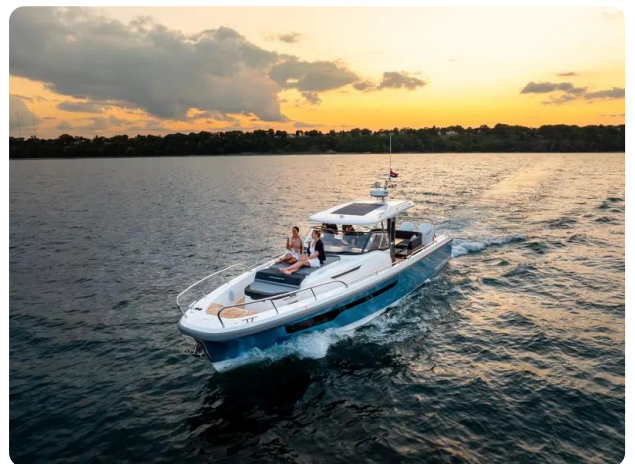
Nimbus Tender 11 (T11) Exterior 1