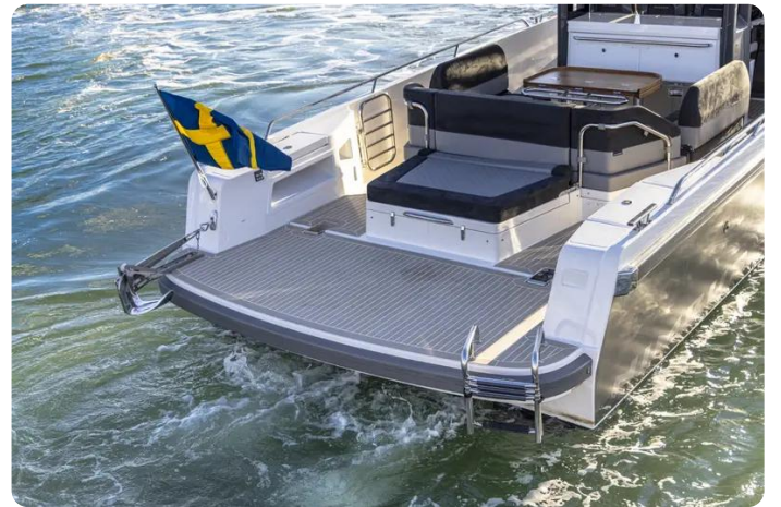
Nimbus Tender 11 (T11) Exterior 14