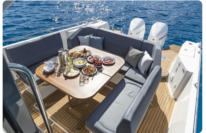
Nimbus Tender 11 (T11) Deck 5