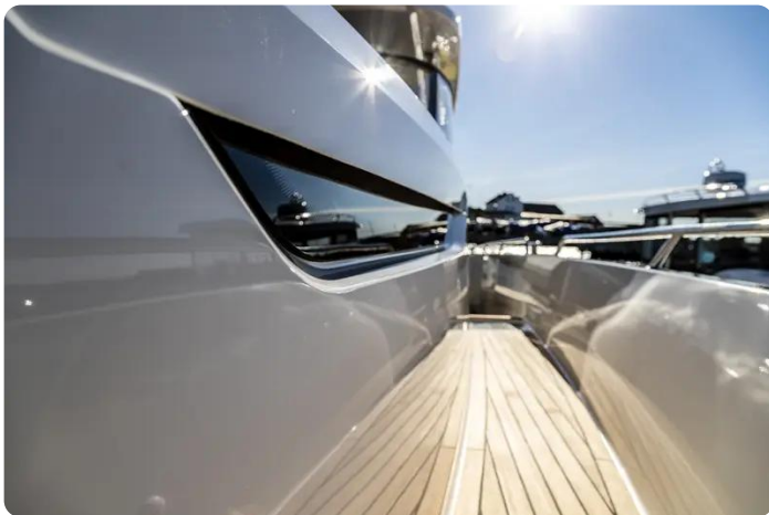
Nimbus Tender 11 (T11) Deck 3