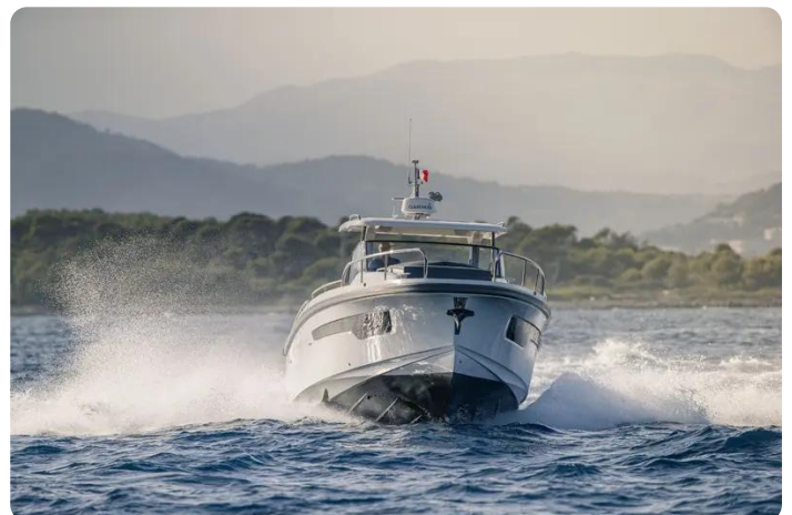
Nimbus Tender 11 (T11) Exterior 2