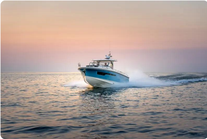
Nimbus Tender 11 (T11) Exterior 11