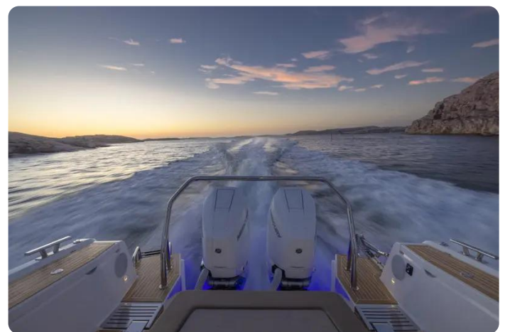
Nimbus Tender 11 (T11) Outboard