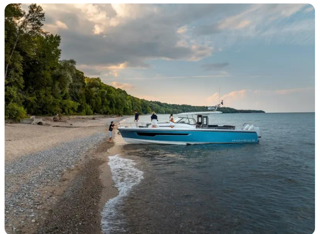
Nimbus Tender 11 (T11) Exterior 8