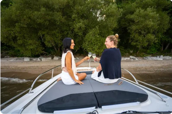
Nimbus Tender 11 (T11) Deck 8