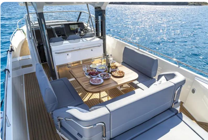
Nimbus Tender 11 (T11) Deck 4