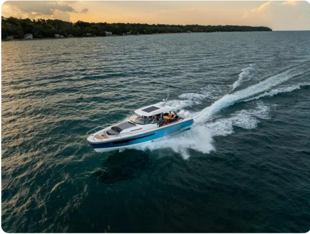
Nimbus Tender 11 (T11) Exterior 9