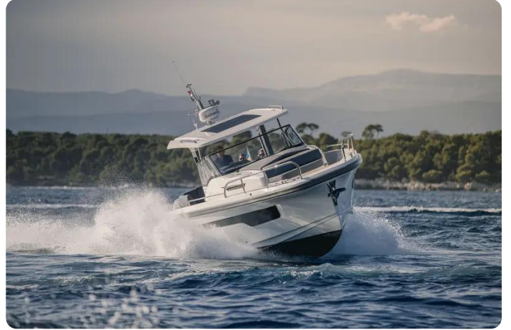
Nimbus Tender 11 (T11) Exterior 12