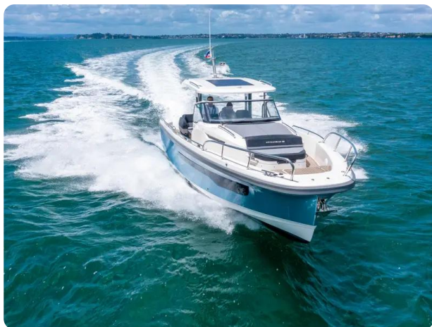
Nimbus Tender 11 (T11) Exterior 6