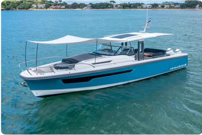
Nimbus Tender 11 Featured