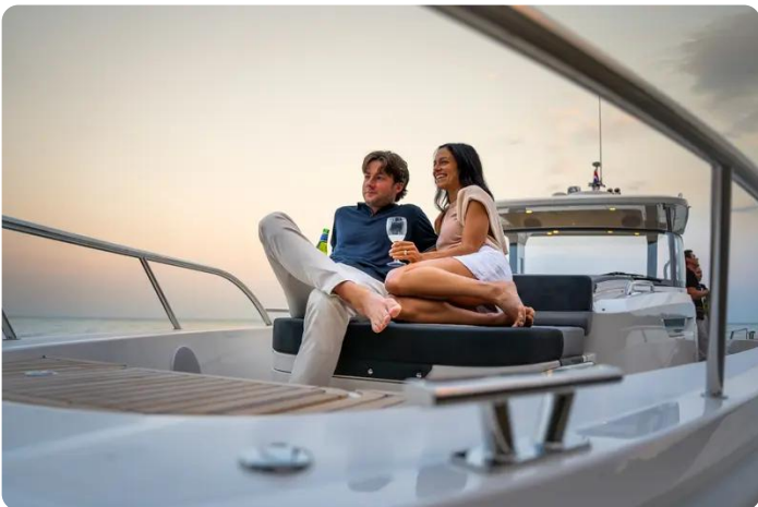
Nimbus Tender 11 (T11) Deck 6