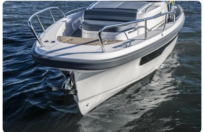
Nimbus Tender 11 (T11) Exterior 4