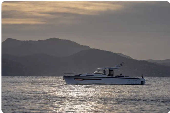
Nimbus Tender 11 (T11) Exterior