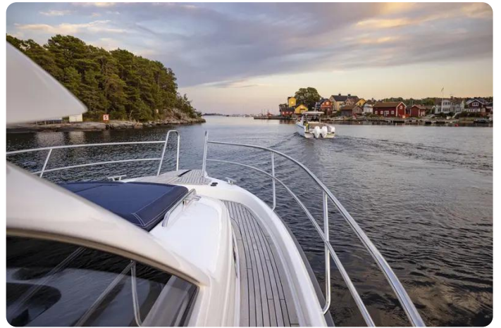
Nimbus Tender 11 (T11) Deck 10