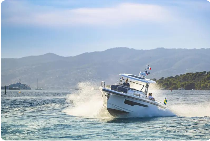
Nimbus Tender 11 (T11) Exterior 3