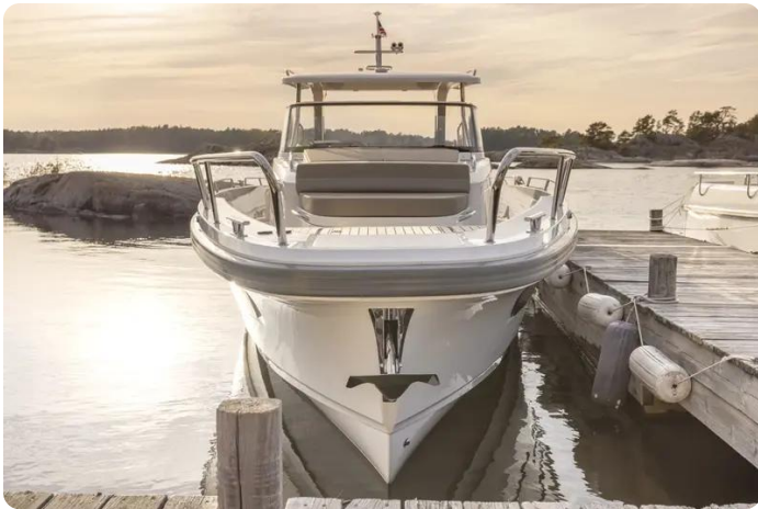
Nimbus Tender 11 (T11) Exterior 5