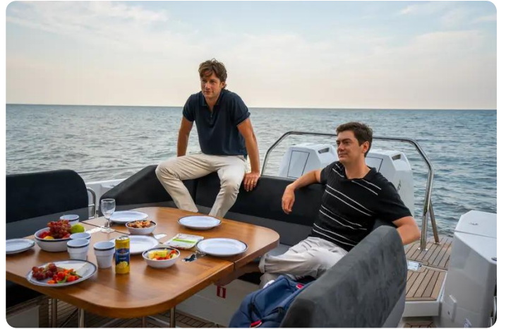
Nimbus Tender 11 (T11) Deck 9