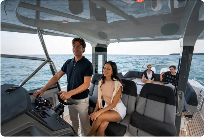
Nimbus Tender 11 (T11) Cabin 1