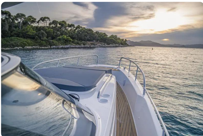
Nimbus Tender 11 (T11) Deck 2