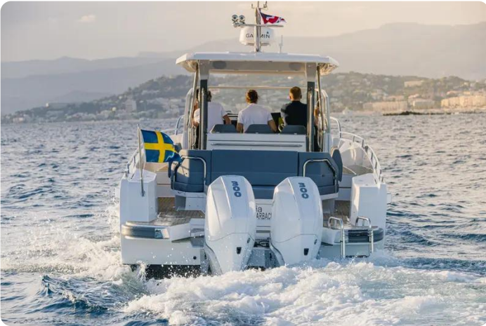
Nimbus Tender 11 (T11) Exterior 13