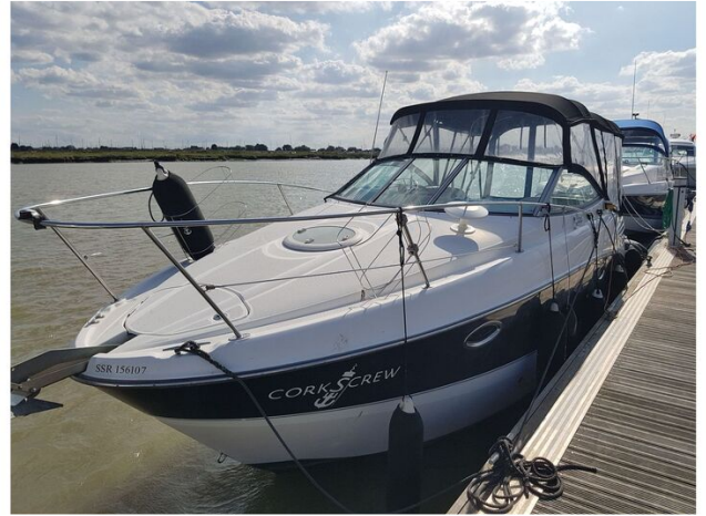
Maxum 2600 SE - port side and bow on pontoon