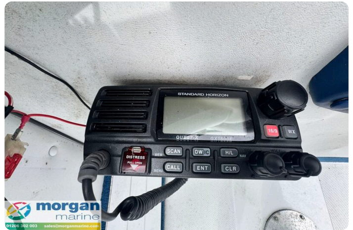
Mariah Shabah 218 - VHF radio