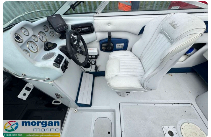
Mariah Shabah 218 - pilot seat