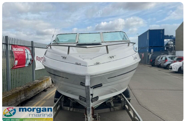
Mariah Shabah 218 - bow view