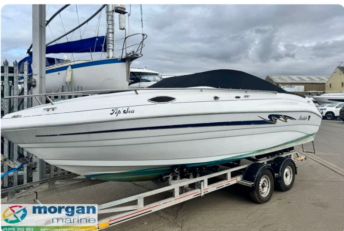
Mariah Shabah 218 - cover