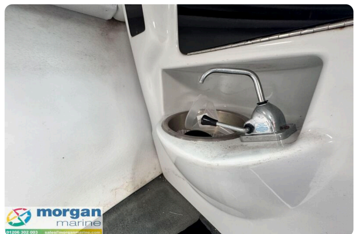
Mariah Shabah 218 - sink