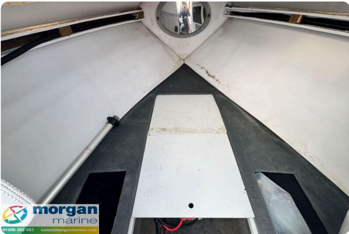
Mariah Shabah 218 - cabin