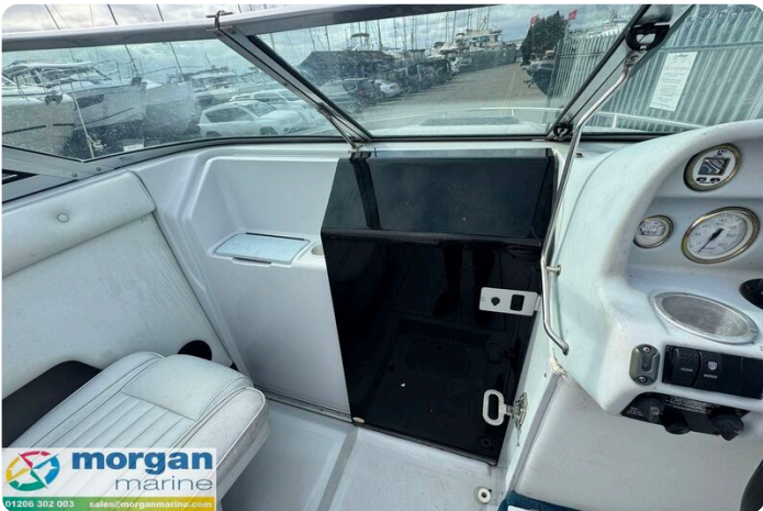
Mariah Shabah 218 - door