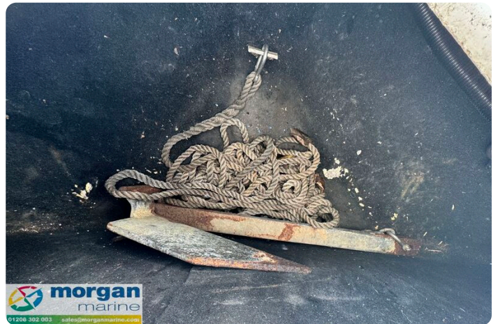
Mariah Shabah 218 - anchor