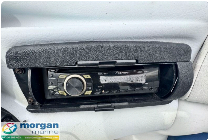
Mariah Shabah 218 - Radio