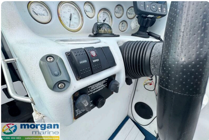
Mariah Shabah 218 - controls