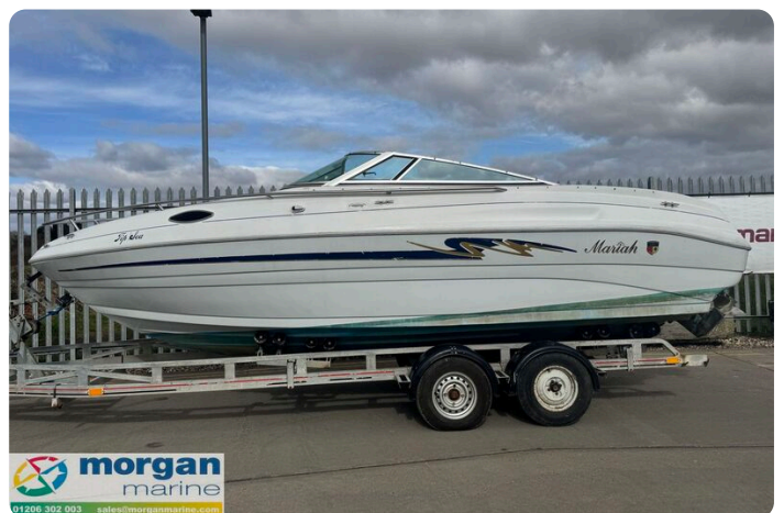
Mariah Shabah 218 - side view