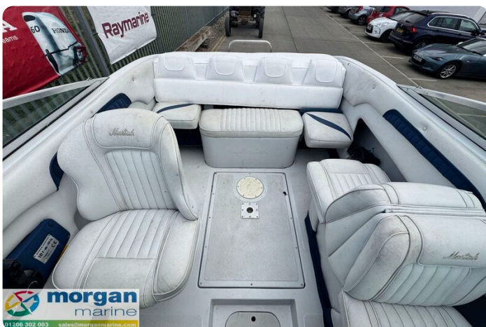
Mariah Shabah 218 - cockpit