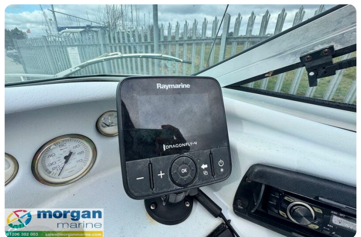
Mariah Shabah 218 - Raymarine