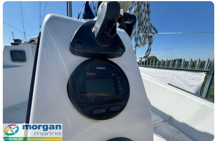
Macgregor 26M - gauge