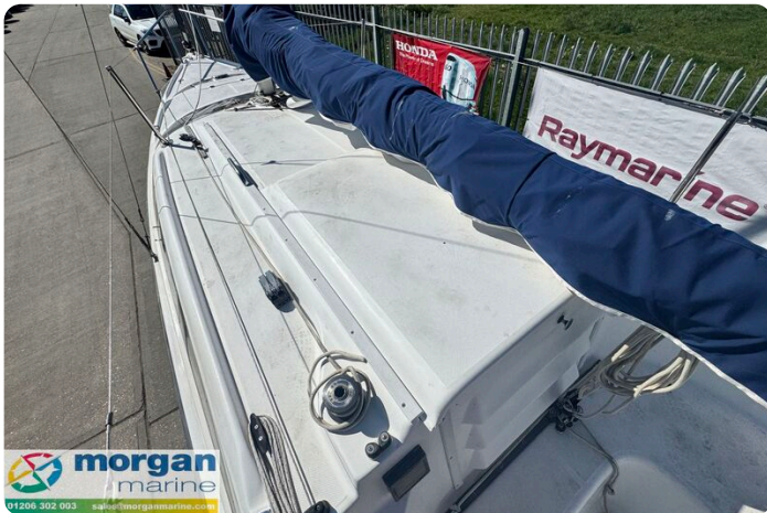
Macgregor 26M - deck