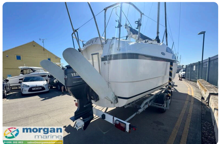
Macgregor 26M - rudder steering