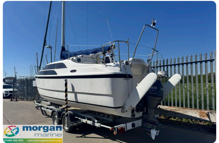
Macgregor 26M - rudder