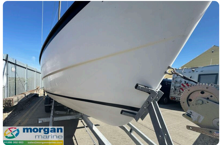
Macgregor 26M - hull bottom