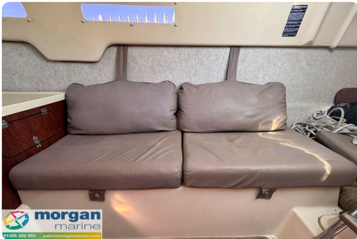
Macgregor 26M - saloon seating