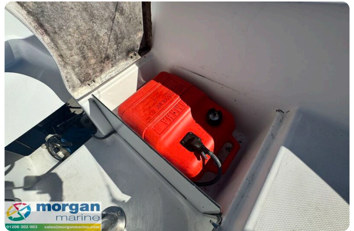
Macgregor 26M - fuel tank