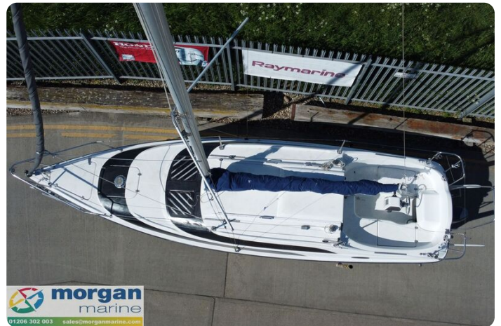
Macgregor 26M - mast