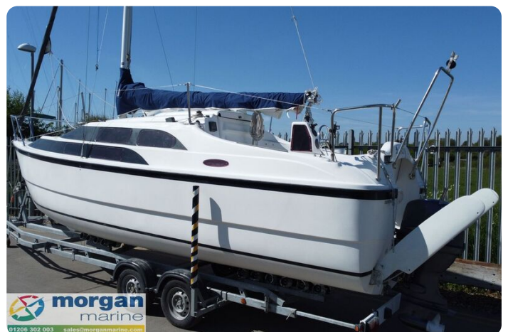
Macgregor 26M - back