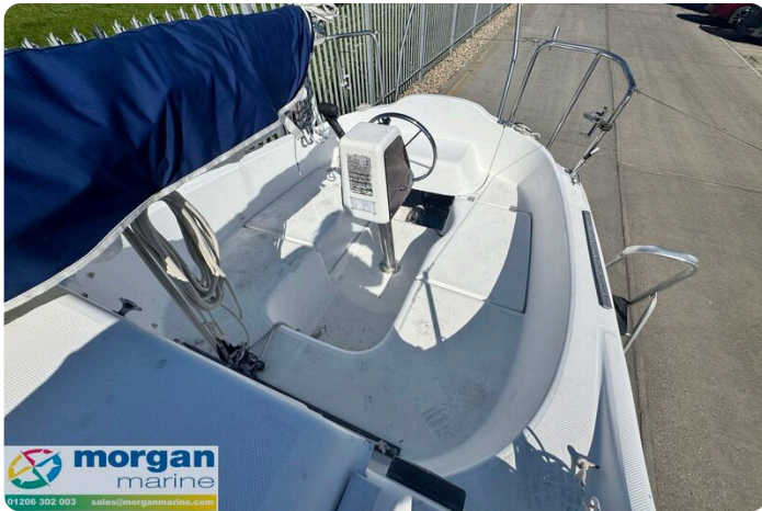
Macgregor 26M - cockpit