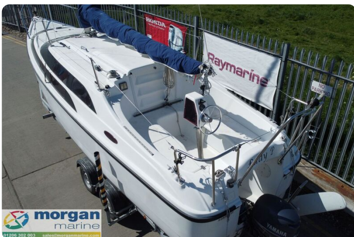
Macgregor 26M - cockpit