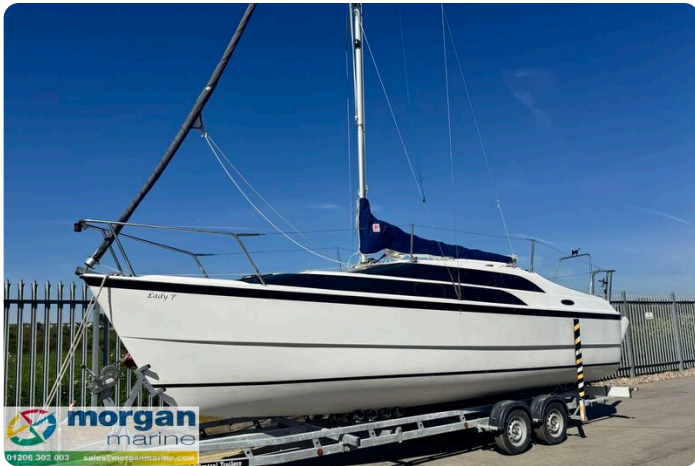
Macgregor 26M - side