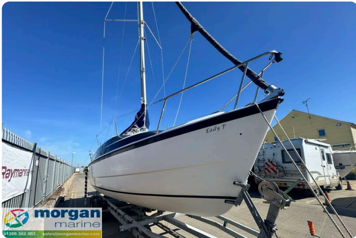
Macgregor 26M - hull