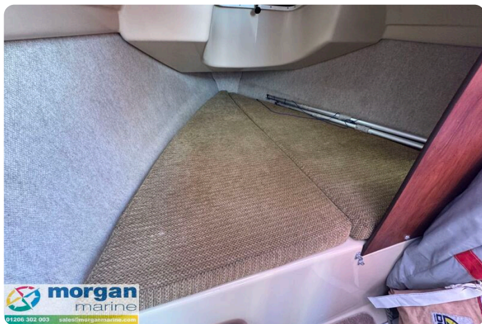
Macgregor 26M - forward berth