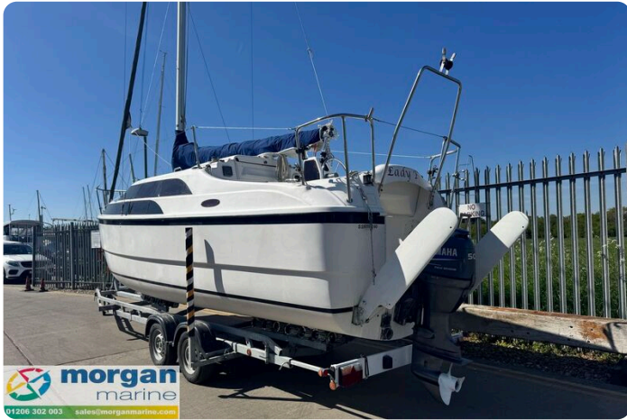
Macgregor 26M - railings