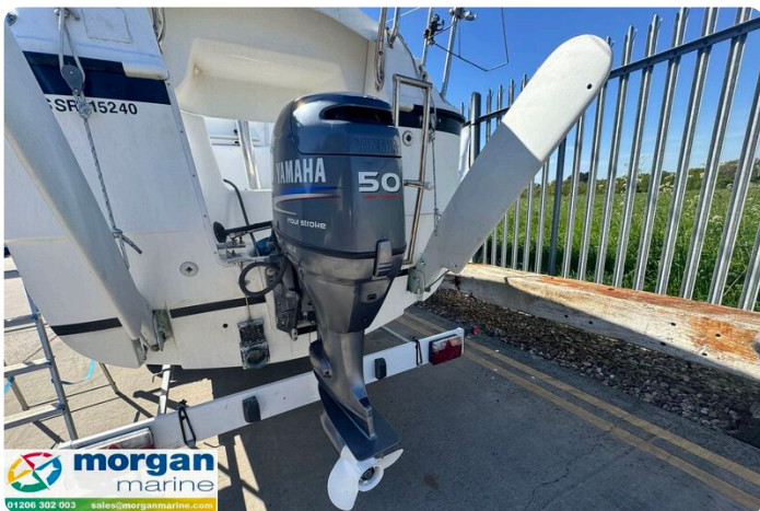
Macgregor 26M - engine Yamaha