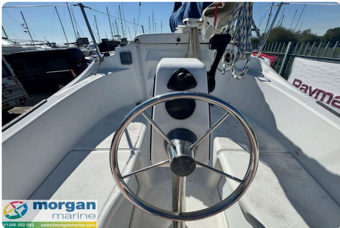
Macgregor 26M - steering wheel