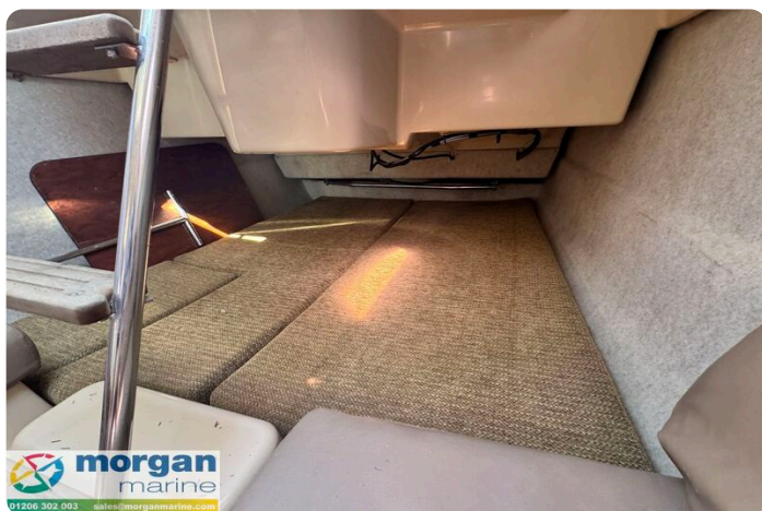
Macgregor 26M - stern