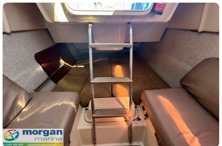
Macgregor 26M - ladder