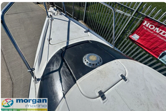
Macgregor 26M - anchor locker