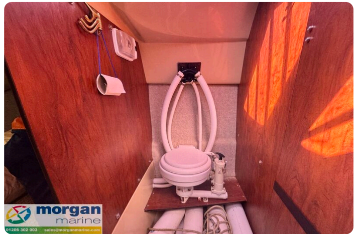
Macgregor 26M - toilet