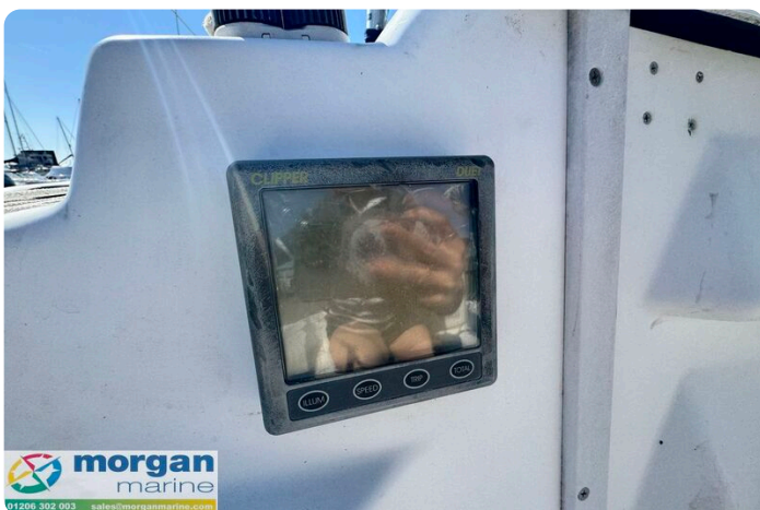
Macgregor 26M - clipper