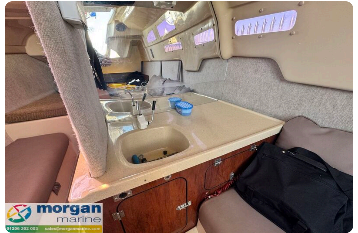
Macgregor 26M - sink