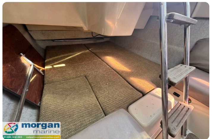
Macgregor 26M - back berth