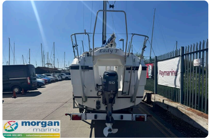
Macgregor 26M - engine