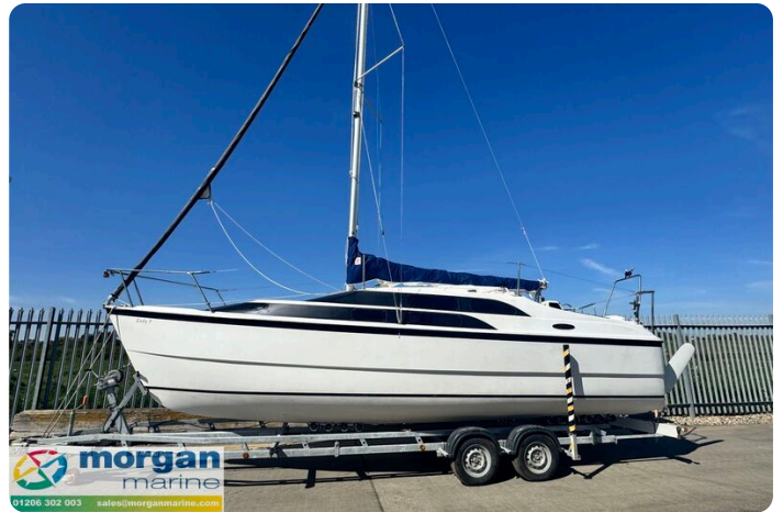
Macgregor 26M - side view