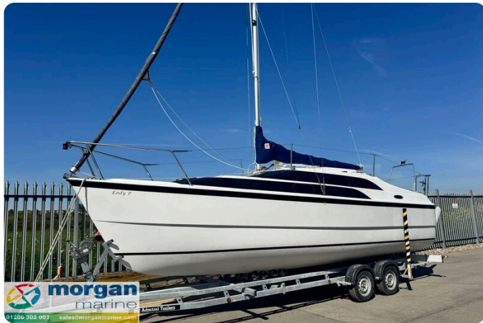
Macgregor 26M - Main