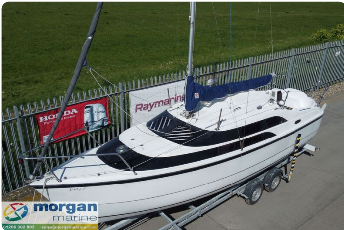
Macgregor 26M - top view