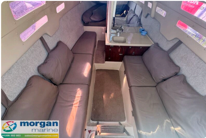
Macgregor 26M - saloon