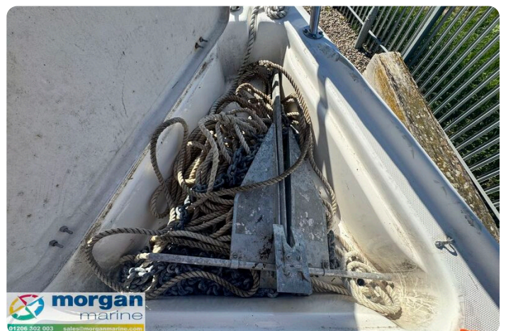
Macgregor 26M - anchor