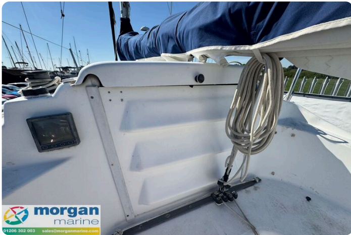
Macgregor 26M - hatch to saloon