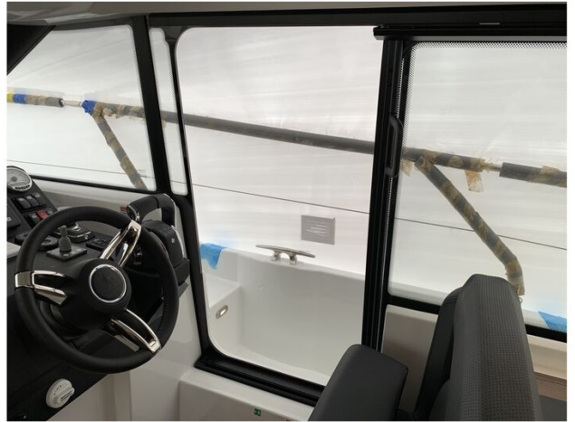
Jeanneau NC 37 twin diesel cruiser - helm side door