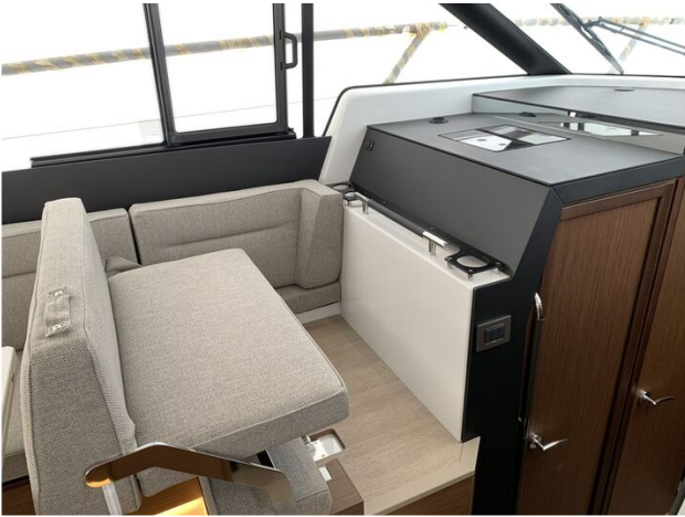
Jeanneau NC 37 twin diesel cruiser - copilot bench