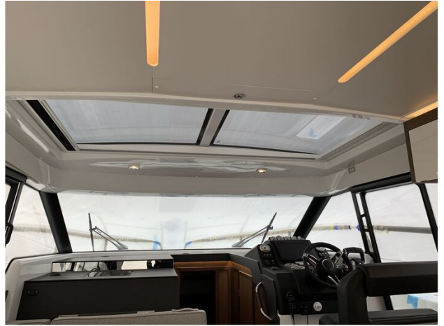
Jeanneau NC 37 twin diesel cruiser - electric sliding roof