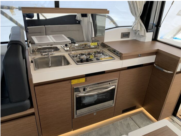
Jeanneau NC 37 twin diesel cruiser - galley with stove, oven and sink