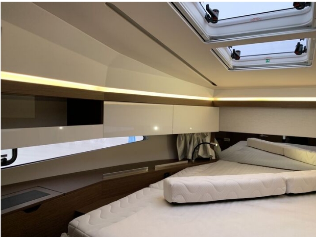
Jeanneau NC 37 twin diesel cruiser - main cabin with 2x hatch to deck