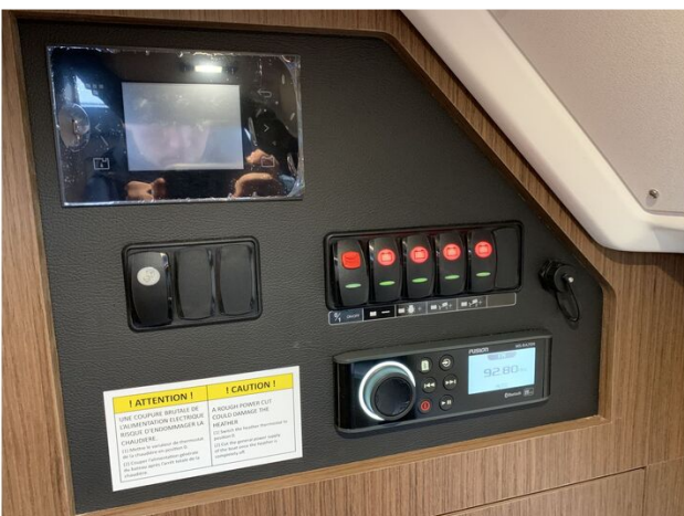
Jeanneau NC 37 twin diesel cruiser - audio controls and switch panel