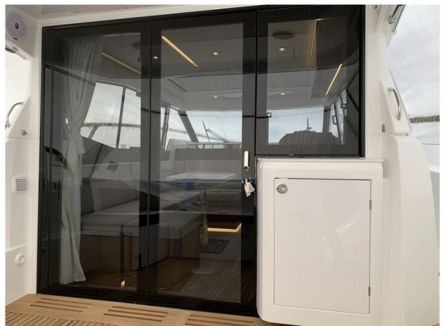
Jeanneau NC 37 twin diesel cruiser - wheelhouse doors