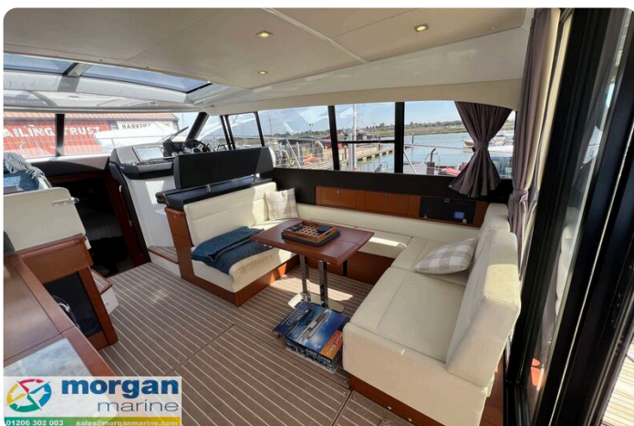
Jeanneau NC 14 - u - shaped