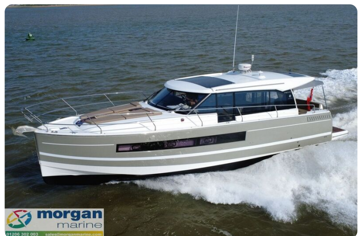
Jeanneau NC 14 - bow view