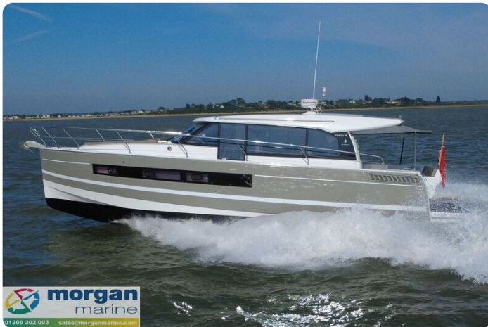
Jeanneau NC 14 - side view