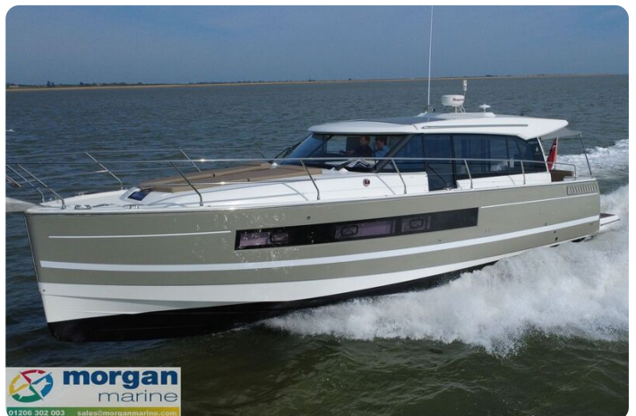
Jeanneau NC 14 - speed