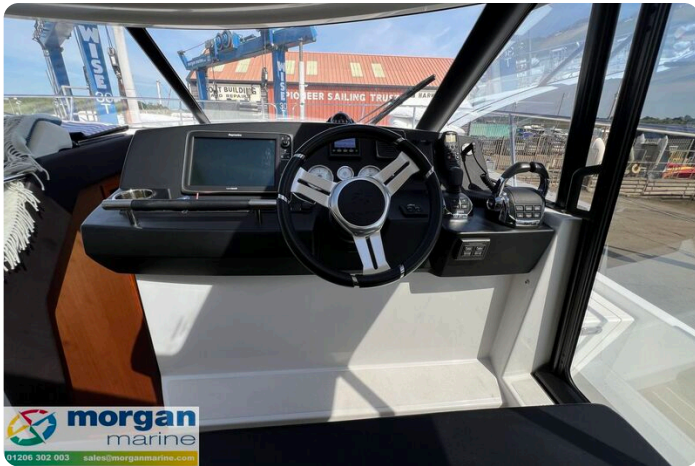
Jeanneau NC 14 - wheel