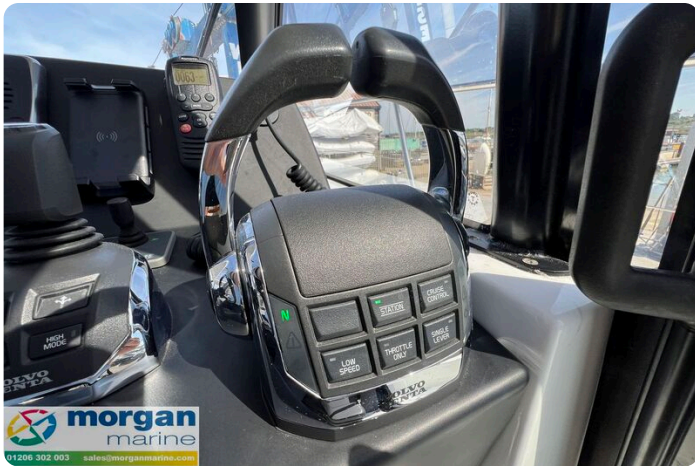
Jeanneau NC 14 - throttle