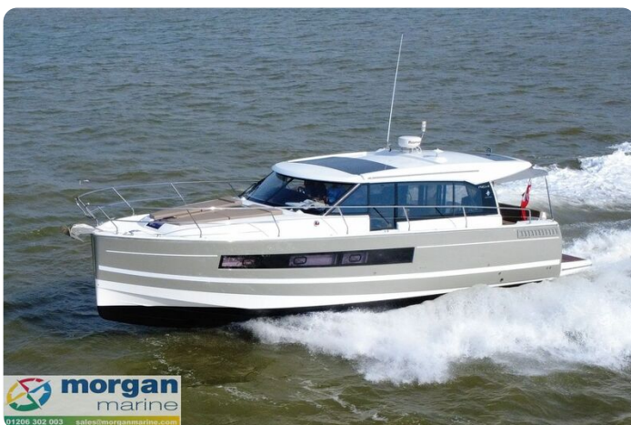
Jeanneau NC 14 - action on water