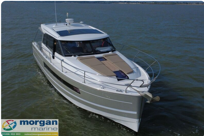
Jeanneau NC 14 - anchor