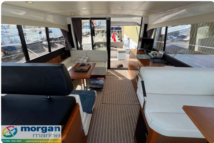
Jeanneau NC 14 - carpet