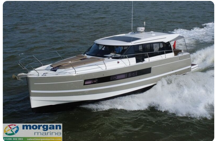
Jeanneau NC 14 - action