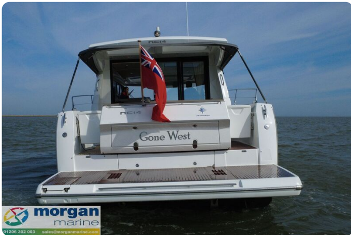
Jeanneau NC 14 - flag