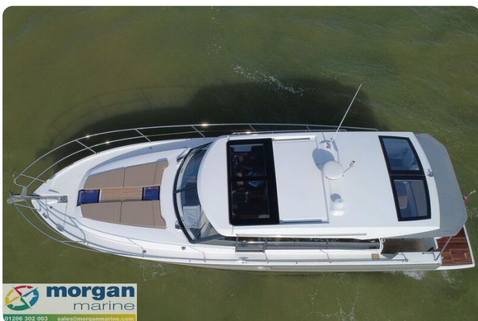
Jeanneau NC 14 - roof