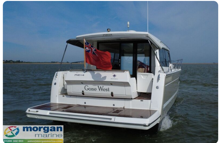
Jeanneau NC 14 - stern