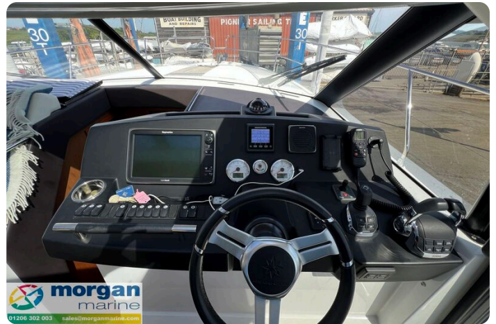
Jeanneau NC 14 - dash