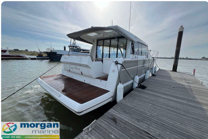
Jeanneau NC 14 - stern