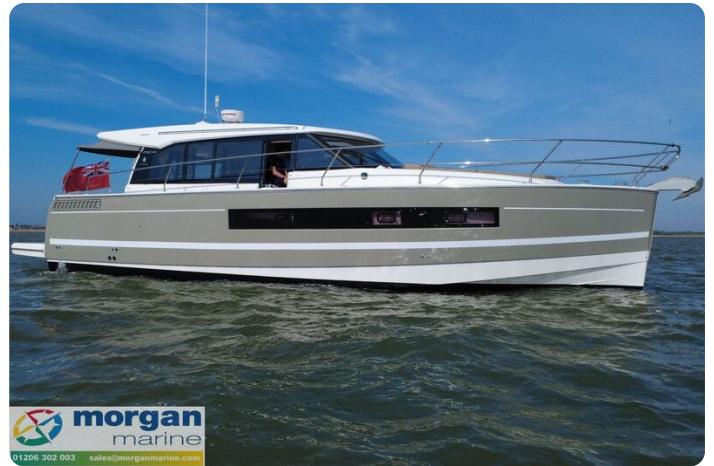
Jeanneau NC 14 - side