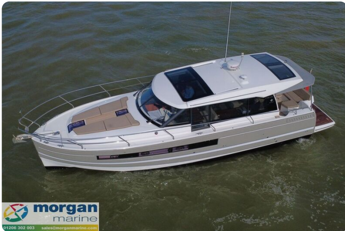
Jeanneau NC 14 - overview