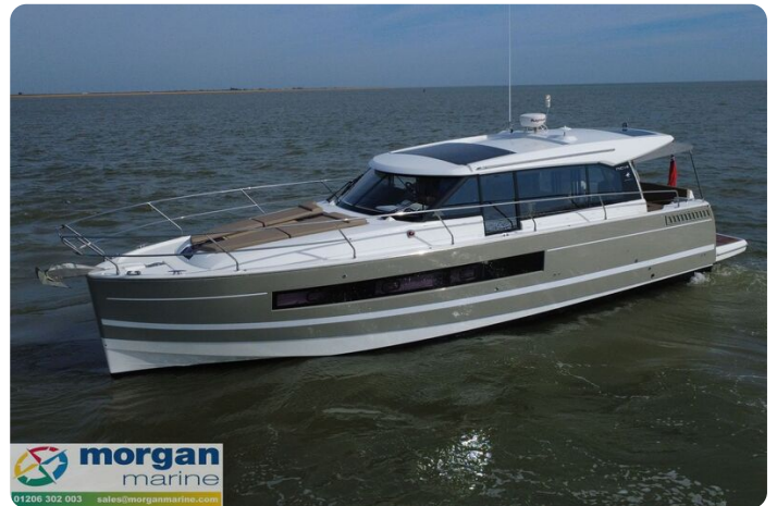
Jeanneau NC 14 - side on