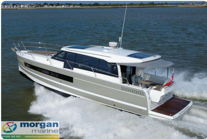
Jeanneau NC 14 - back