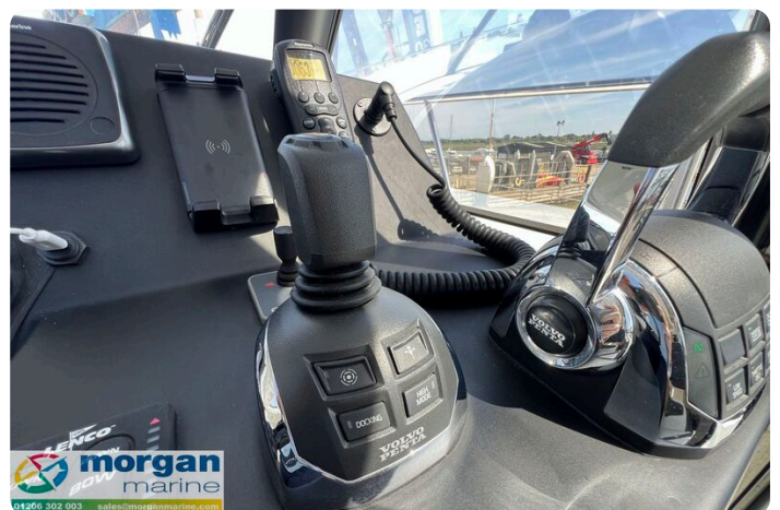
Jeanneau NC 14 - joystick