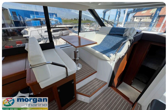
Jeanneau NC 14 - saloon table