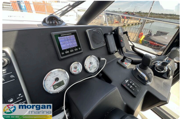
Jeanneau NC 14 - Dash