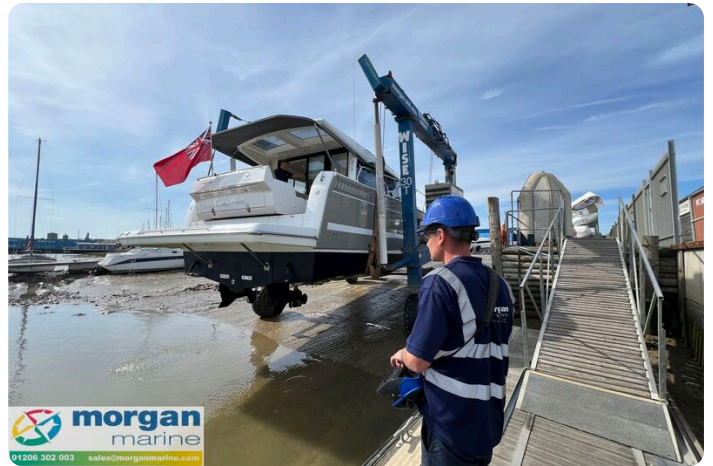
Jeanneau NC 14 - hoist in