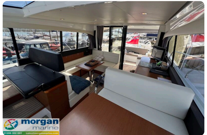
Jeanneau NC 14 - table saloon