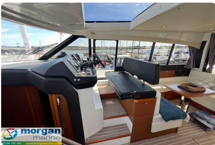
Jeanneau NC 14 - pilot seat