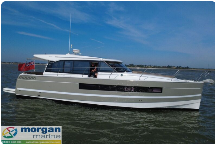
Jeanneau NC 14 - rails