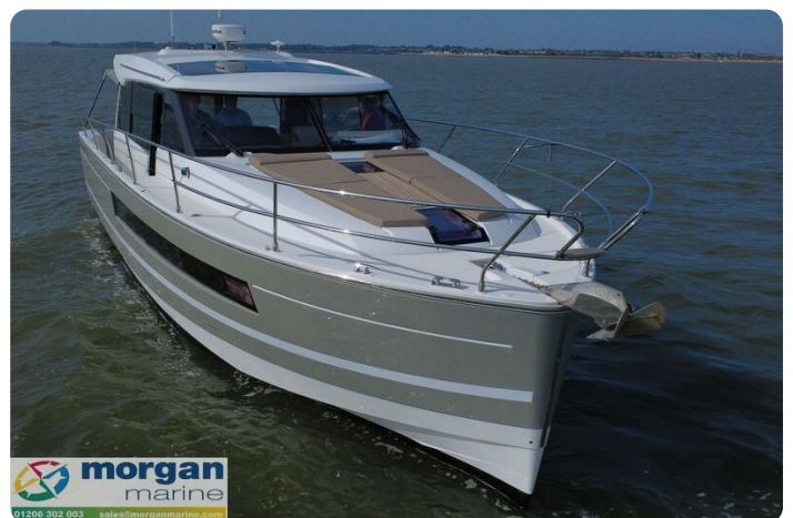
Jeanneau NC 14 - bow