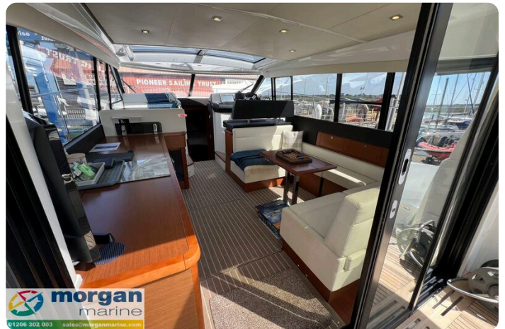
Jeanneau NC 14 - saloon area