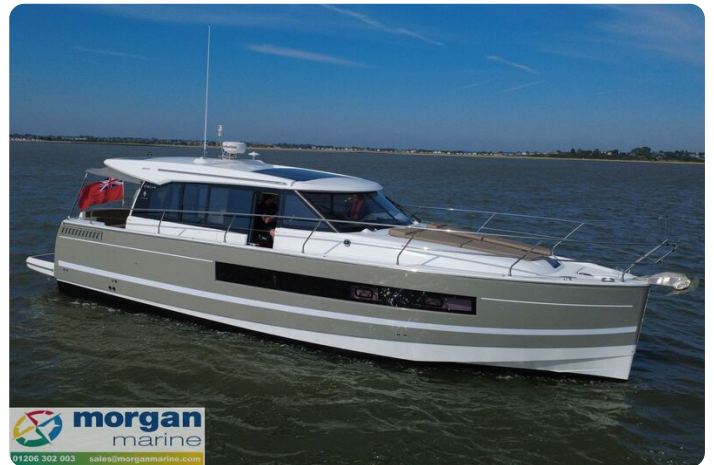
Jeanneau NC 14 - sun cushions