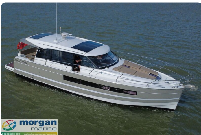
Jeanneau NC 14 - top view