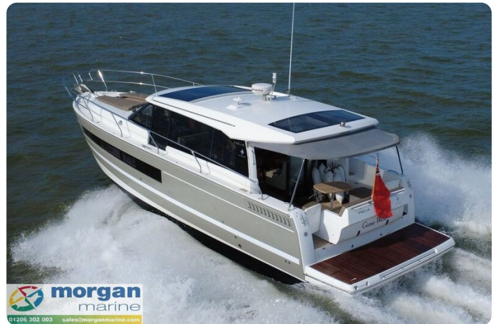
Jeanneau NC 14 - back