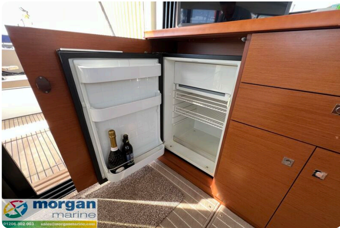
Jeanneau NC 14 - fridge