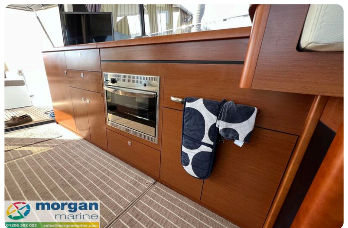
Jeanneau NC 14 - cooker