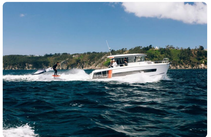
Jeanneau Merry Fisher 895 Sport - moving through the water