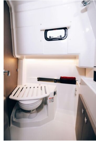
Jeanneau Merry Fisher 895 Sport - toilet and shower compartment