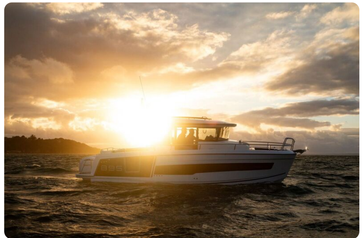
Jeanneau Merry Fisher 895 Sport - in beautiful sunset