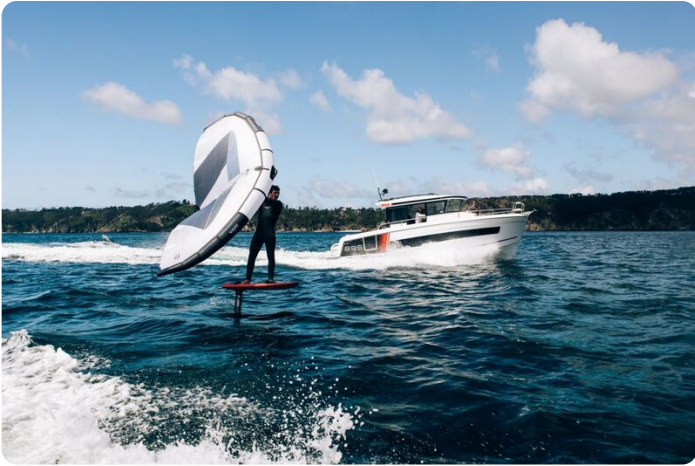
Jeanneau Merry Fisher 895 Sport - fun on the water