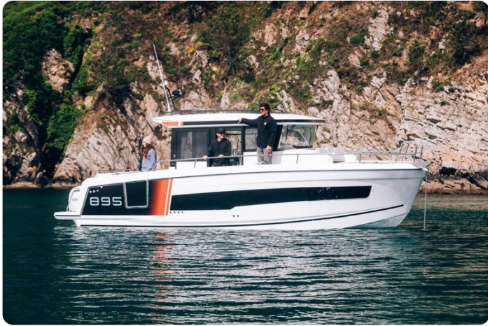
Jeanneau Merry Fisher 895 Sport