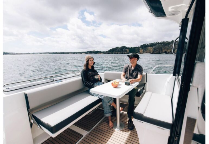
Jeanneau Merry Fisher 895 Sport - U shape cockpit saloon