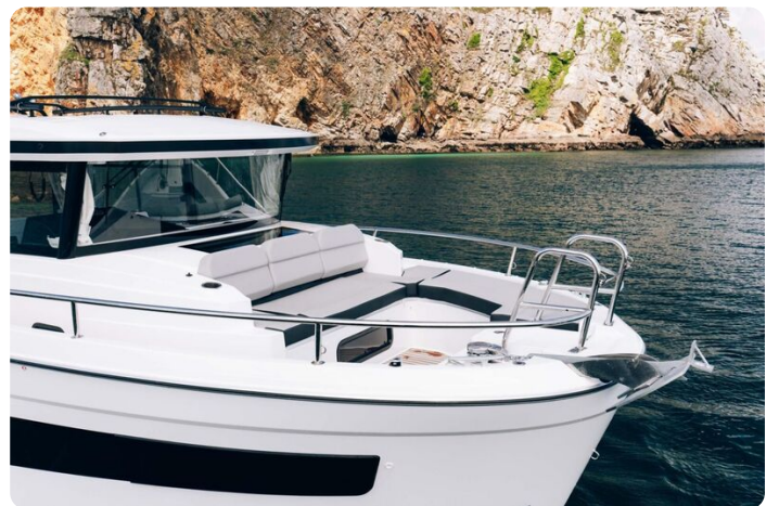
Jeanneau Merry Fisher 895 Sport - bow and pulpits rails