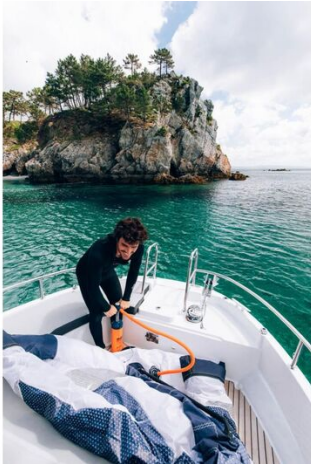
Jeanneau Merry Fisher 895 Sport - cushioned seating in bow