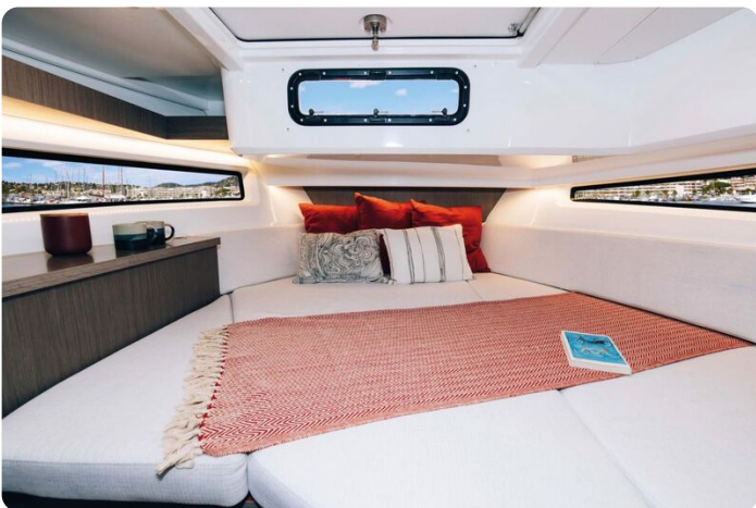
Jeanneau Merry Fisher 895 Sport - forward cabin