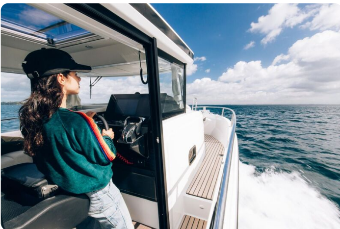
Jeanneau Merry Fisher 895 Sport - starboard side helm door and side deck