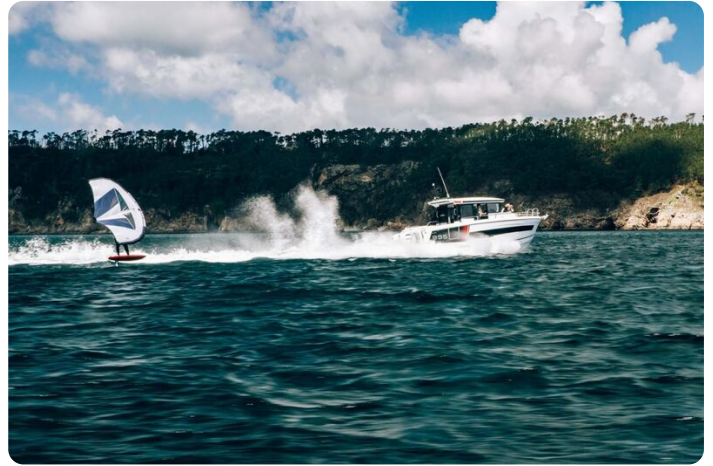
Jeanneau Merry Fisher 895 Sport - moving through the water