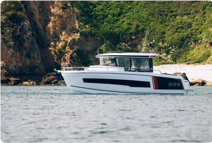
Jeanneau Merry Fisher 895 Sport - port side view on the water