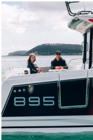
Jeanneau Merry Fisher 895 Sport - cockpit side gate on starboard side