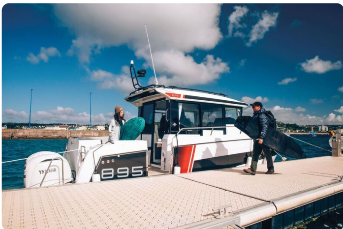
Jeanneau Merry Fisher 895 Sport - easy access to pontoons through cockpit side gate