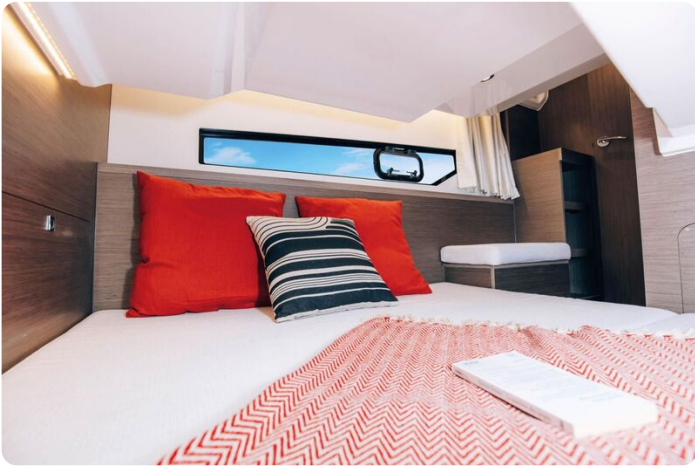
Jeanneau Merry Fisher 895 Sport - aft cabin