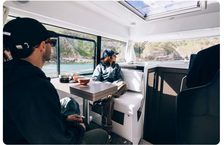
Jeanneau Merry Fisher 895 Sport - port side wheelhouse saloon