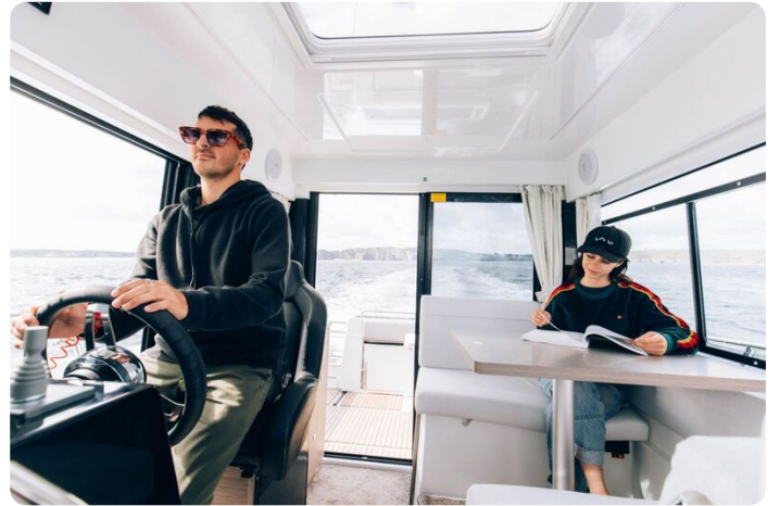
Jeanneau Merry Fisher 895 Sport - view from cabin steps through wheelhouse to aft