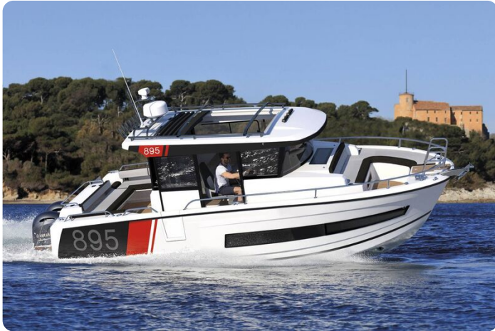
Jeanneau Merry Fisher 895 Sport