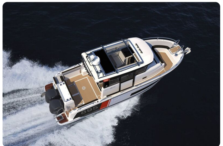
Jeanneau Merry Fisher 895 Sport - overhead view