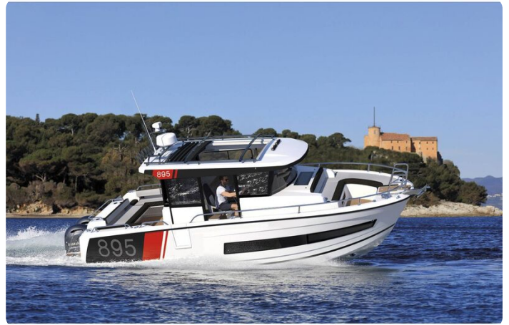
Jeanneau Merry Fisher 895 Sport - planing on the water