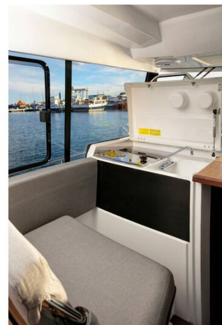
Jeanneau Merry Fisher 895 Sport - co-pilot bench