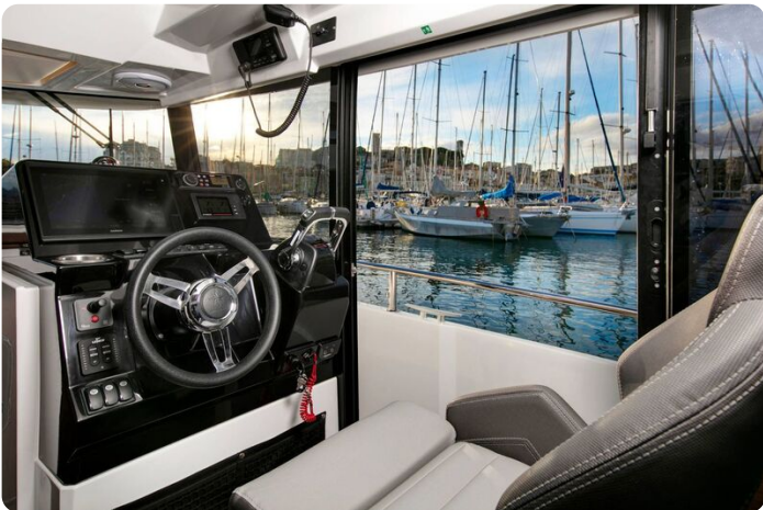
Jeanneau Merry Fisher 895 Sport - helm position and side door