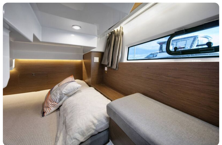
Jeanneau Merry Fisher 895 Sport - aft cabin