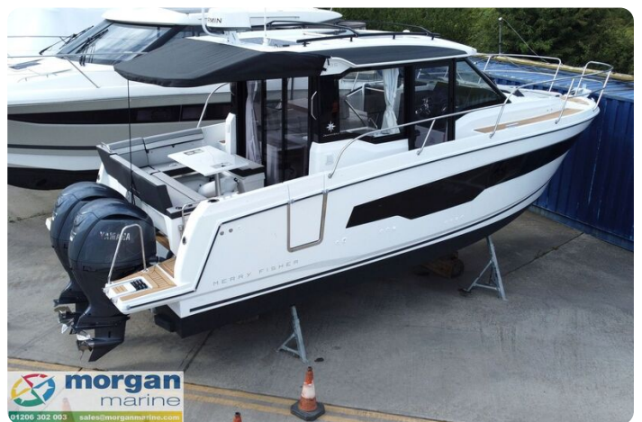
Jeanneau Merry Fisher 895 Series 2 - overhead view from starboard side aft