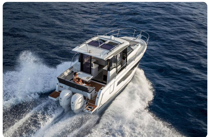
Jeanneau Merry Fisher 895 - overhead view from starboard side aft