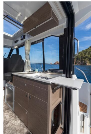
Jeanneau Merry Fisher 895 - starboard side galley