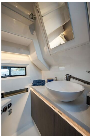
Jeanneau Merry Fisher 895 - toilet compartment