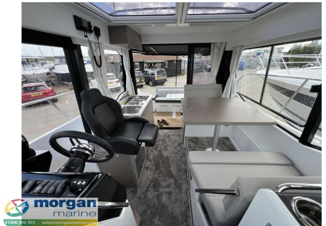
Jeanneau Merry Fisher 895 Series 2 - rotating helm seat