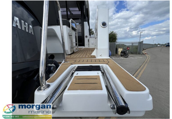
Jeanneau Merry Fisher 895 Series 2 - swim platform with folding boarding ladder