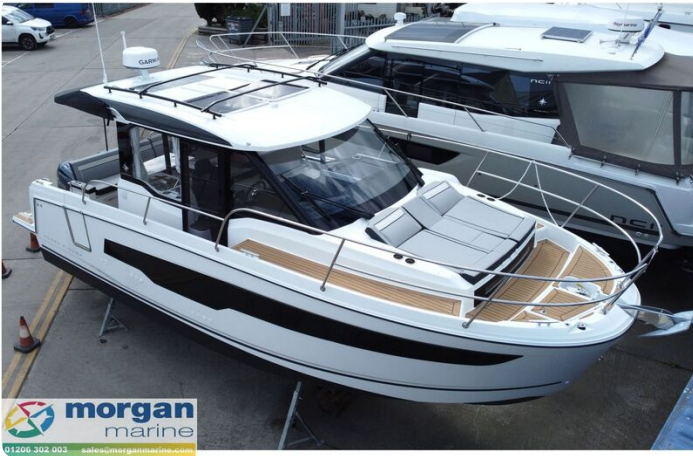
Jeanneau Merry Fisher 895 Series 2