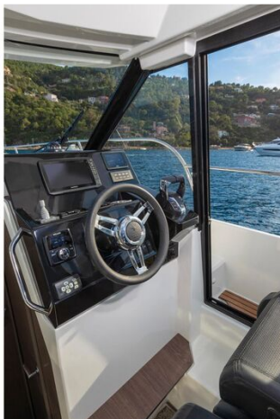
Jeanneau Merry Fisher 895 - helm position