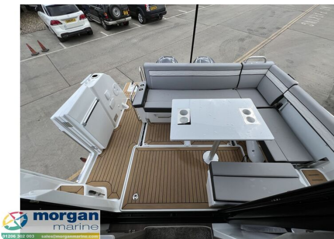
Jeanneau Merry Fisher 895 Series 2 - aft cockpit