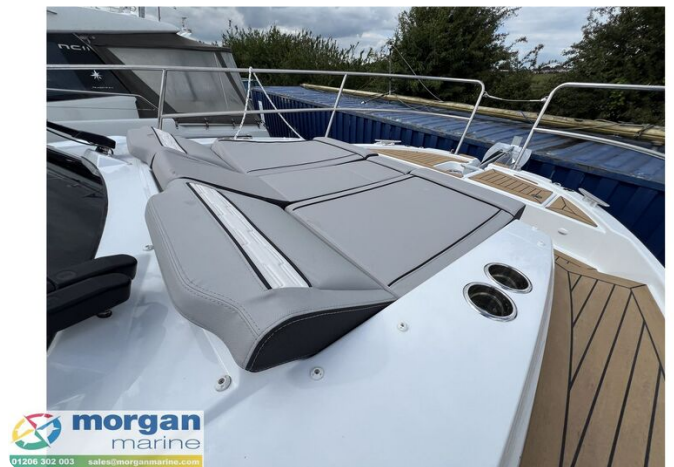
Jeanneau Merry Fisher 895 Series 2 - view from bow seating to pulpits rails