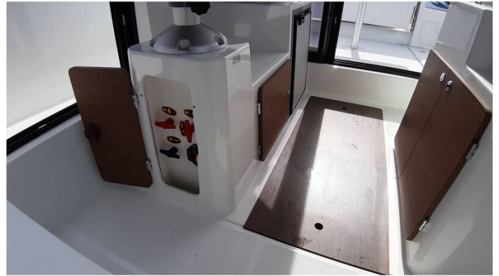
Jeanneau Merry Fisher 795 Sport - Series 2 - breakers