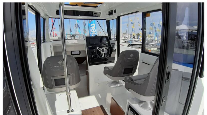
Jeanneau Merry Fisher 795 Sport - Series 2 - wheelhouse interior