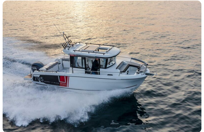
Jeanneau Merry Fisher 795 Sport - Series 2 - on the water