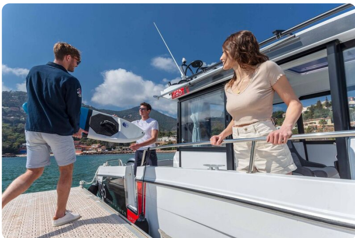
Jeanneau Merry Fisher 795 Sport - Series 2 - easy access to pontoons