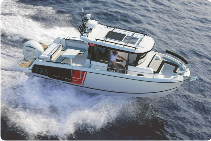
Jeanneau Merry Fisher 795 Sport - Series 2