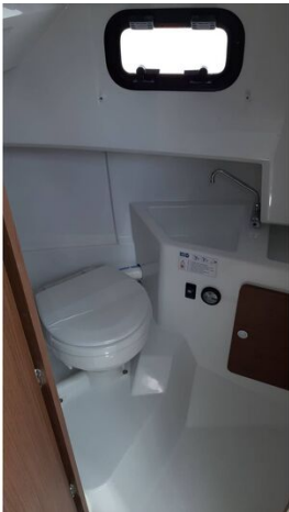
Jeanneau Merry Fisher 795 Sport - Series 2 - toilet compartment