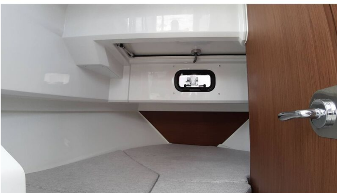
Jeanneau Merry Fisher 795 Sport - Series 2 - forward cabin