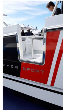
Jeanneau Merry Fisher 795 Sport - Series 2 - cockpit side gate for easy access to pontoon