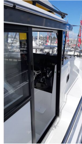
Jeanneau Merry Fisher 795 Sport - Series 2 - helm side door