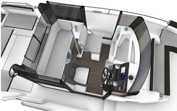
Jeanneau Merry Fisher 795 Sport - Series 2 - render of wheelhouse with aft bench