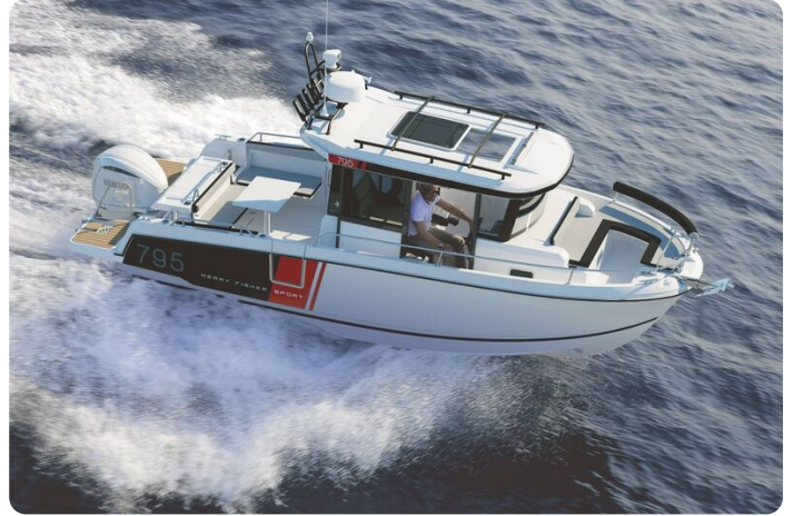
Jeanneau Merry Fisher 795 Sport - Series 2