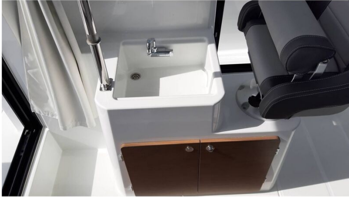
Jeanneau Merry Fisher 795 Sport - Series 2 - galley behind helm seat