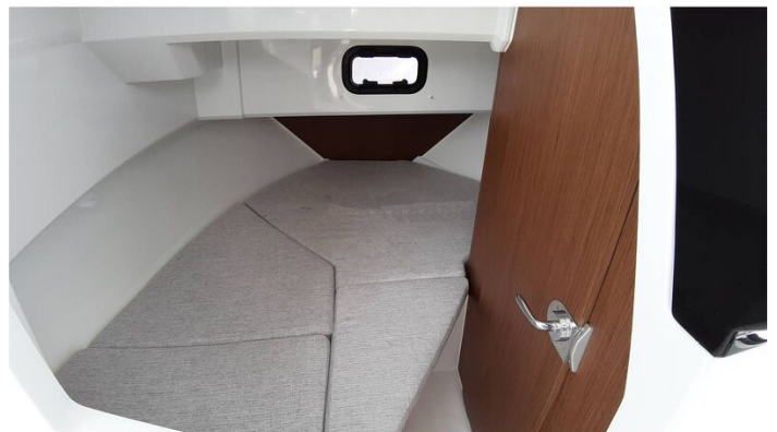
Jeanneau Merry Fisher 795 Sport - Series 2 - forward cuddy with cushions