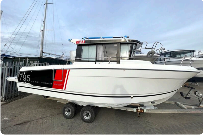
Jeanneau Merry Fisher 795 Sport - Series 2 - at Morgan Marine