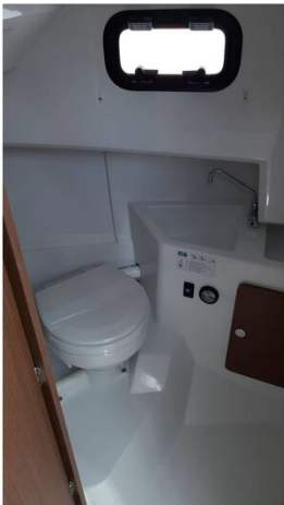
Jeanneau Merry Fisher 795 Sport - Series 2 - toilet compartment