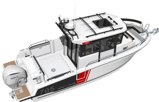
Jeanneau Merry Fisher 795 Sport - Series 2 - render of overhead view