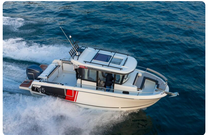
Jeanneau Merry Fisher 795 Sport - Series 2 - overhead view of starboard on the water