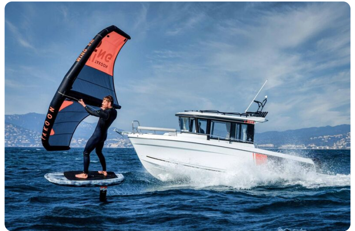
Jeanneau Merry Fisher 795 Sport - Series 2 - great for paddleboards and fun on the water