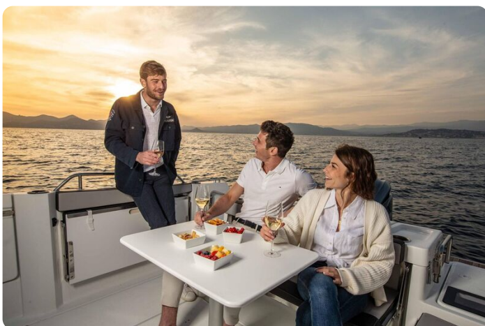
Jeanneau Merry Fisher 795 Sport - Series 2 - aft cockpit table and seating