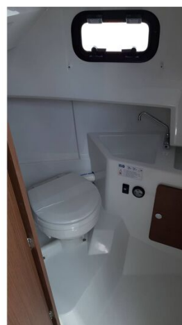
Jeanneau Merry Fisher 795 Sport - Series 2 - toilet compartment