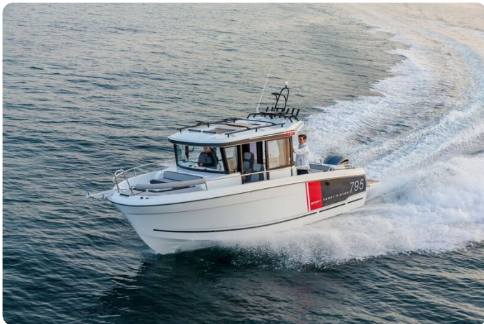
Jeanneau Merry Fisher 795 Sport - Series 2 - on the water