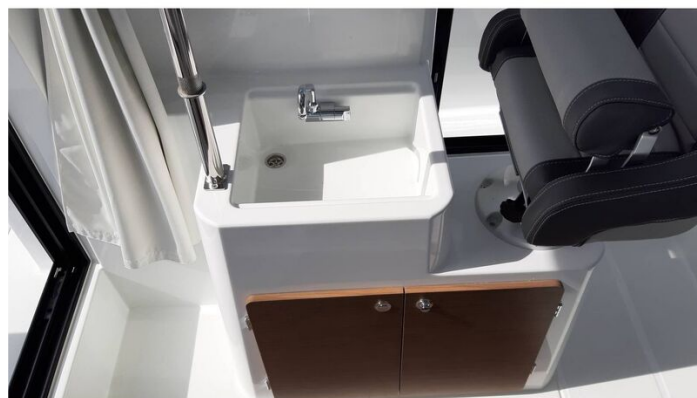
Jeanneau Merry Fisher 795 Sport - Series 2 - galley behind helm seat