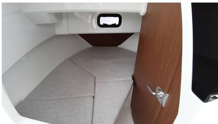
Jeanneau Merry Fisher 795 Sport - Series 2 - forward cuddy with cushions