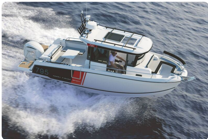
Jeanneau Merry Fisher 795 Sport - Series 2