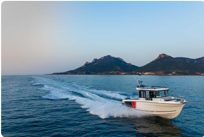
Jeanneau Merry Fisher 795 Sport - Series 2 - moving through the water