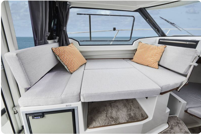
Jeanneau Merry Fisher 795 Series 2 - wheelhouse table converts to berth