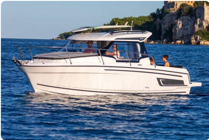
Jeanneau Merry Fisher 795 Series 2 - on the water