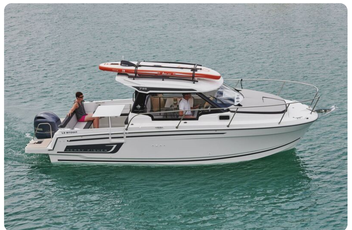
Jeanneau Merry Fisher 795 Series 2 - overhead view from starboard side with storage rack on roof