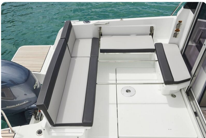
Jeanneau Merry Fisher 795 Series 2 - U-shape cockpit saloon seating