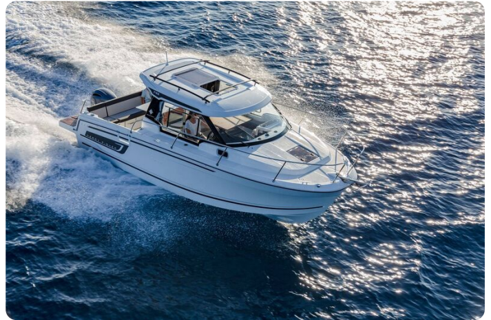
Jeanneau Merry Fisher 795 Series 2 - overhead view towards bow with cabin deck hatch and wheelhouse roof hatch