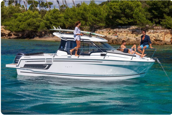
Jeanneau Merry Fisher 795 Series 2