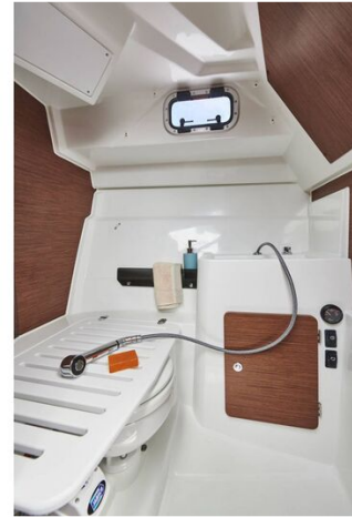
Jeanneau Merry Fisher 795 Series 2 - toilet compartment