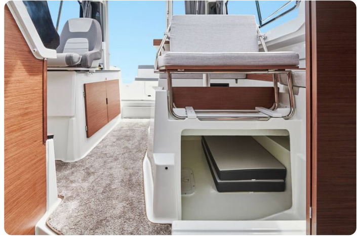
Jeanneau Merry Fisher 795 Series 2 - storage under co-pilot seat