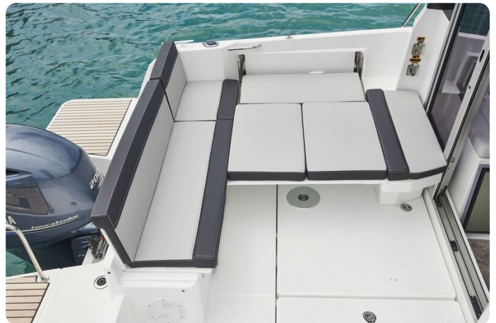
Jeanneau Merry Fisher 795 Series 2 - U-shape cockpit saloon seating with infill for sun lounger