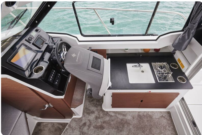
Jeanneau Merry Fisher 795 Series 2 - helm seat folds forward for easy access to galley