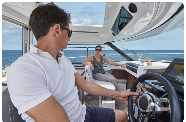
Jeanneau Merry Fisher 795 Series 2 - helm and co-pilot seats