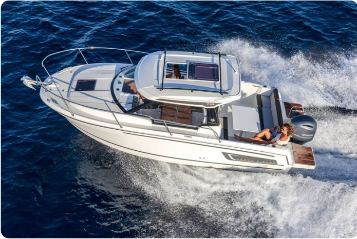
Jeanneau Merry Fisher 795 Series 2 - overhead view of port side and wheelhouse roof hatch