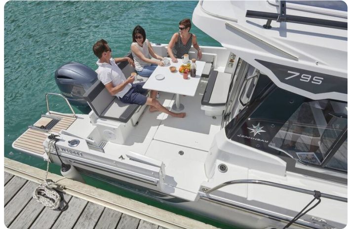
Jeanneau Merry Fisher 795 Series 2 - aft cockpit saloon with table and side gate