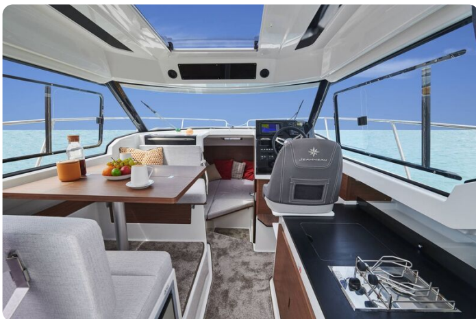
Jeanneau Merry Fisher 795 Series 2 - wheelhouse with port side saloon seating and starboard side helm position and galley