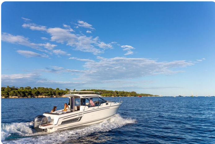
Jeanneau Merry Fisher 795 Series 2 - a beautiful day on the water