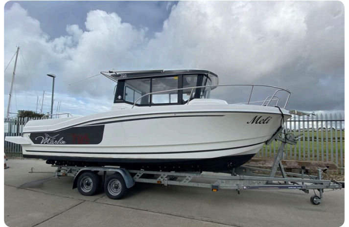
Jeanneau Merry Fisher 795 Marlin - starboard side