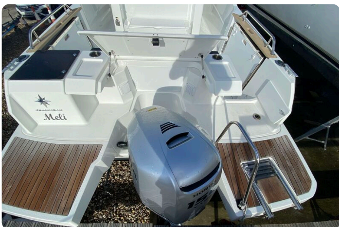
Jeanneau Merry Fisher 795 Marlin-engine