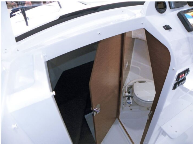
Jeanneau Merry Fisher 695 Sport - toilet compartment