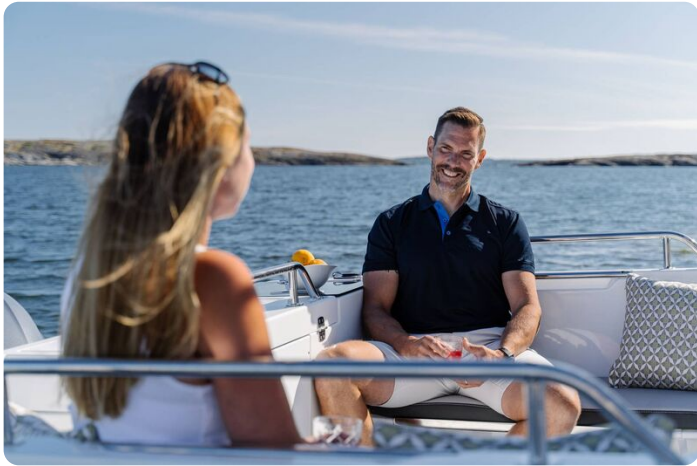
Jeanneau Merry Fisher 695 Sport - great for relaxing on the water