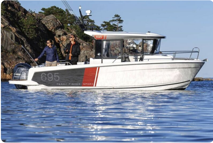
Jeanneau Merry Fisher 695 Sport