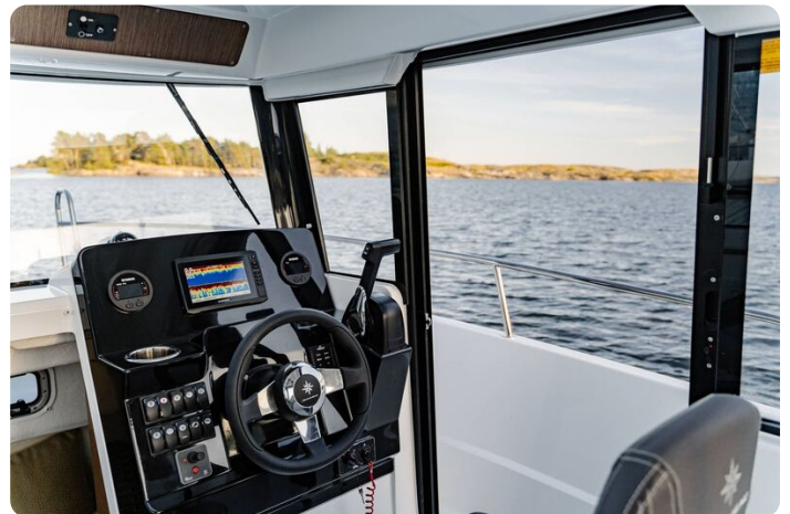
Jeanneau Merry Fisher 695 Sport - helm position and side door