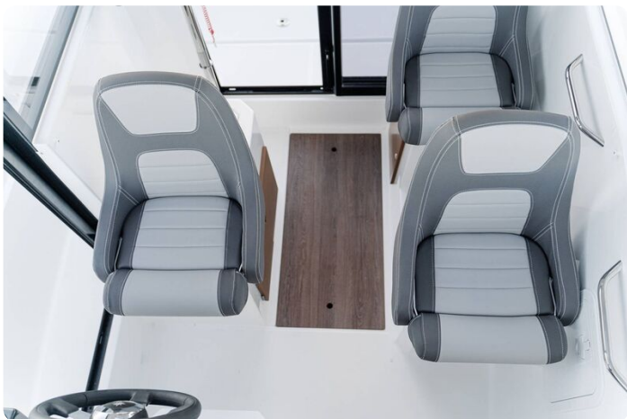
Jeanneau Merry Fisher 695 Sport - render of wheelhouse seating