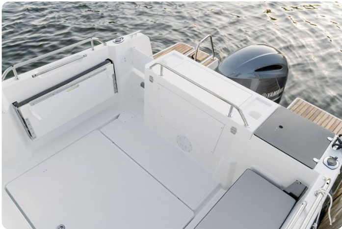
Jeanneau Merry Fisher 695 Sport - large aft cockpit