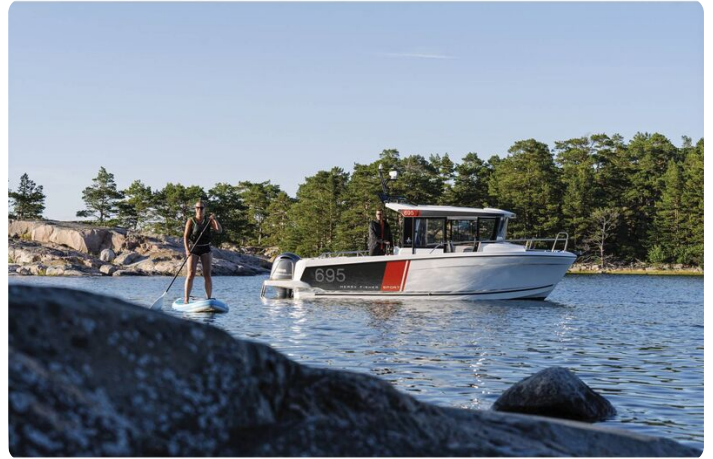
Jeanneau Merry Fisher 695 Sport - great for fun and adventures on the water