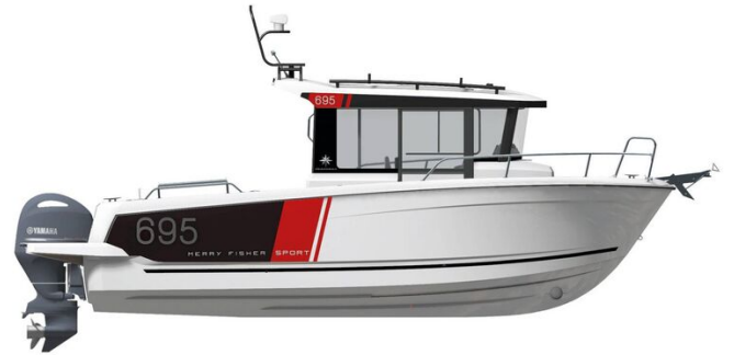
Jeanneau Merry Fisher 695 Sport - diagram of side view