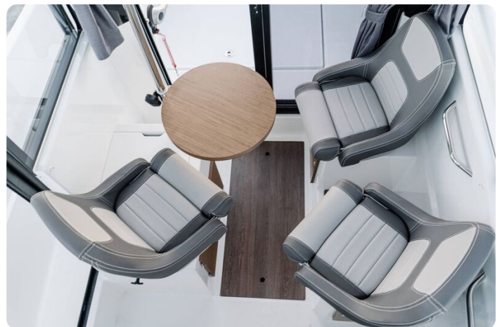
Jeanneau Merry Fisher 695 Sport - render of wheelhouse with table