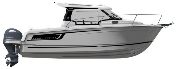
Jeanneau Merry Fisher 695 Series 2 - diagram of side view