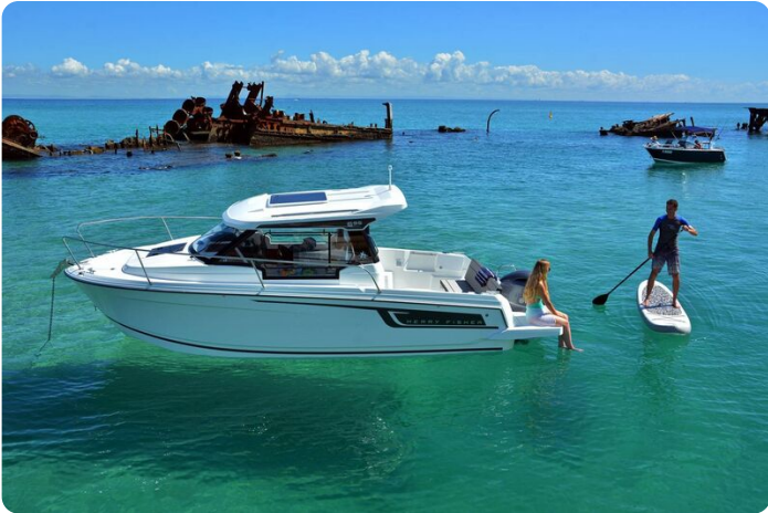
Jeanneau Merry Fisher 695 Series 2 - fun on the water