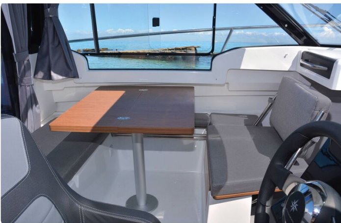
Jeanneau Merry Fisher 695 Series 2 - co-pilot bench converts to seating at table