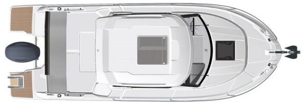
Jeanneau Merry Fisher 695 Series 2 - diagram of overhead view