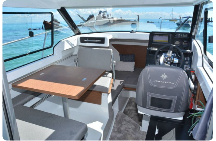
Jeanneau Merry Fisher 695 Series 2 - wheelhouse with port side saloon and starboard side helm position and galley