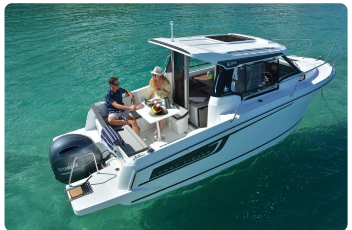
Jeanneau Merry Fisher 695 Series 2 - aft cockpit saloon