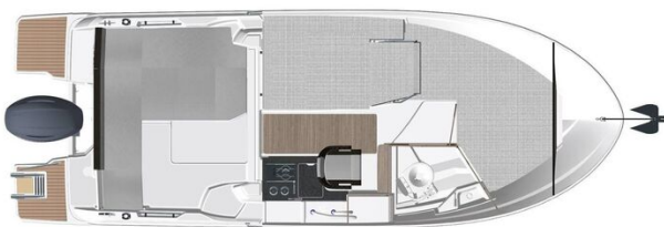
Jeanneau Merry Fisher 695 Series 2 - diagram of cabin and berth conversion