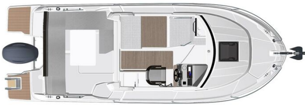
Jeanneau Merry Fisher 695 Series 2 - diagram of wheelhouse interior