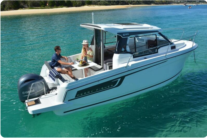
Jeanneau Merry Fisher 695 Series 2