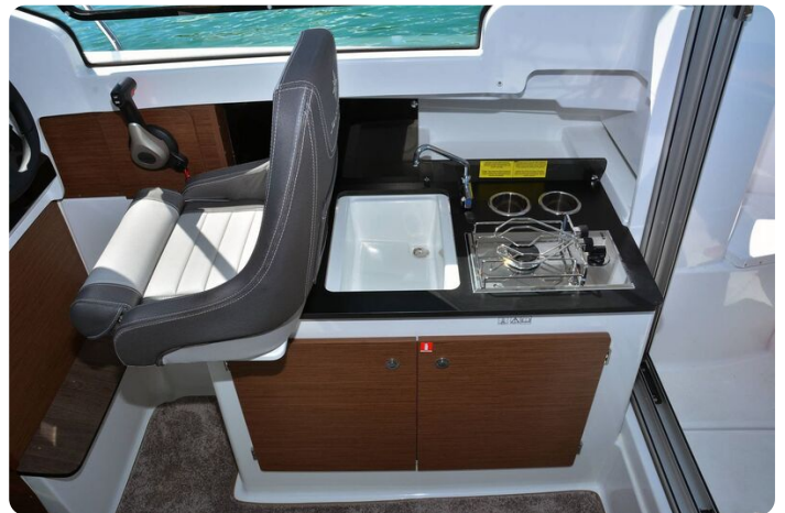
Jeanneau Merry Fisher 695 Series 2 - galley behind helm seat