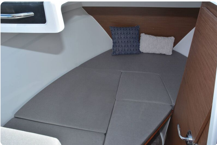
Jeanneau Merry Fisher 695 Series 2 - forward cabin with double berth