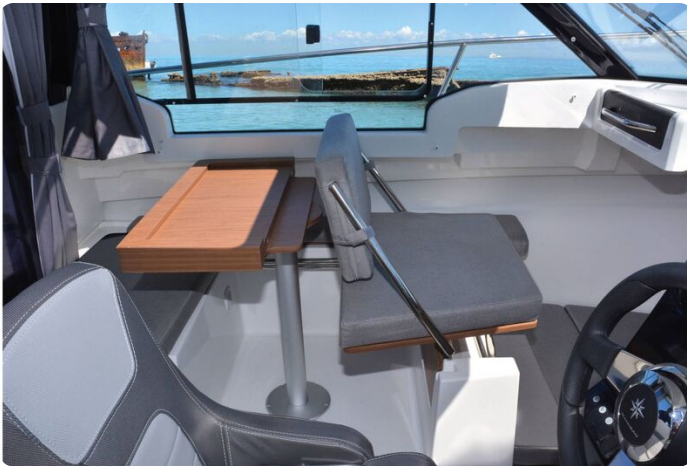
Jeanneau Merry Fisher 695 Series 2 - co-pilot bench