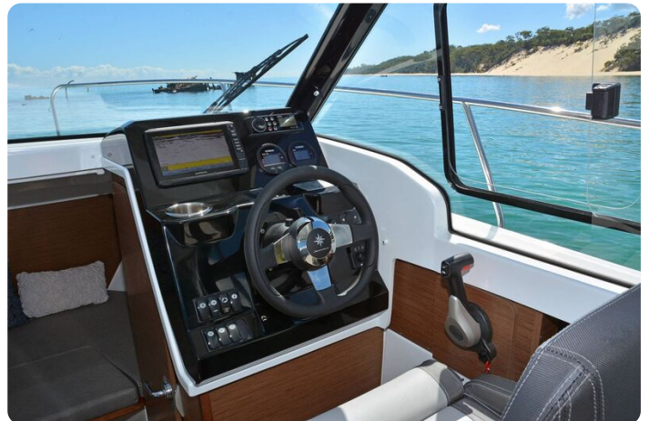
Jeanneau Merry Fisher 695 Series 2 - helm position