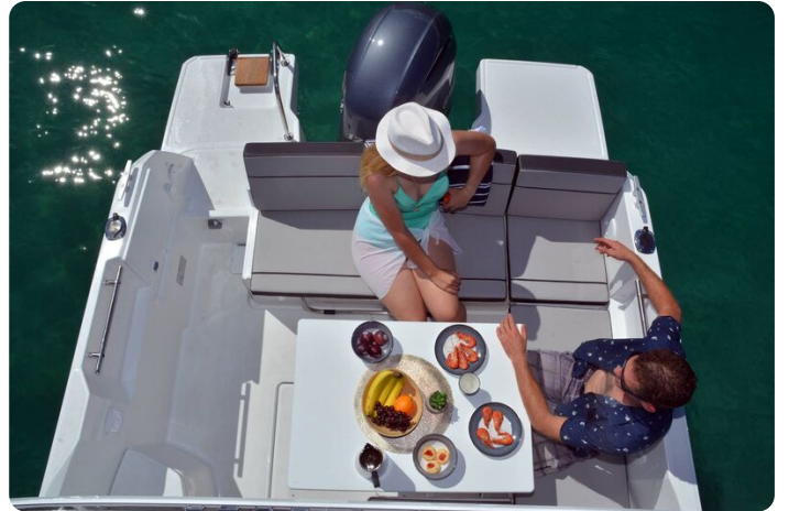
Jeanneau Merry Fisher 695 Series 2 - aft cockpit saloon and swim platforms