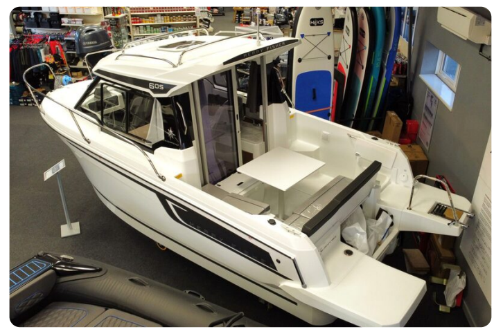
Jeanneau Merry Fisher 605 - in stock at Morgan Marine - view towards cockpit