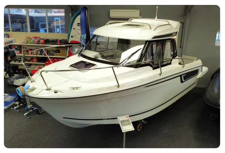
Jeanneau Merry Fisher 605 - in stock at Morgan Marine - view towards bow