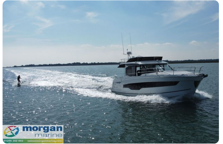
Jeanneau Merry Fisher 1295 Flybridge - wakeboarding - starboard side view