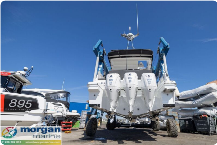
Jeanneau Merry Fisher 1295 Fly - triple Yamaha engines