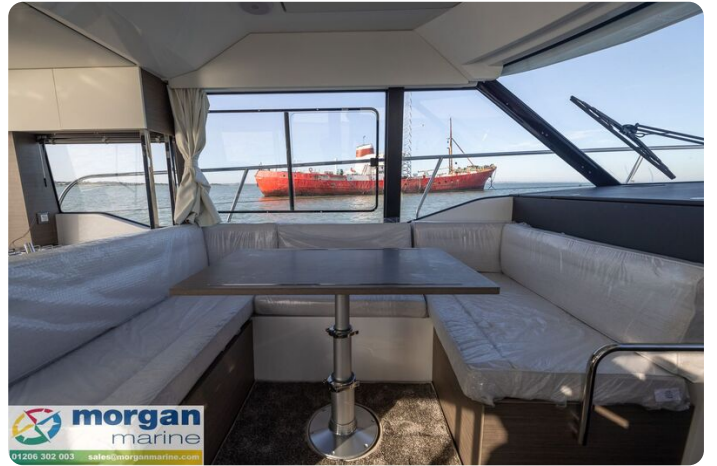
Jeanneau Merry Fisher 1295 Flybridge - saloon seating and table