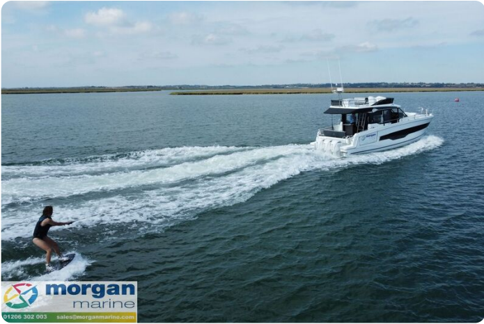
Jeanneau Merry Fisher 1295 Fly - wakeboarding - view towards aft