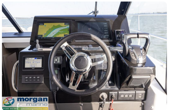
Jeanneau Merry Fisher 1295 Flybridge - dash and engine controls