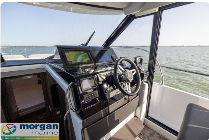
Jeanneau Merry Fisher 1295 Flybridge - helm position with side door