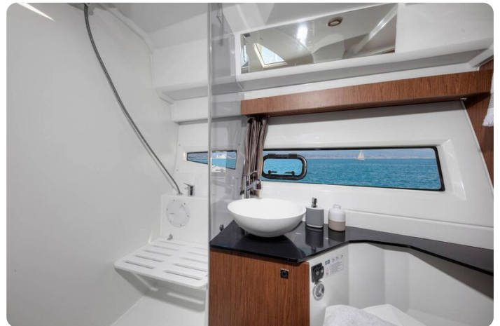
Jeanneau Merry Fisher 1095 Fly - toilet and shower compartment