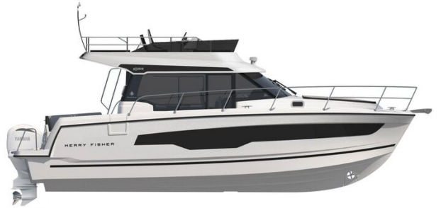
Jeanneau Merry Fisher 1095 Fly - diagram of side view