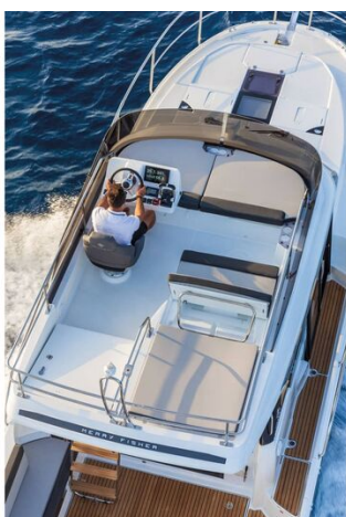
Jeanneau Merry Fisher 1095 Fly - overhead view of flybridge