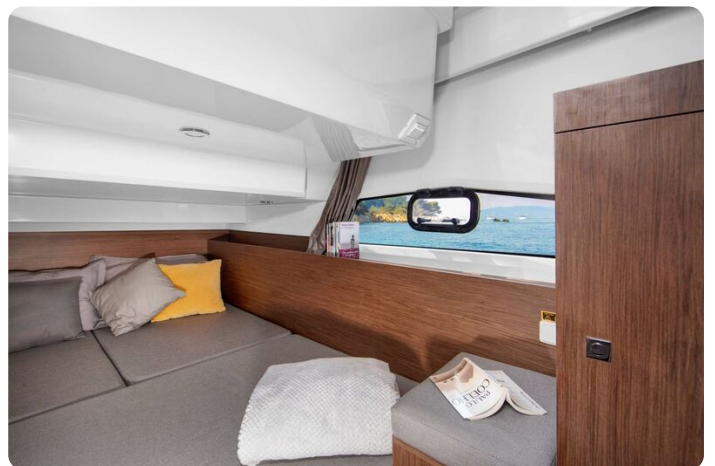
Jeanneau Merry Fisher 1095 Fly - 2nd cabin