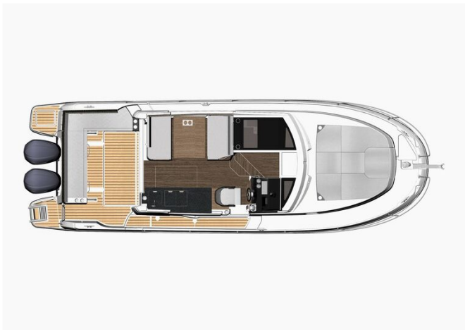
Jeanneau Merry Fisher 1095 Fly - diagram of top view and wheelhouse interior