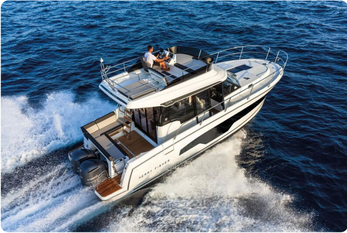
Jeanneau Merry Fisher 1095 Fly