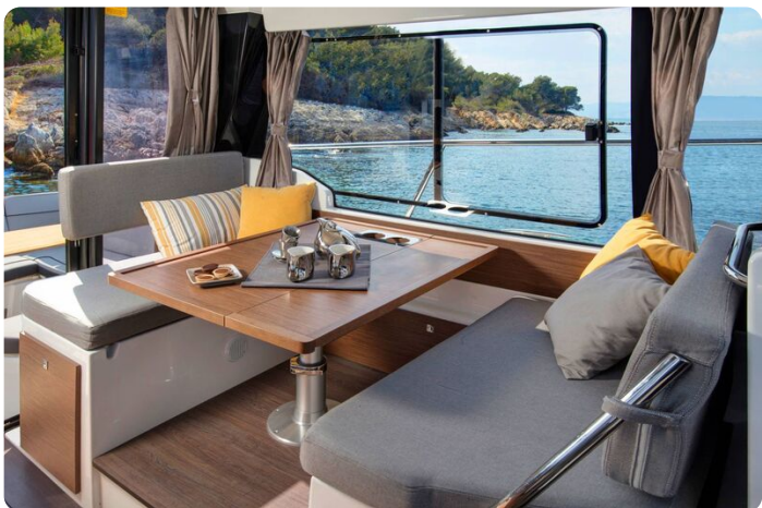
Jeanneau Merry Fisher 1095 Fly - wheelhouse saloon