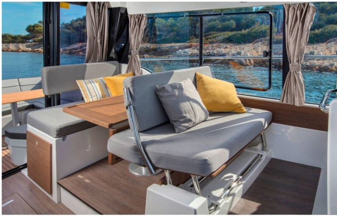
Jeanneau Merry Fisher 1095 Fly - co-pilot bench seat converts to saloon seating