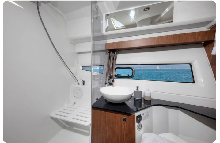
Jeanneau Merry Fisher 1095 Fly - toilet and shower compartment