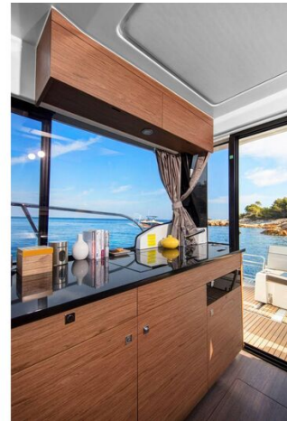
Jeanneau Merry Fisher 1095 Fly - wheelhouse galley