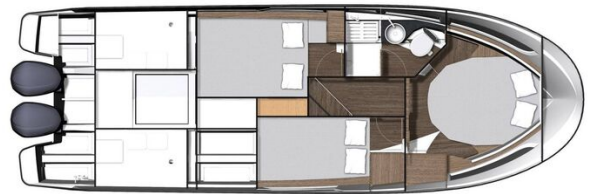
Jeanneau Merry Fisher 1095 Fly - diagram of cabin layout