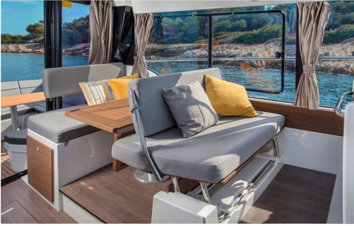
Jeanneau Merry Fisher 1095 Fly - co-pilot bench seat converts to saloon seating