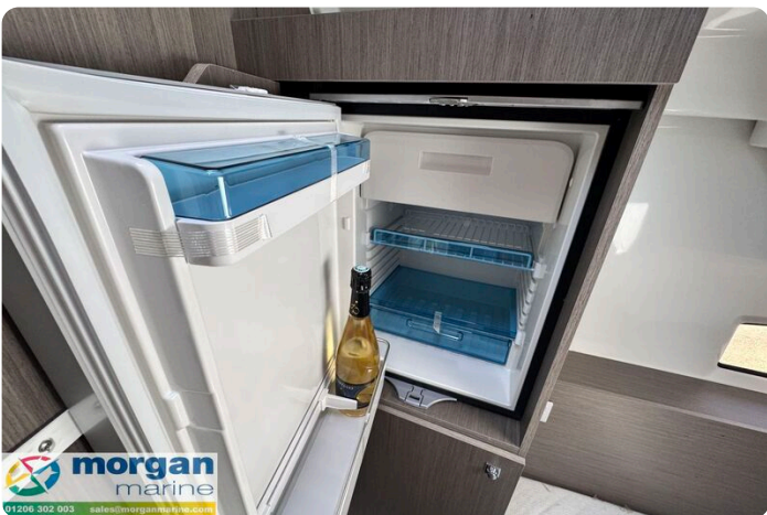
Merry Fisher 1095 - fridge