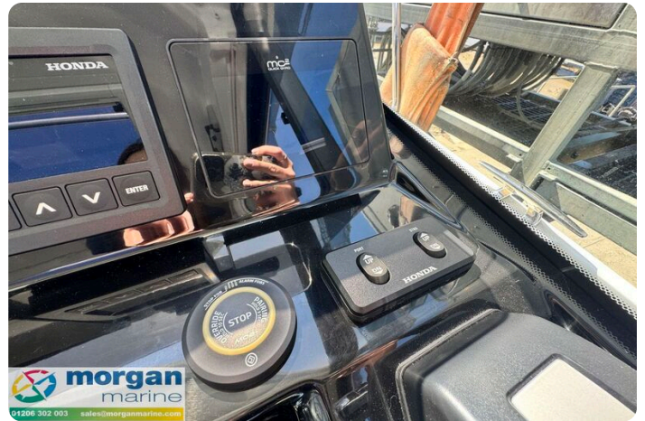
Merry Fisher 1095 - MOB