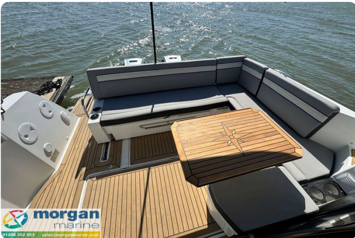
Merry Fisher 1095 - cockpit