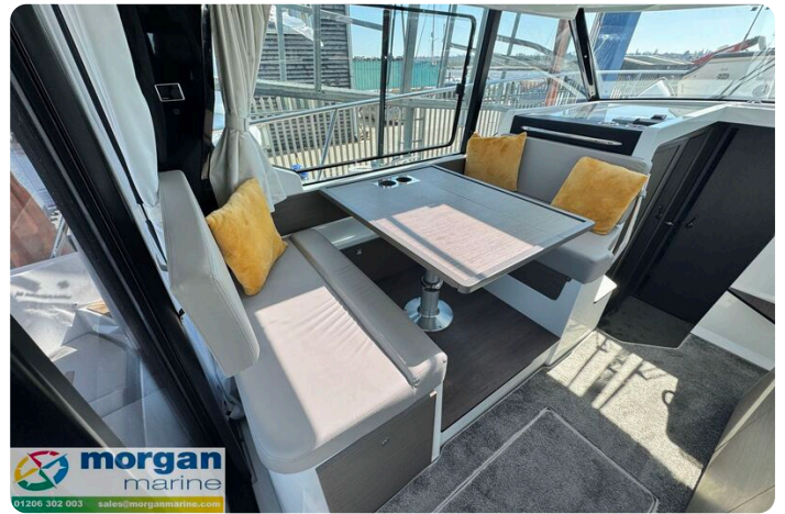
Merry Fisher 1095 - table