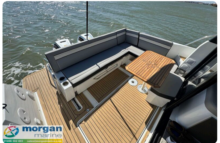
Merry Fisher 1095 - table