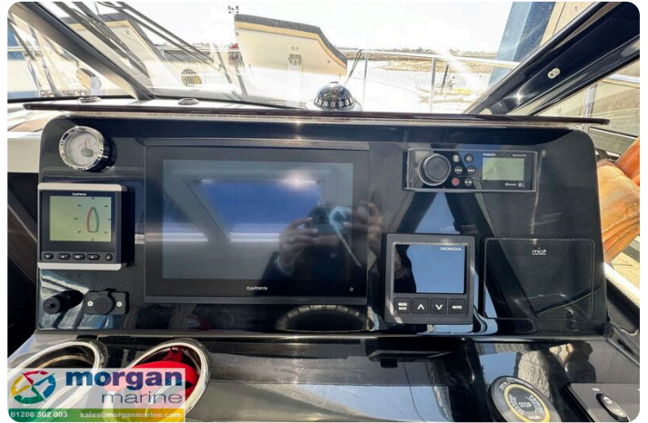
Merry Fisher 1095 - Garmin