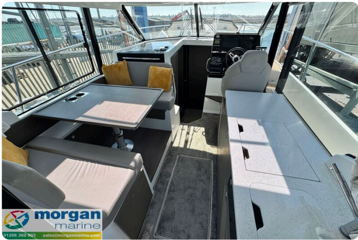
Merry Fisher 1095 - saloon