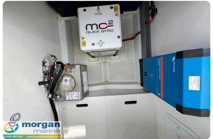
Merry Fisher 1095 - stabilizer