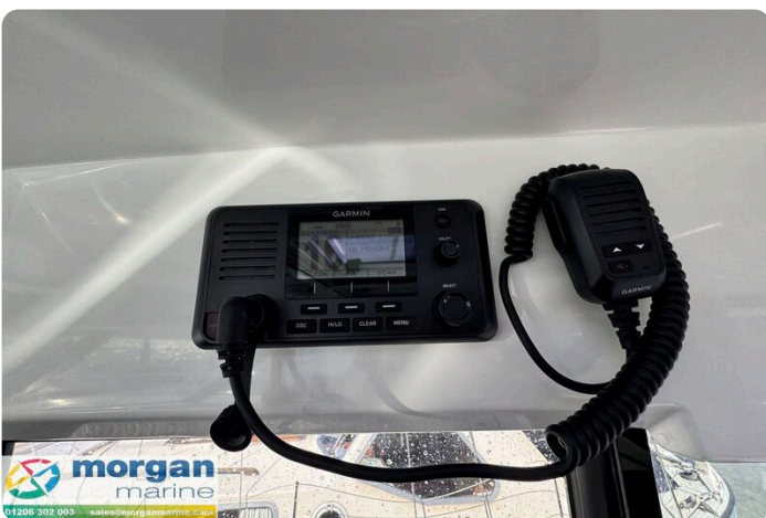
Merry Fisher 1095 - VHF