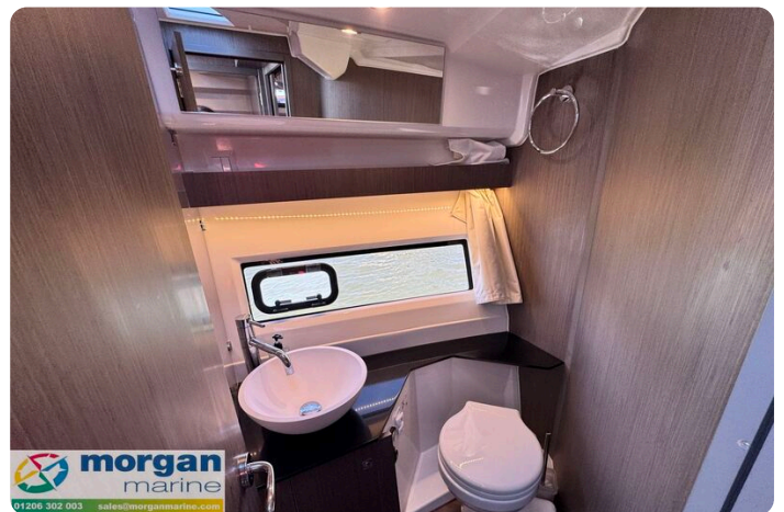
Merry Fisher 1095 - toilet