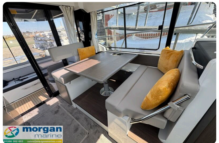
Merry Fisher 1095 - table view