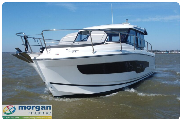
Merry Fisher 1095 - cleats