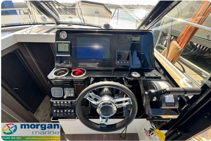
Merry Fisher 1095 - wheel