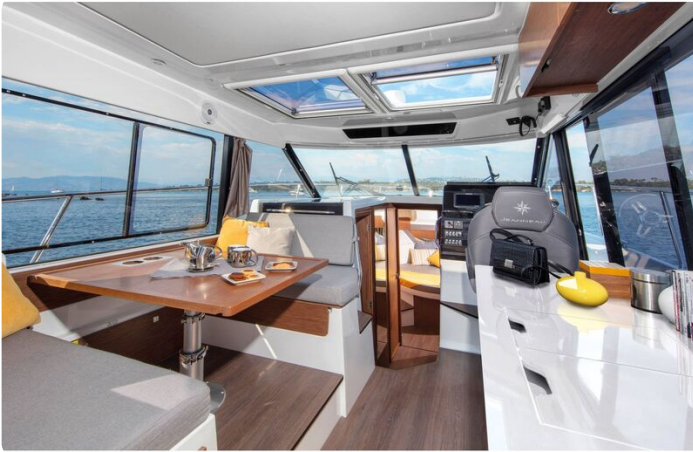
Jeanneau Merry Fisher 1095 - wheelhouse with port side seating and starboard side helm position and galley