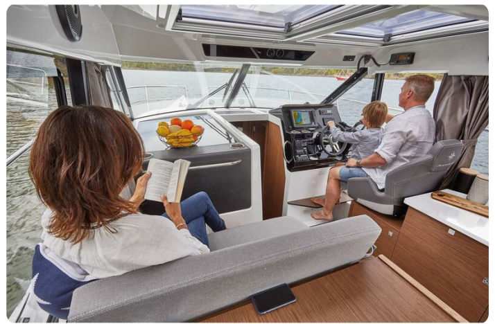
Jeanneau Merry Fisher 1095 - co-pilot seat and pilot seat