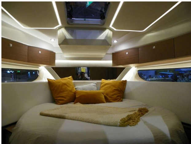
Jeanneau Merry Fisher 1095 - LED lights in the cabins