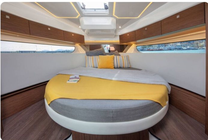
Jeanneau Merry Fisher 1095 - main cabin with double berth and hatch to deck