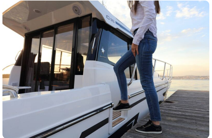
Jeanneau Merry Fisher 1095 - cockpit side gate for easy access from pontoon