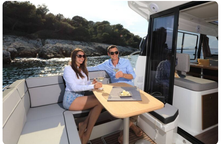
Jeanneau Merry Fisher 1095 - cockpit U shape saloon seating and table