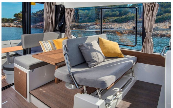
Jeanneau Merry Fisher 1095 - table folds and forward seat converts to co-pilot seat