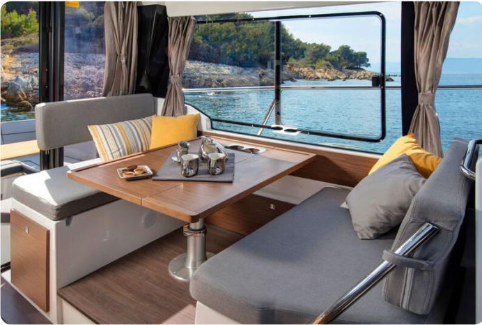
Jeanneau Merry Fisher 1095 - wheelhouse saloon seating and table