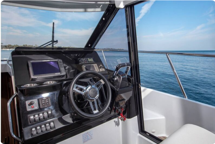
Jeanneau Merry Fisher 1095 - helm position and side door