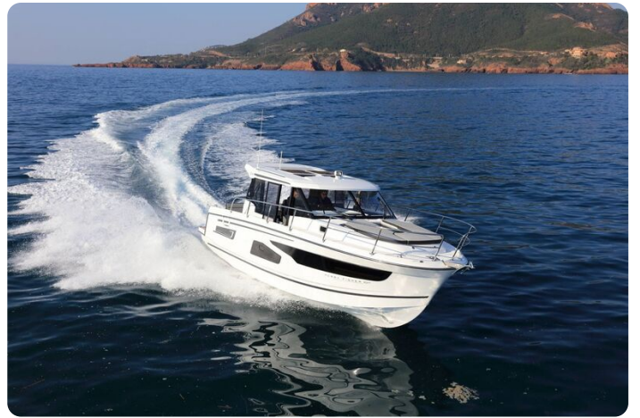
Jeanneau Merry Fisher 1095 - on the water