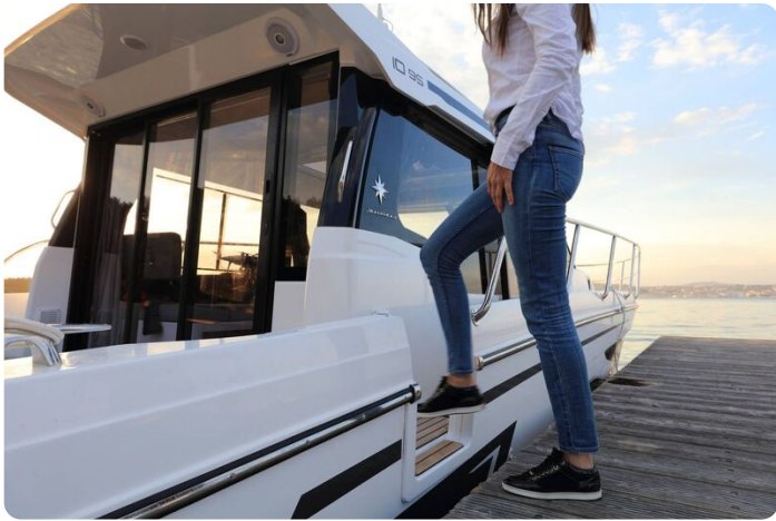
Jeanneau Merry Fisher 1095 - cockpit side gate for easy access from pontoon