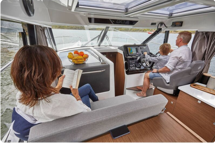
Jeanneau Merry Fisher 1095 - co-pilot seat and pilot seat