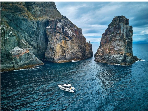
Jeanneau Merry Fisher 1095 - in beautiful surroundings