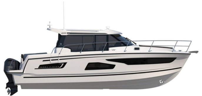
Jeanneau Merry Fisher 1095 - diagram of starboard side