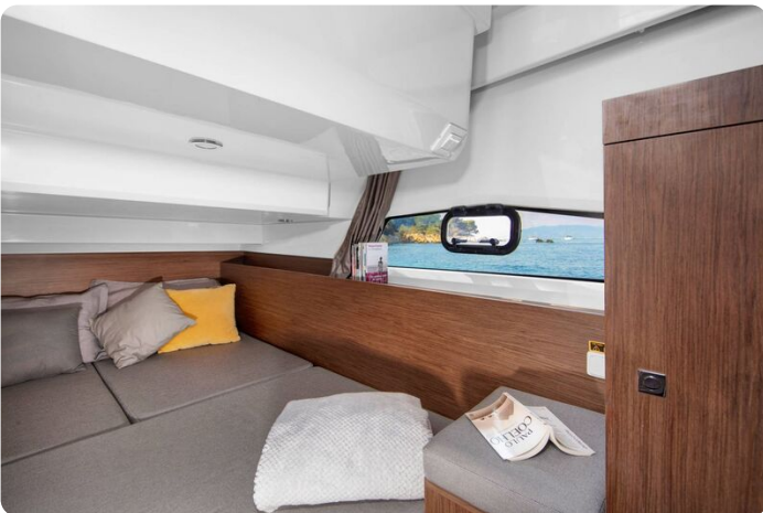
Jeanneau Merry Fisher 1095 - 3rd cabin