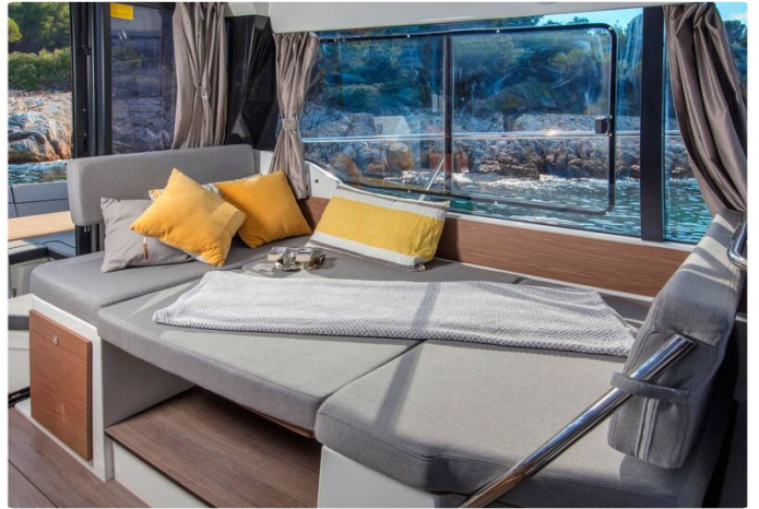
Jeanneau Merry Fisher 1095 - table in wheelhouse converts to berth