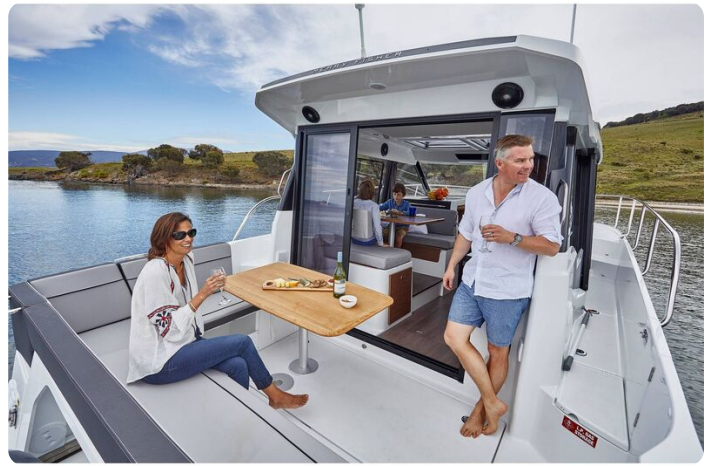
Jeanneau Merry Fisher 1095 - view from cockpit to wheelhouse