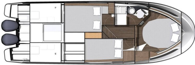
Jeanneau Merry Fisher 1095 - diagram of cabin layout