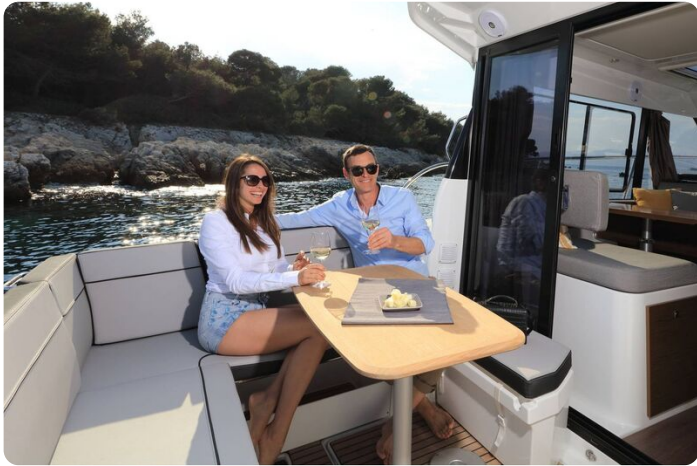
Jeanneau Merry Fisher 1095 - cockpit U shape saloon seating and table