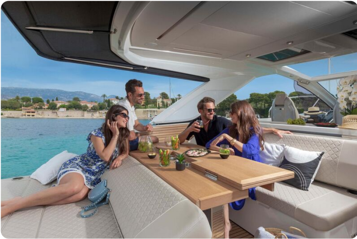
Jeanneau DB 43 inboard - sitting at cockpit table