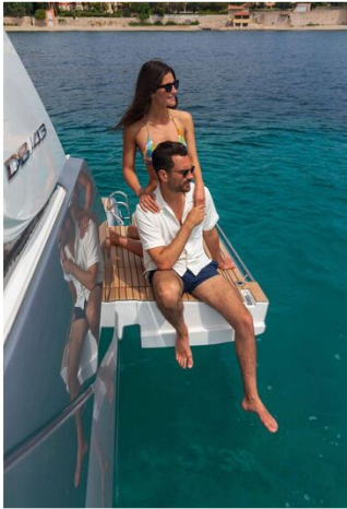
Jeanneau DB 43 inboard - relaxing on the port side terrace