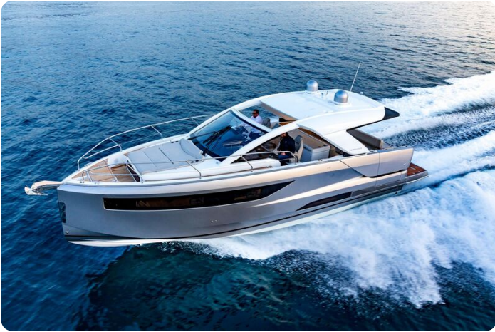
Jeanneau DB 43 inboard - on the water