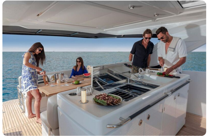
Jeanneau DB 43 inboard - cockpit galley