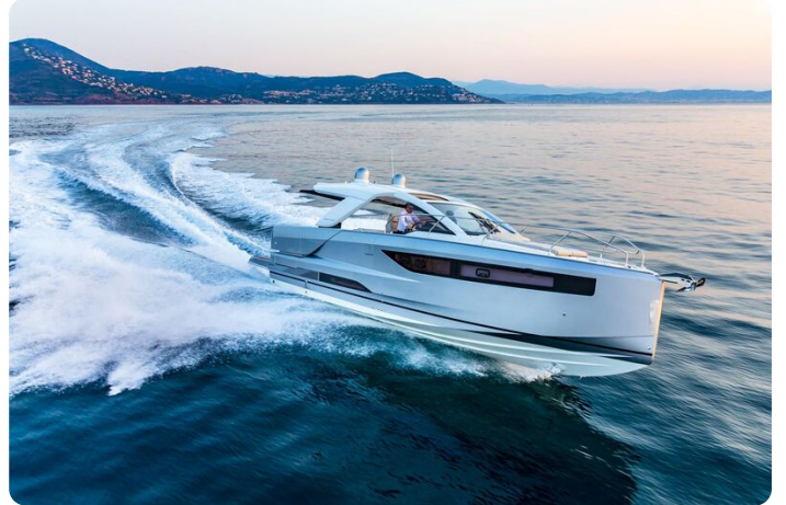
Jeanneau DB 43 inboard - on the water