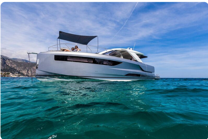
Jeanneau DB 43 inboard - port side hull