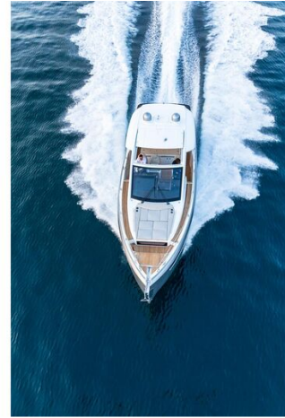
Jeanneau DB 43 inboard - with large wake