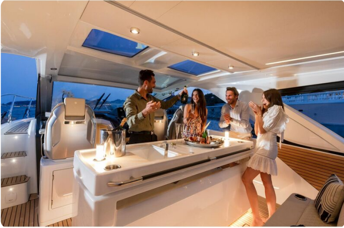
Jeanneau DB 43 inboard - cockpit galley