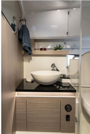
Jeanneau Cap Camarat 9.0 WA - wash basin in toilet compartment