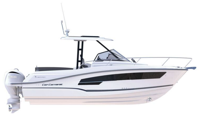
Jeanneau Cap Camarat 9.0 WA - diagram of side view