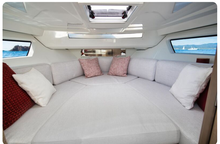
Jeanneau Cap Camarat 9.0 WA Series 2 - forward cabin with island double berth