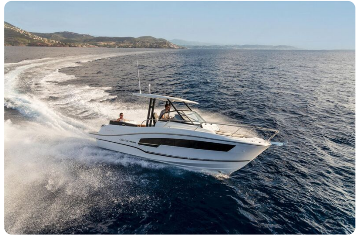
Jeanneau Cap Camarat 9.0 WA - with long wake