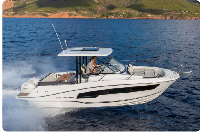
Jeanneau Cap Camarat 9.0 WA Series 2