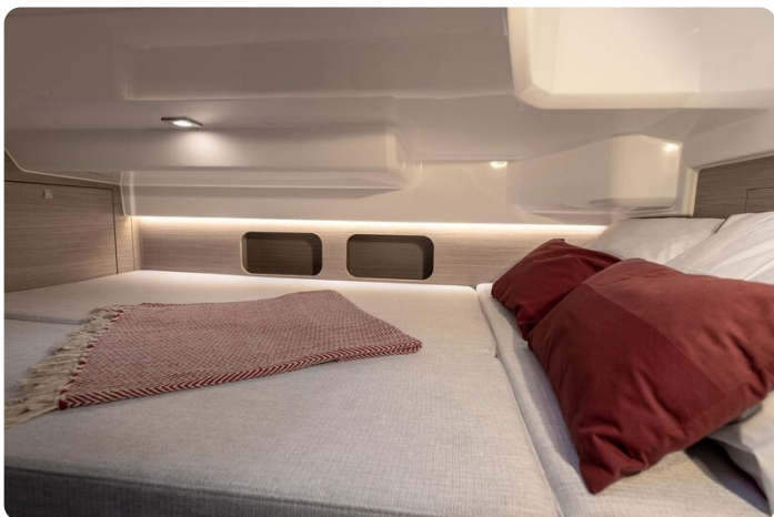
Jeanneau Cap Camarat 9.0 WA Series 2 - aft cabin