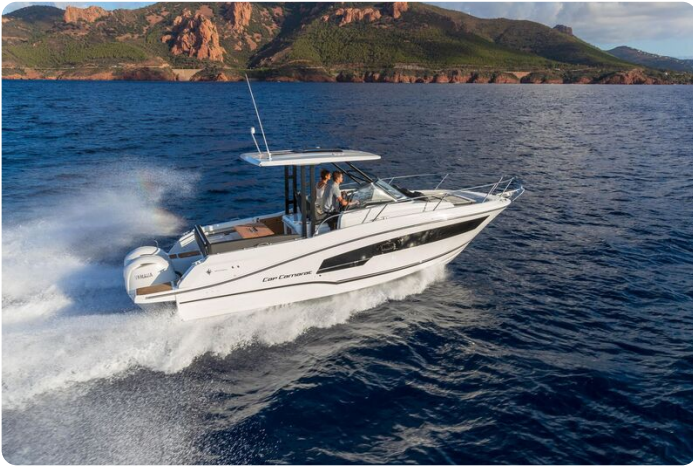
Jeanneau Cap Camarat 9.0 WA - starboard side