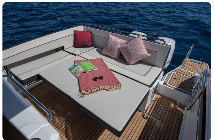
Jeanneau Cap Camarat 9.0 WA - aft cockpit sun lounger