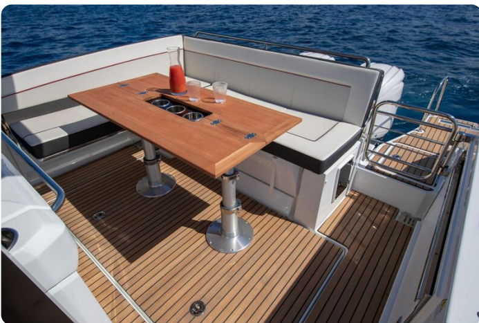
Jeanneau Cap Camarat 9.0 WA - aft cockpit seating and table