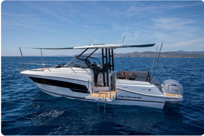
Jeanneau Cap Camarat 9.0 WA - port side folding terrace to increase cockpit space and give easy access to the sea