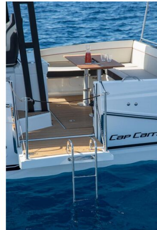
Jeanneau Cap Camarat 9.0 WA - port side terrace with boarding ladder