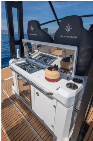
Jeanneau Cap Camarat 9.0 WA - exterior galley