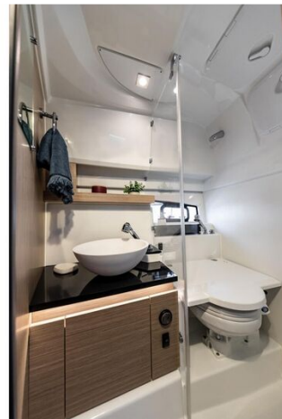
Jeanneau Cap Camarat 9.0 WA Series 2 -