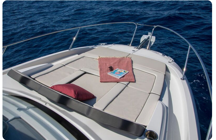
Jeanneau Cap Camarat 9.0 WA - bow sun lounger with infill cushion