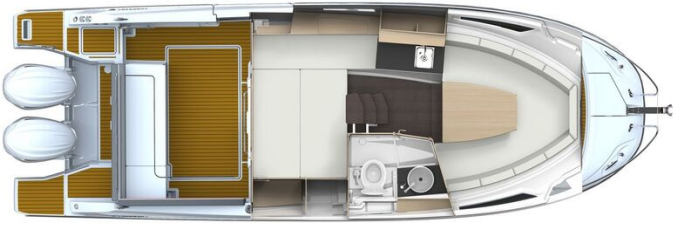
Jeanneau Cap Camarat 9.0 WA - diagram of cabins layout