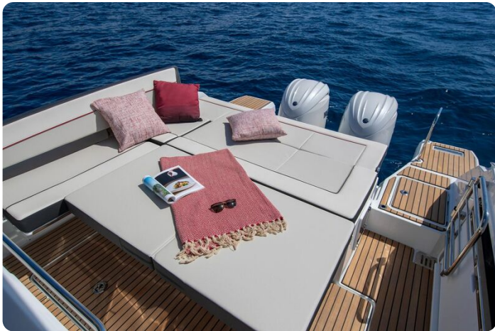
Jeanneau Cap Camarat 9.0 WA - aft cockpit bench folds down to extend sun lounger