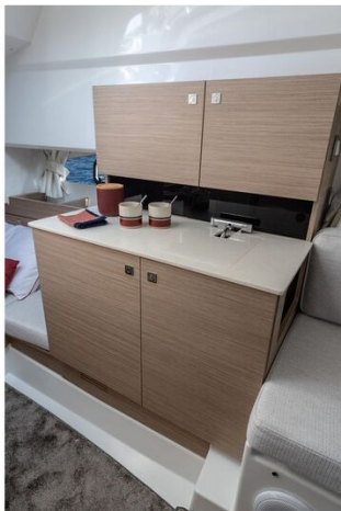
Jeanneau Cap Camarat 9.0 WA Series 2 - interior galley and saloon