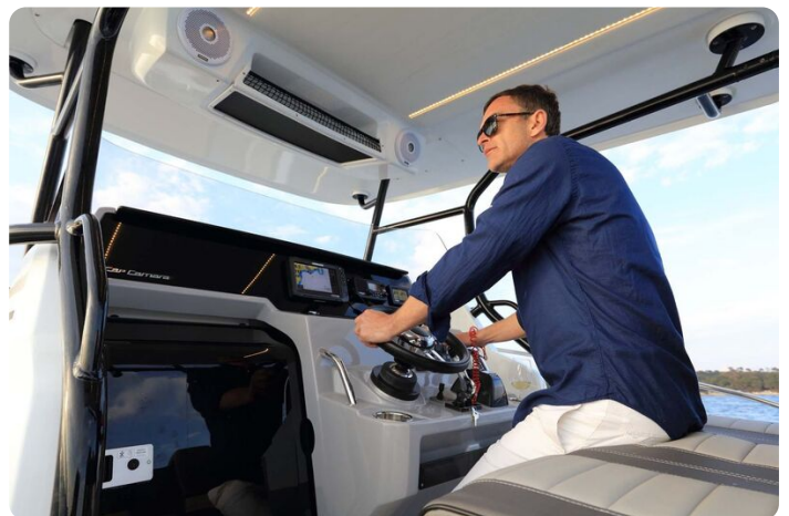
Jeanneau Cap Camarat 9.0 CC - helm position and plexi door to cabin