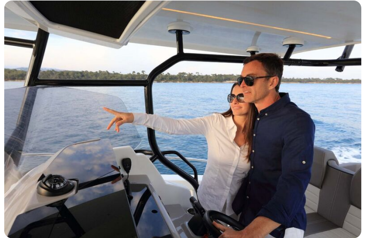
Jeanneau Cap Camarat 9.0 CC - two people at helm position