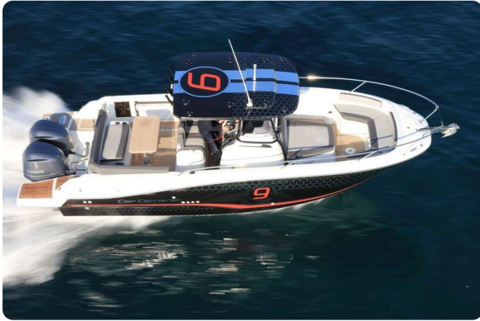
Jeanneau Cap Camarat 9.0 CC