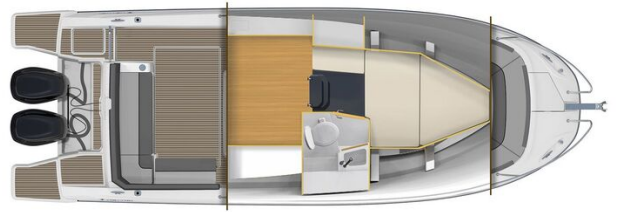
Jeanneau Cap Camarat 9.0 CC - diagram of cabin and toilet compartment layout