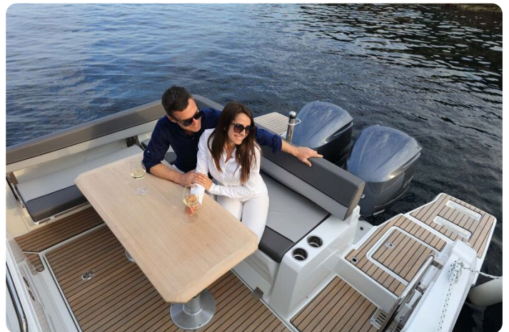
Jeanneau Cap Camarat 9.0 CC - aft cockpit bench seat and table