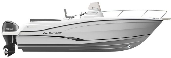
Jeanneau Cap Camarat 9.0 CC - diagram of side view