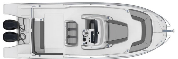
Jeanneau Cap Camarat 9.0 CC - layout diagram of cockpit