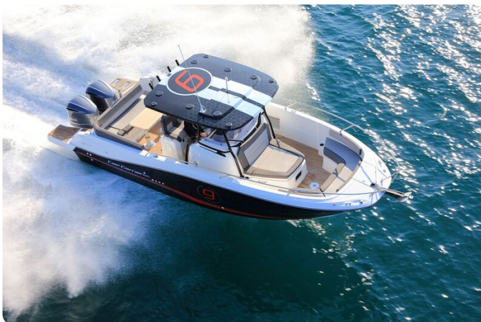
Jeanneau Cap Camarat 9.0 CC - overhead view and bow seating