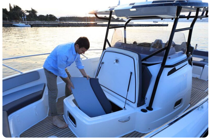
Jeanneau Cap Camarat 9.0 CC - access to cabin from bow