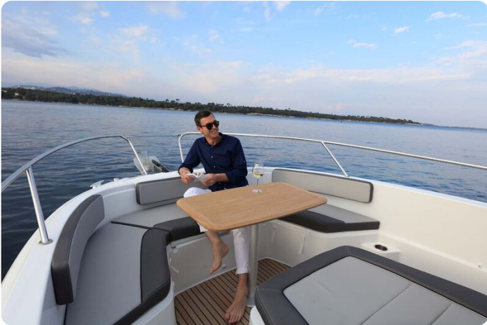
Jeanneau Cap Camarat 9.0 CC - front cockpit table and seating