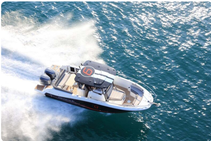
Jeanneau Cap Camarat 9.0 CC - overhead view on the water