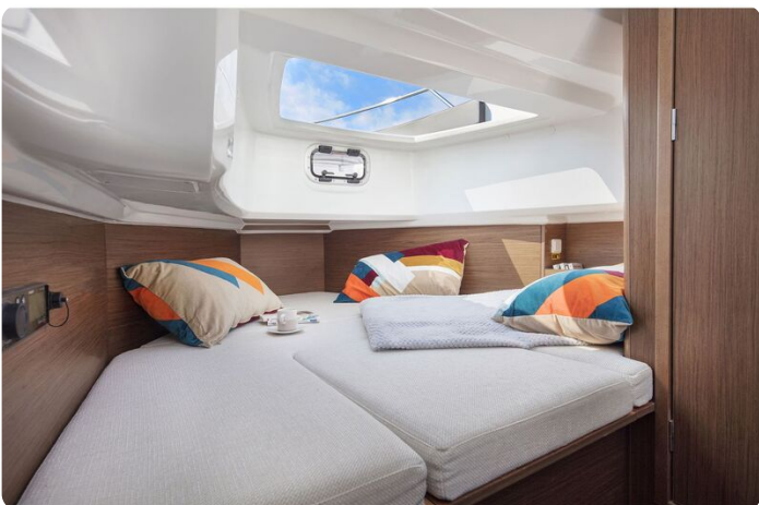
Jeanneau Cap Camarat 9.0 CC - double berth in cabin