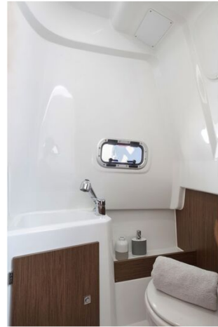
Jeanneau Cap Camarat 9.0 CC - toilet and shower compartment