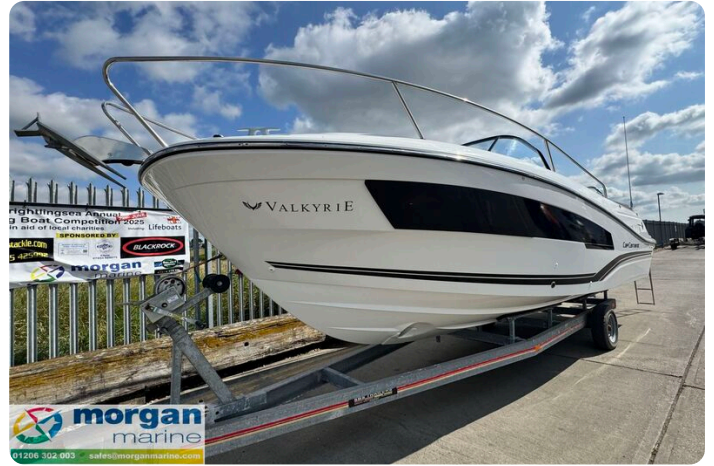
Jeanneau Cap Camarat 7.5 WA S3 - bow