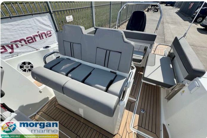
Jeanneau Cap Camarat 7.5 WA S3 - bolster seats