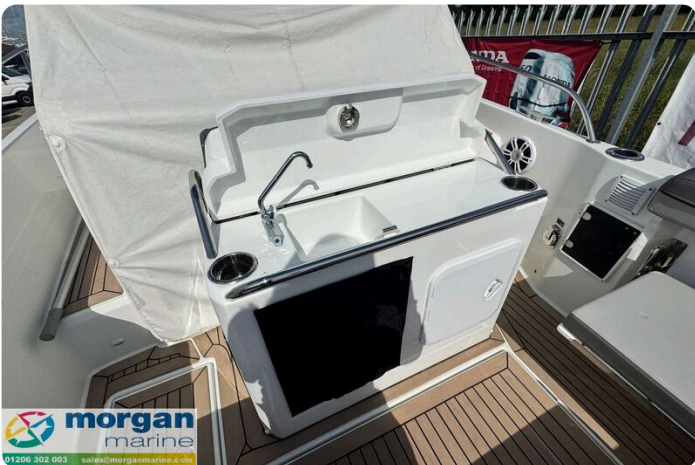
Jeanneau Cap Camarat 7.5 WA S3 - cockpit sink