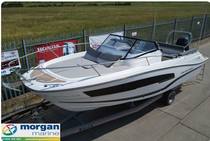
Jeanneau Cap Camarat 7.5 WA S3 - bow seating