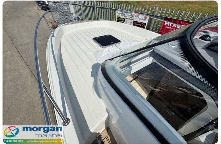
Jeanneau Cap Camarat 7.5 WA S3 - deck