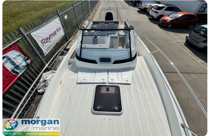
Jeanneau Cap Camarat 7.5 WA S3 - deck hatch