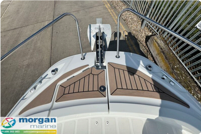
Jeanneau Cap Camarat 7.5 WA S3 - bow locker