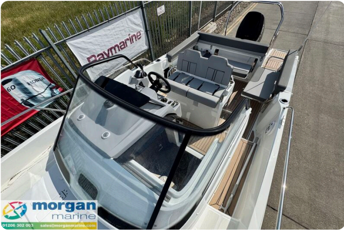
Jeanneau Cap Camarat 7.5 WA S3 - windscreen