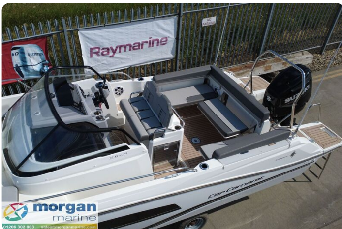
Jeanneau Cap Camarat 7.5 WA S3 - bolster seats