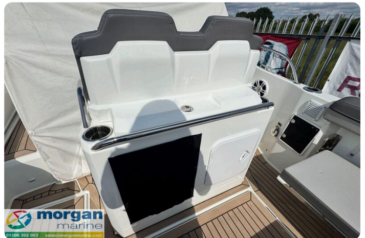
Jeanneau Cap Camarat 7.5 WA S3 - cockpit galley