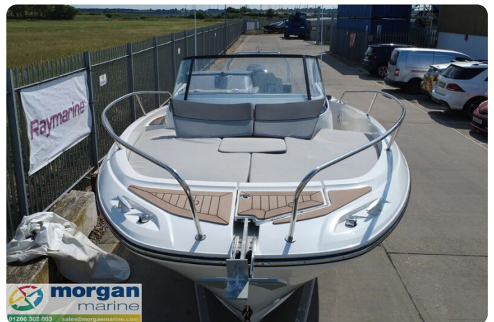
Jeanneau Cap Camarat 7.5 WA S3 - anchor