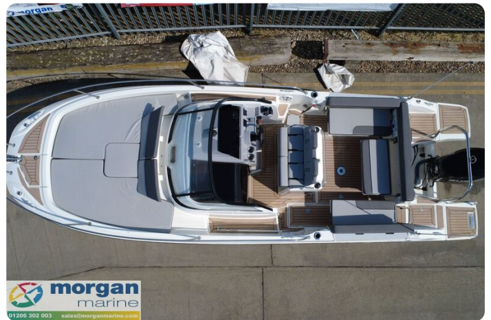
Jeanneau Cap Camarat 7.5 WA S3 - top view