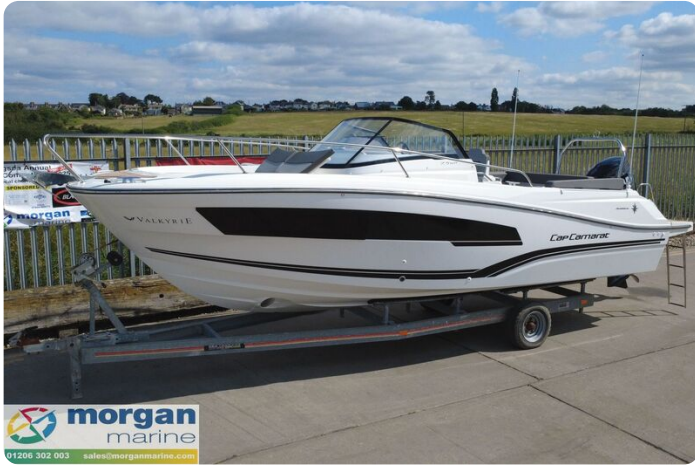
Jeanneau Cap Camarat 7.5 WA S3 - Main