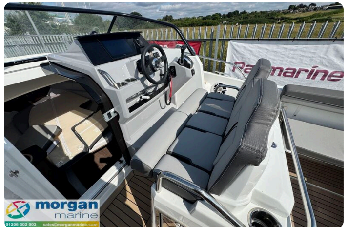
Jeanneau Cap Camarat 7.5 WA S3 - wheel