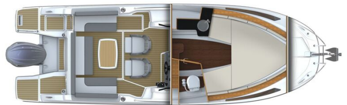
Jeanneau Cap Camarat 7.5 WA - diagram of cockpit seating around table and cabin layout