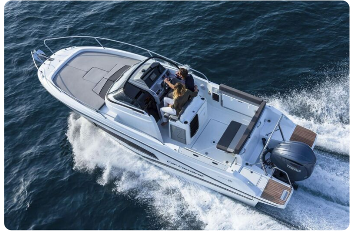
Jeanneau Cap Camarat 7.5 WA