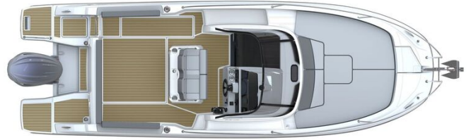
Jeanneau Cap Camarat 7.5 WA - diagram of cockpit with seats folded