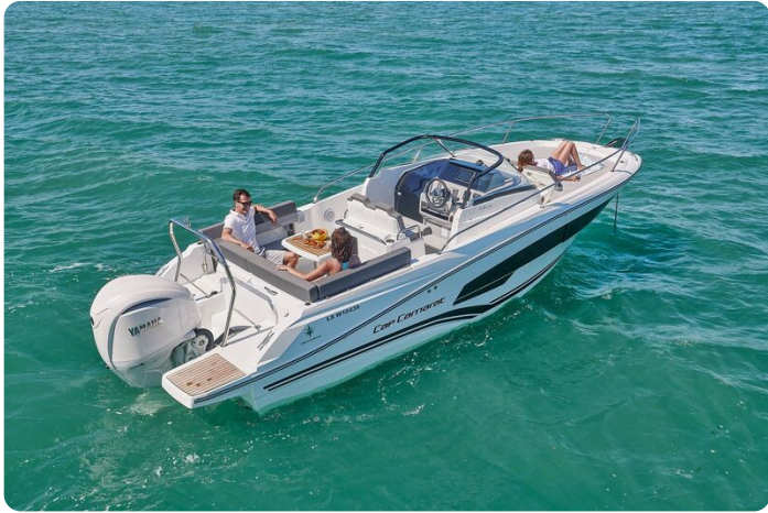
Jeanneau Cap Camarat 7.5 WA - plenty of seating