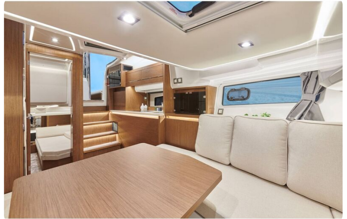
Jeanneau Cap Camarat 12.5 WA - forward cabin / saloon