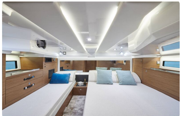
Jeanneau Cap Camarat 12.5 WA - aft cabin