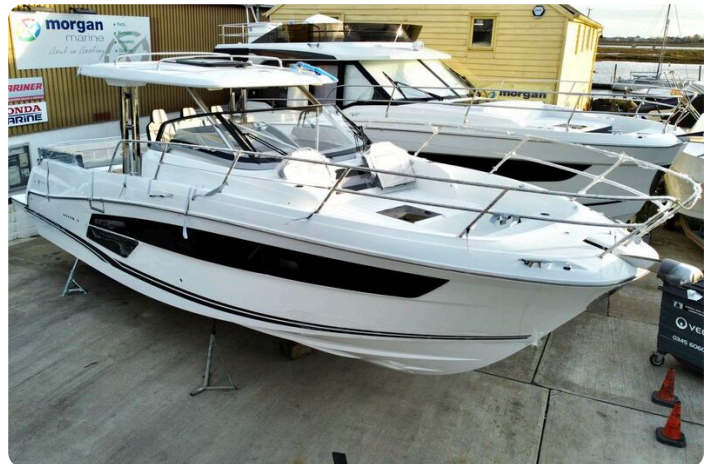
Jeanneau Cap Camarat 12.5 WA in Morgan Marine's yard