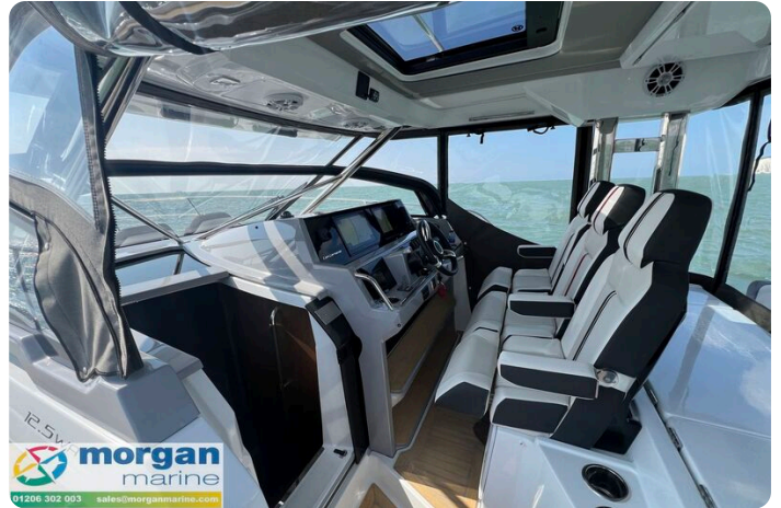
Jeanneau Cap Camarat 12.5 WA - door to cabin