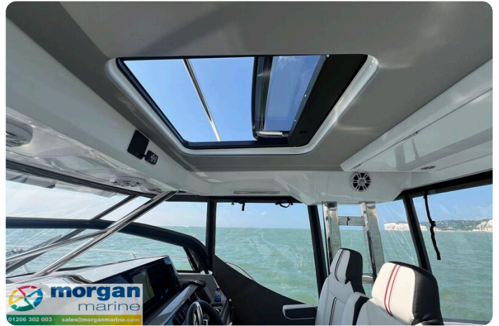
Jeanneau Cap Camarat 12.5 WA - hard top with electric sliding roof