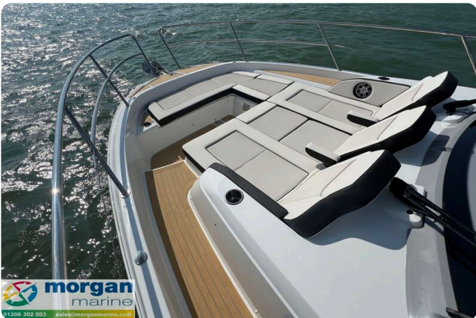
Jeanneau Cap Camarat 12.5 WA - side deck towards bow