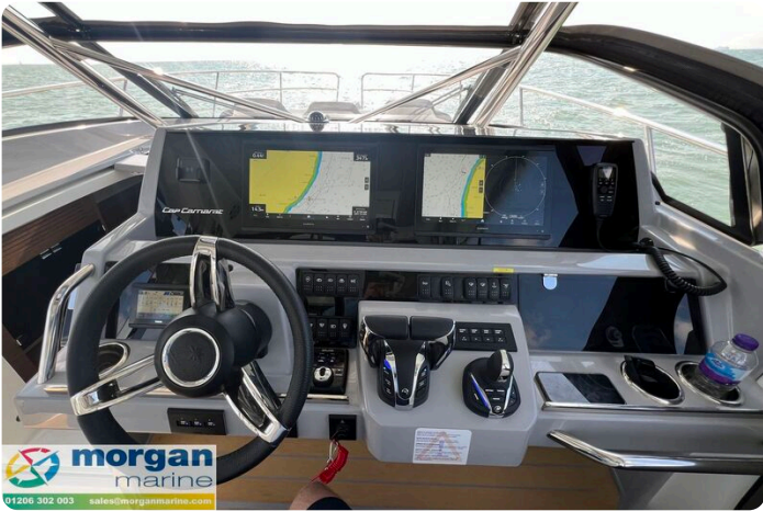
Jeanneau Cap Camarat 12.5 WA - full helm position