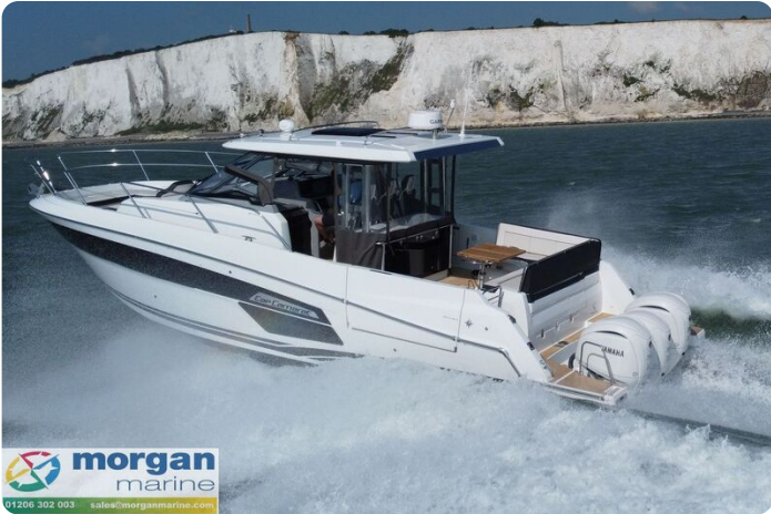
Jeanneau Cap Camarat 12.5 WA - port side aft