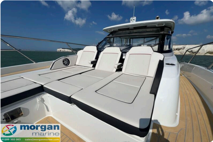
Jeanneau Cap Camarat 12.5 WA - seating on bow