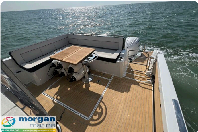
Jeanneau Cap Camarat 12.5 WA - cockpit