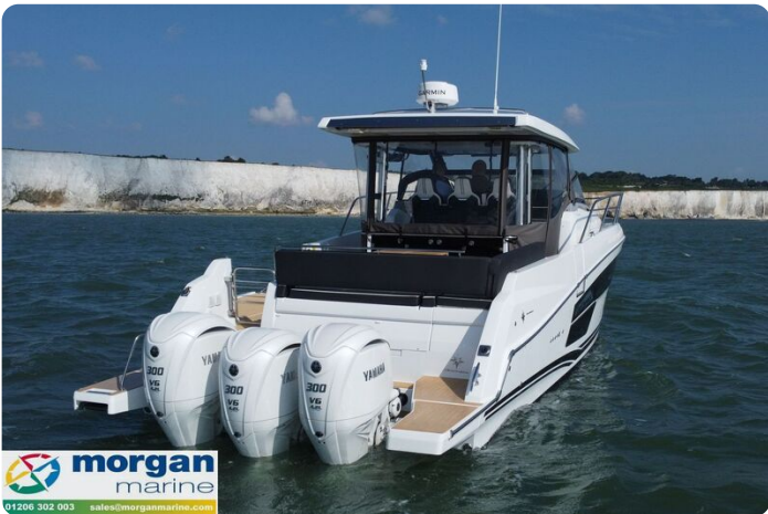
Jeanneau Cap Camarat 12.5 WA - transom from starboard side aft