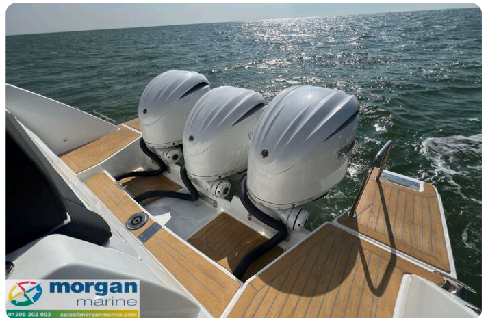
Jeanneau Cap Camarat 12.5 WA - triple Yamaha outboards from the swim platform