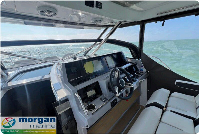
Jeanneau Cap Camarat 12.5 WA - helm position with great visibility