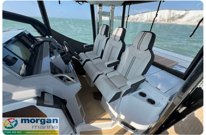
Jeanneau Cap Camarat 12.5 WA - engine controls and triple seats