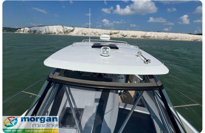
Jeanneau Cap Camarat 12.5 WA - overhead view of hardtop roof