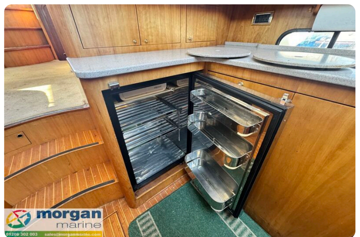
Humber 42 TSDY - fridge