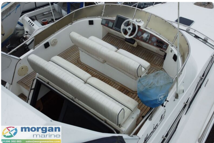
Humber 42 - fly seating