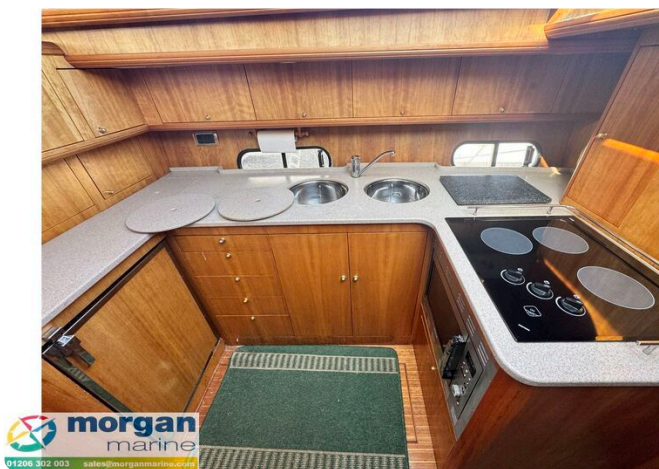
Humber 42 TSDY - sink