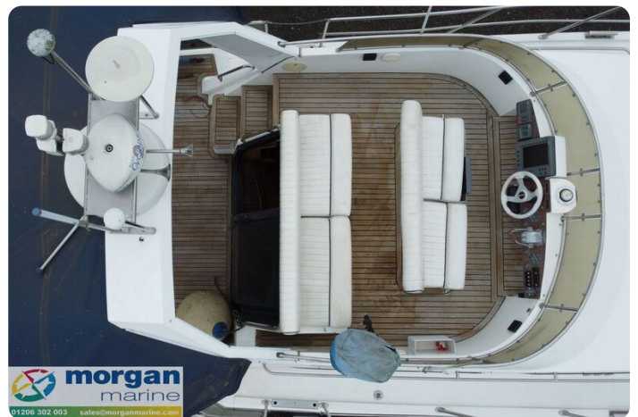
Humber 42 - seating