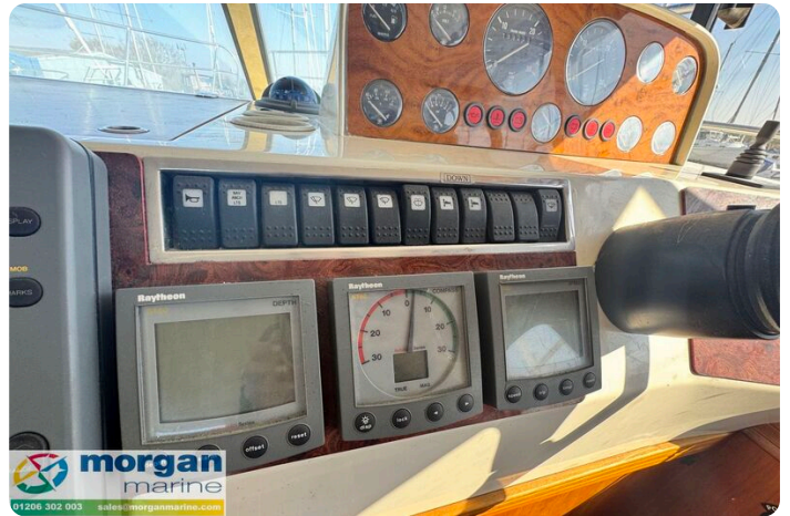
Humber 42 TSDY - controls