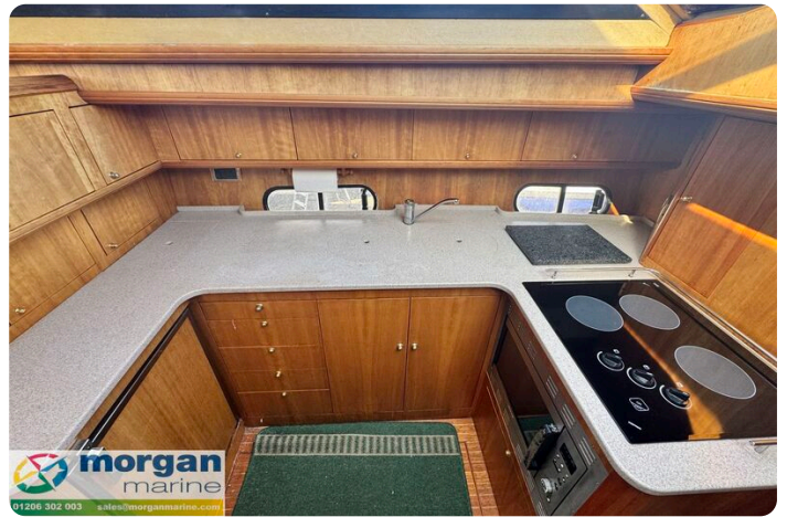
Humber 42 TSDY - galley