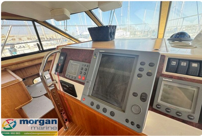
Humber 42 TSDY - plotter