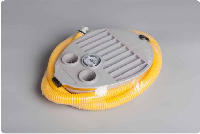
Highfield UL 340 aluminium RIB - pump