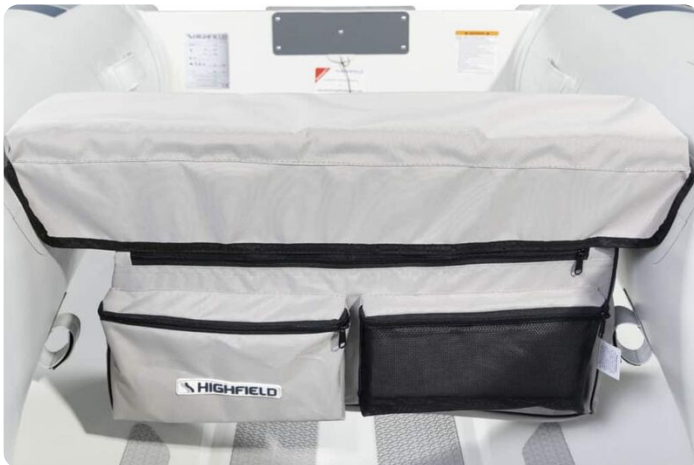
Highfield UL 340 aluminium RIB - storage