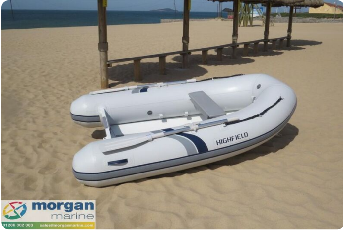
Highfield UL 340 aluminium RIB