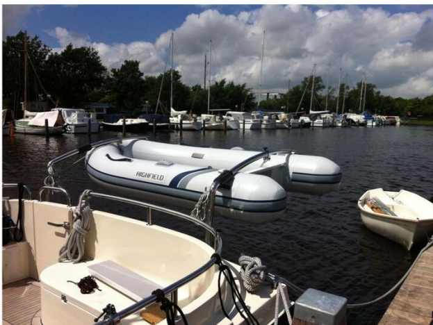
Highfield UL 340 aluminium RIB - on a larger boat