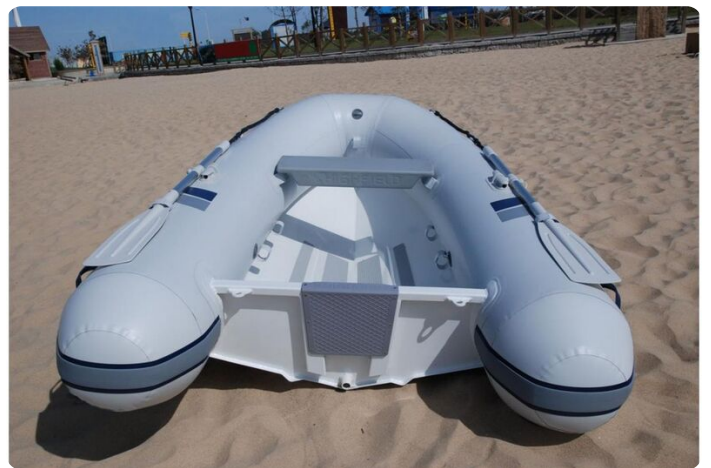
Highfield UL 340 aluminium RIB - overhead view