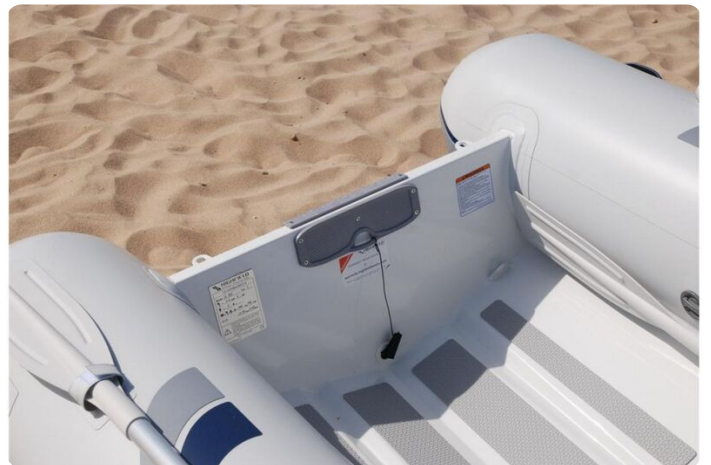
Highfield UL 340 aluminium RIB - deck and transom