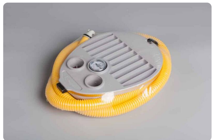
Highfield UL 340 aluminium-RIB - pump