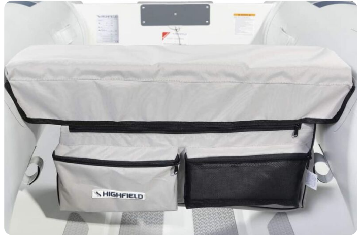
Highfield UL 340 aluminium-RIB - storage