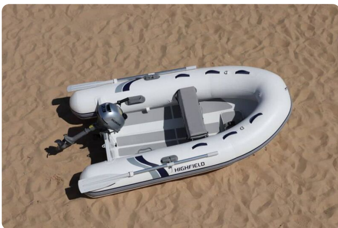
Highfield UL 290 aluminium-RIB - on a beach